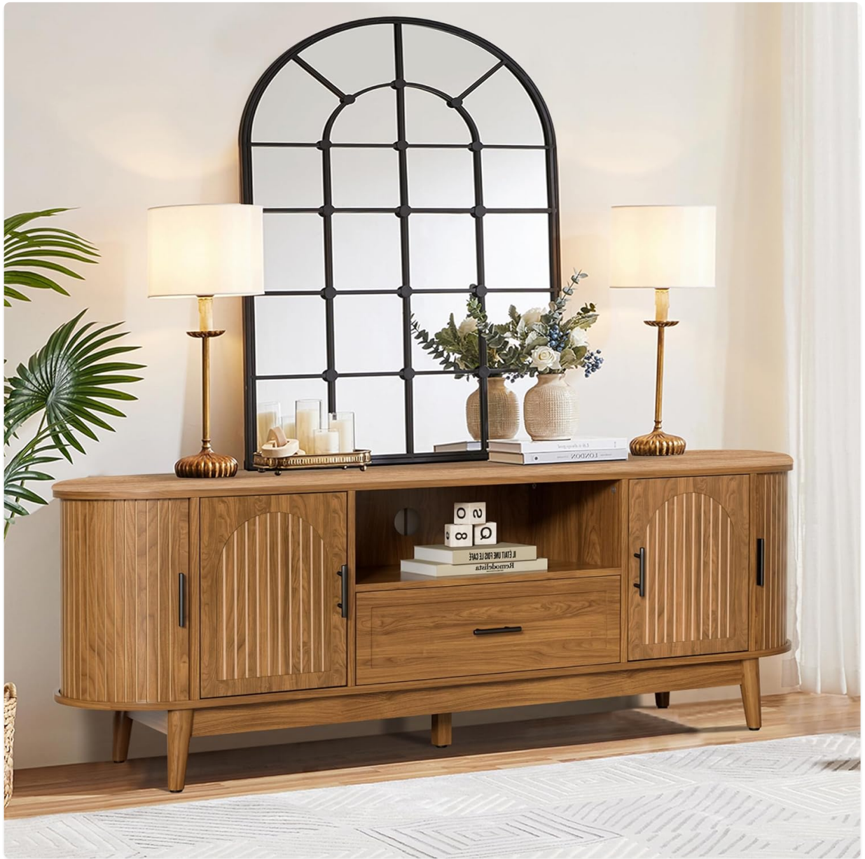
Image: The Mxtxmy 63-inch Fluted TV Stand, showcasing its mid-century modern design with fluted doors and a walnut finish, positioned beneath a large arched mirror with two table lamps on top.