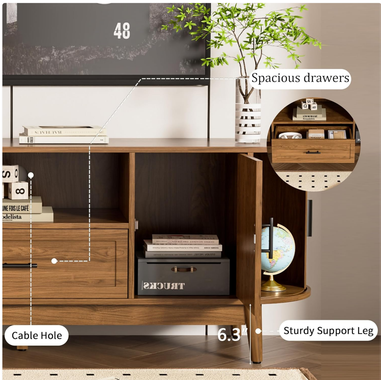
Image: A detailed view of the TV stand's features, including the cable management hole for organizing wires, the spacious central drawer, and the sturdy support leg with adjustable foot.