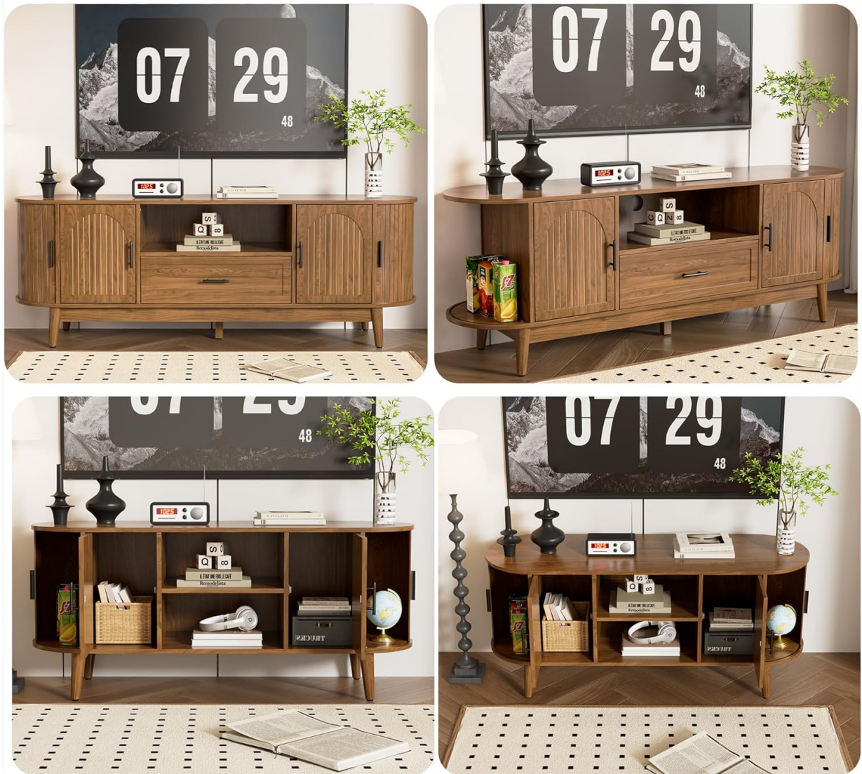
Image: A collage highlighting key product details: tall legs allowing for easy cleaning underneath, a spacious tabletop for various items, and the smooth operation of the fluted sliding doors.