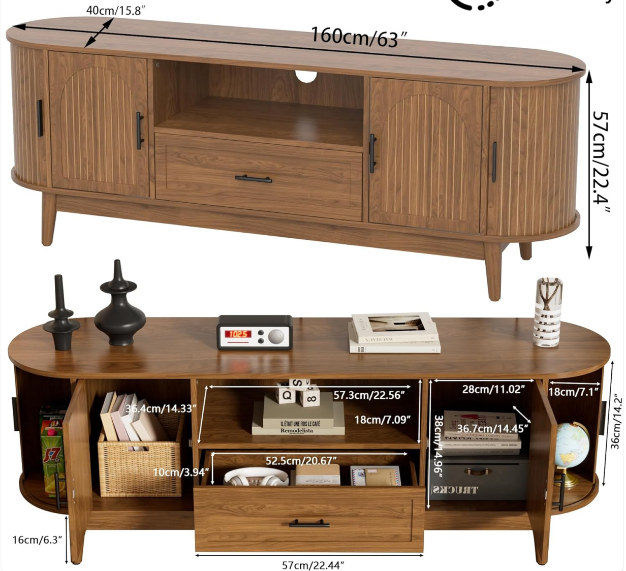
Image: A detailed diagram illustrating the overall dimensions of the TV stand (63" L x 15.8" D x 22.4" H) and the internal measurements of its storage compartments, including the central drawer and side cabinets.

Refer to the included assembly instructions for a complete list of hardware and panels. Typically, the package includes: