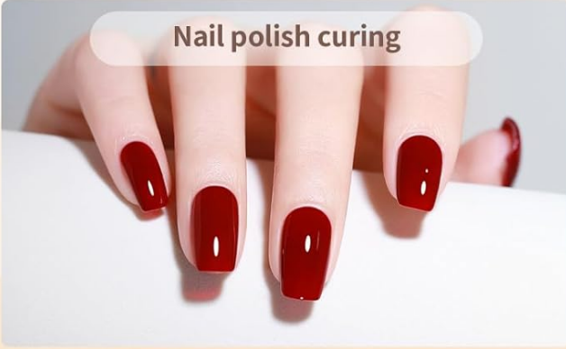
Nail polish curing