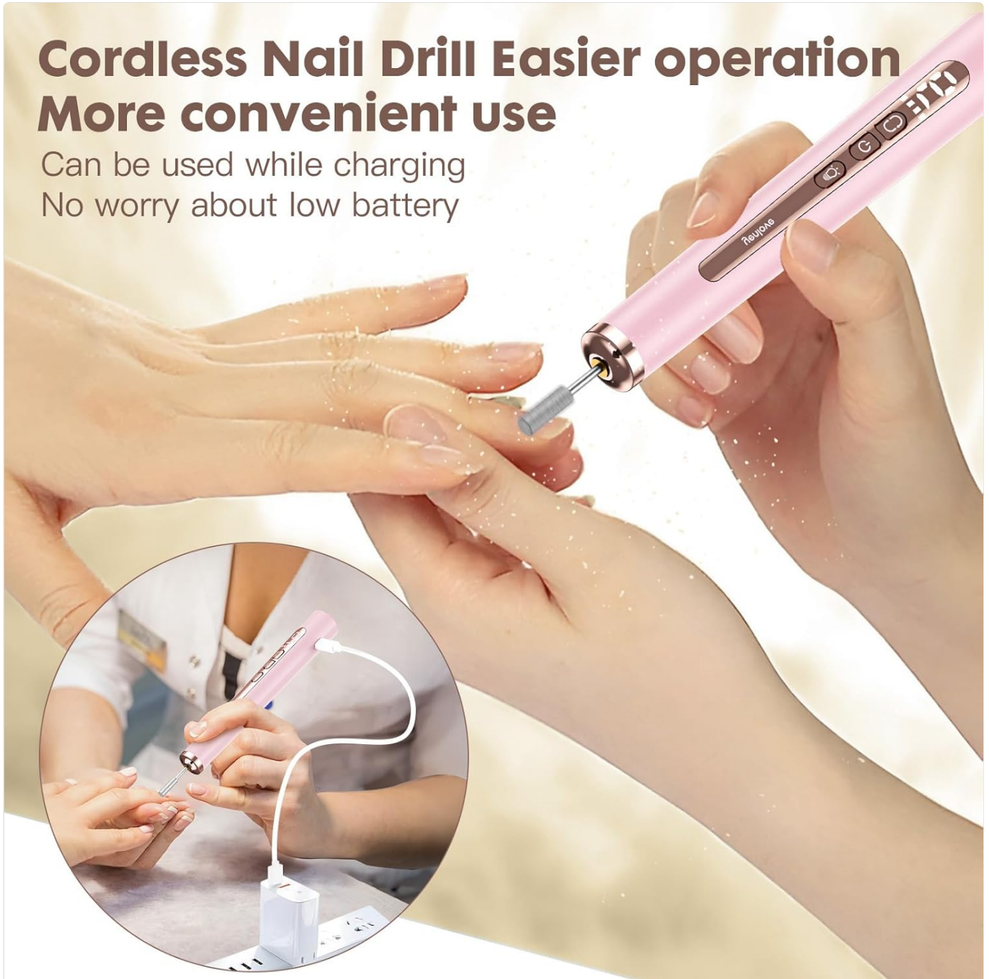
Image: A detailed view of the YenLove Cordless Nail Drill, highlighting the ON/OFF button, 9 Speed Gear Button, battery indicator, and Type-C port.

Can be used while charging No worry about low battery