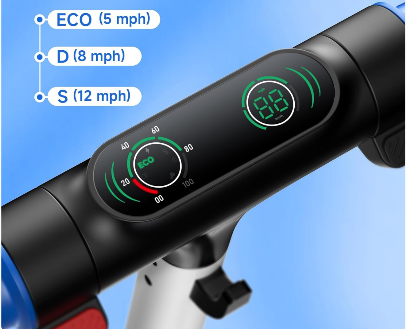
Figure 3.1: The kid-friendly LED display provides real-time riding information.

Your browser does not support the video tag.