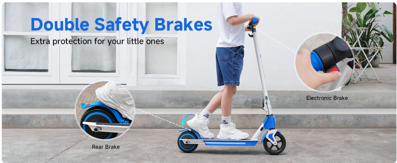
Figure 3.2: Illustration of the dual safety braking system for quick and secure stops.