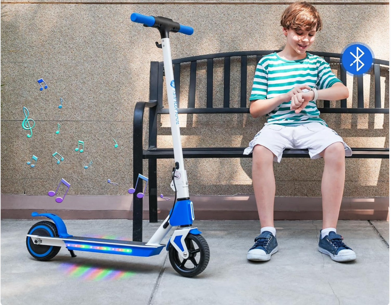
Figure 3.3: Smart control allows Bluetooth music playback directly from the scooter.

Sync Bluetooth to play your playlist hands-free