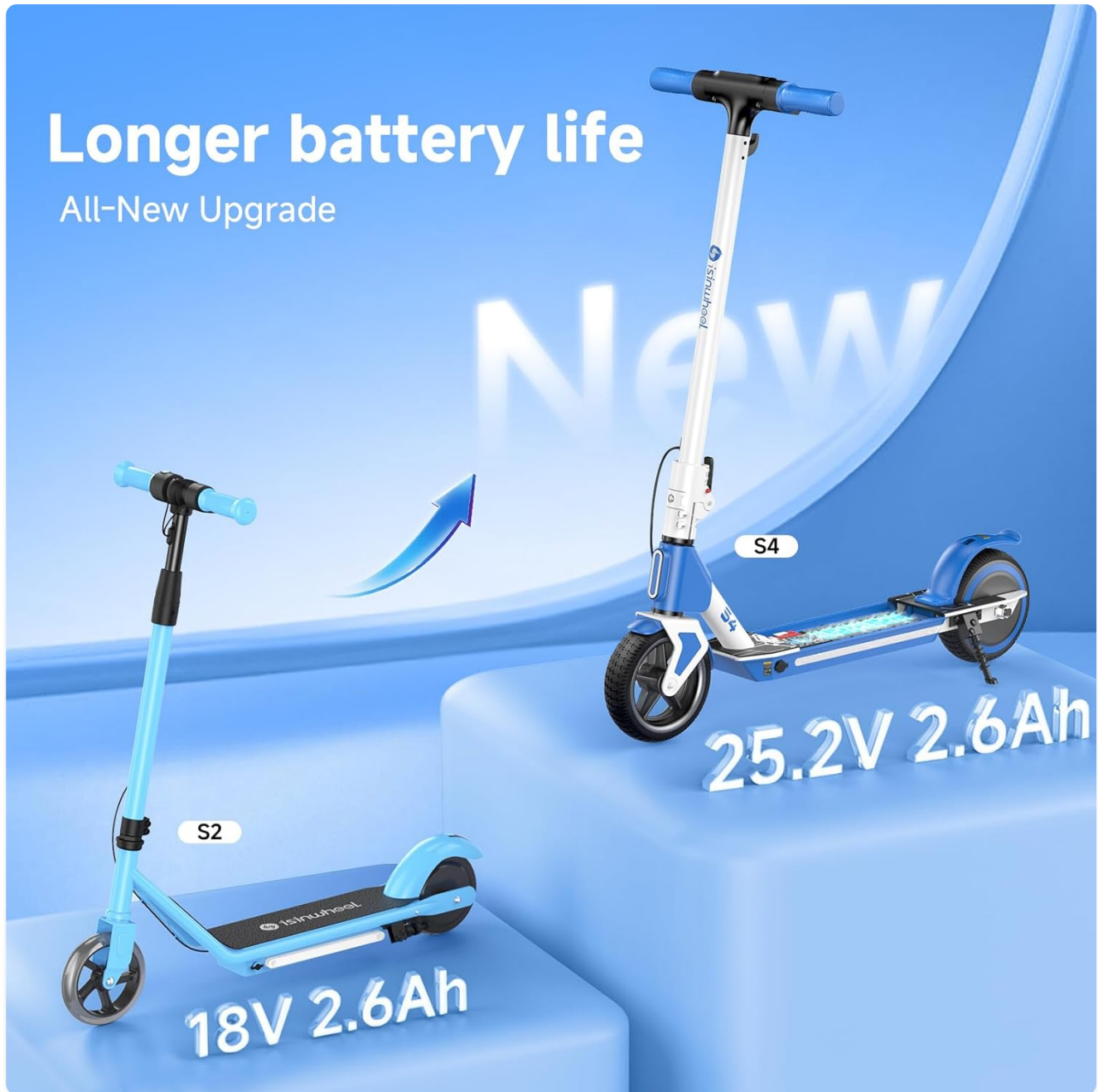
Figure 4.1: The S4 features an upgraded 25.2V 2.6Ah lithium-ion battery for extended playtime.

To charge the scooter, connect the charger to the charging port located on the scooter's deck. Plug the charger into a standard electrical outlet. The indicator light on the charger will change to indicate charging status (e.g., red for charging, green for fully charged). A full charge provides over 60 minutes of continuous fun.