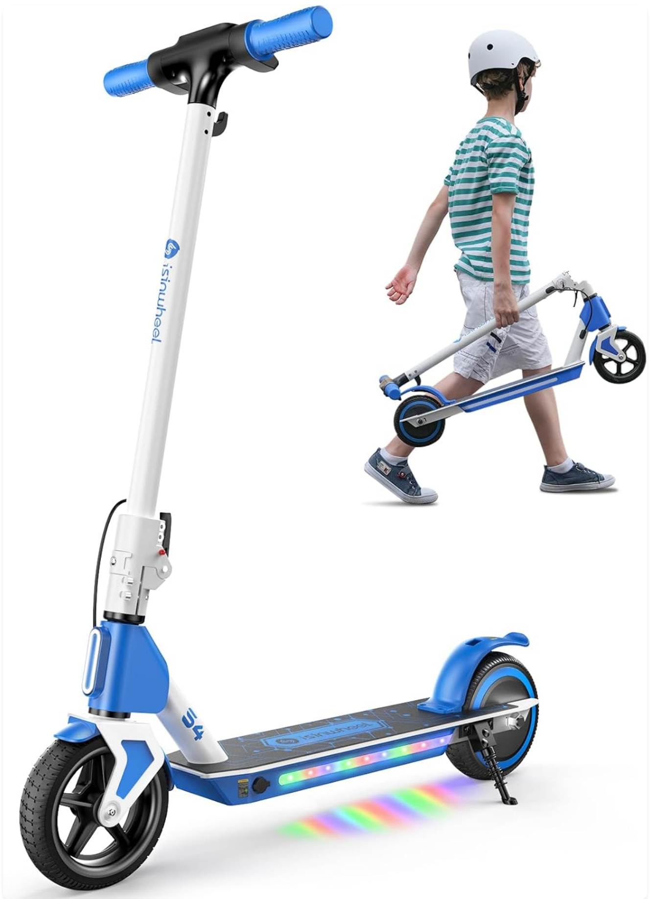
Figure 1: isinwheel S4 Electric Scooter (Blue model) and its compact folded form.