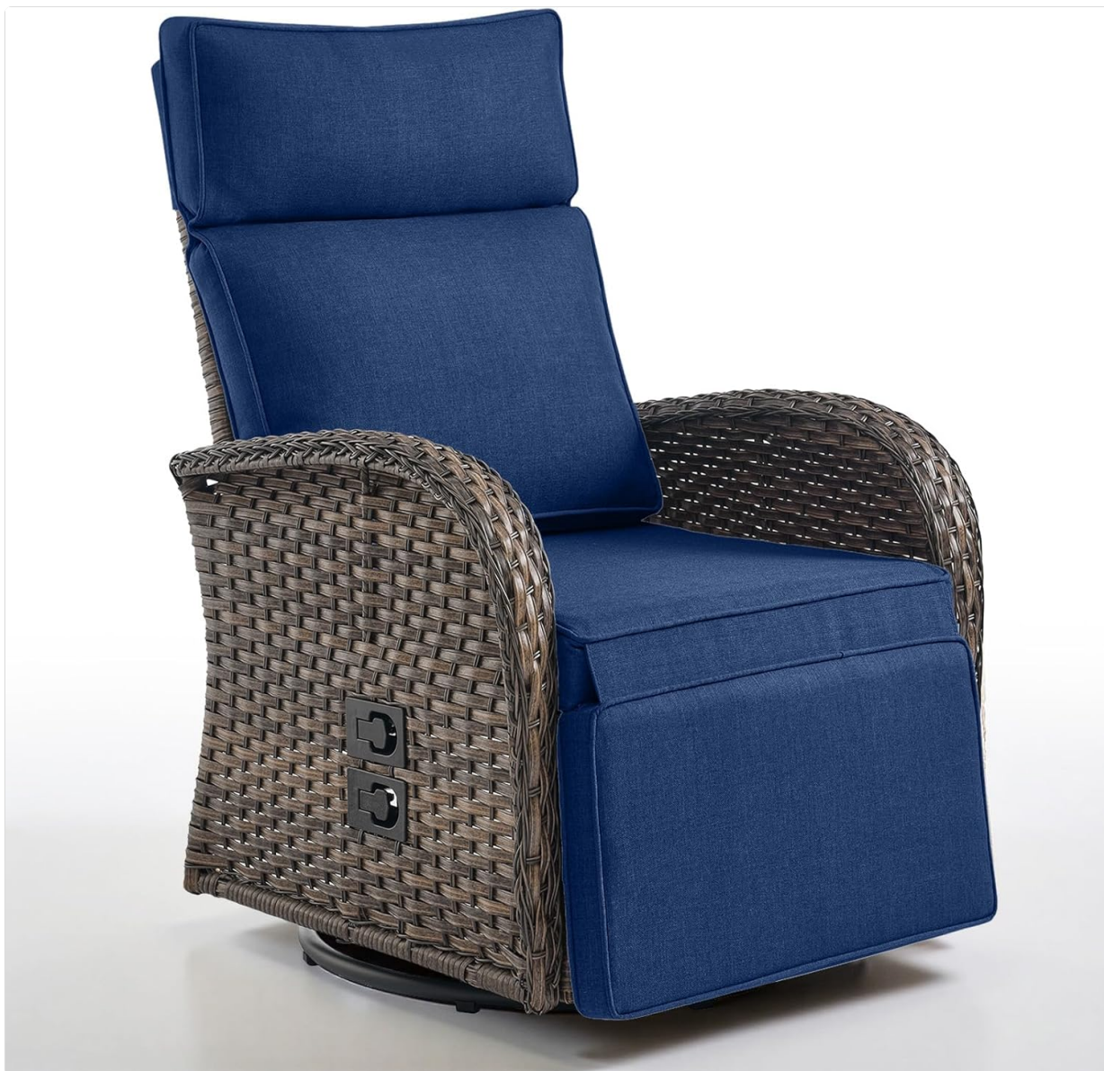
Figure 1.1: Belord Dual-Adjust Swivel Outdoor Recliner Chair. This image displays the recliner chair in its upright position, featuring brown wicker and blue cushions, highlighting its design and color.