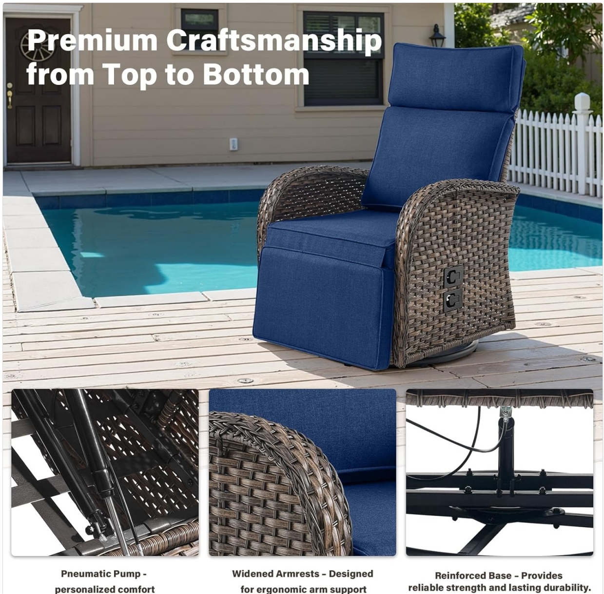
Figure 6.1: Premium Craftsmanship Details. This image showcases the pneumatic pump for personalized comfort, widened armrests for ergonomic support, and a reinforced base for strength and durability.