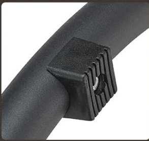
Footrest Restraint Strap