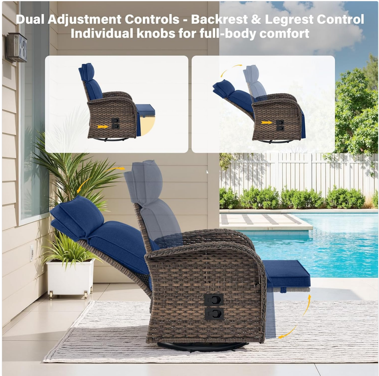
Figure 3.1: Dual adjustment controls for backrest and legrest. This image highlights the two individual control buttons on the side of the chair, demonstrating how they adjust the backrest and footrest independently for full-body comfort.