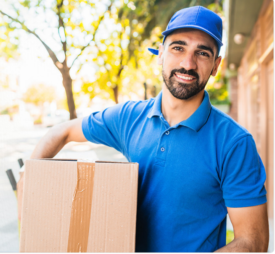
Figure 8.1: Customer Service and Shipping Information. This image depicts a delivery person with a package, symbolizing customer service and delivery support. It emphasizes dedication to customer satisfaction and timely updates.

We are dedicated to delivering outstanding customer service and timely updates. If you have any questions about your order, please contact us directly through Amazon, and we will check the status of your shipment within 24 hours. As our furniture sets are large and shipped in multiple boxes, they may arrive on different days. Rest assured, the remaining items are on their way. Your satisfaction is our top priority!