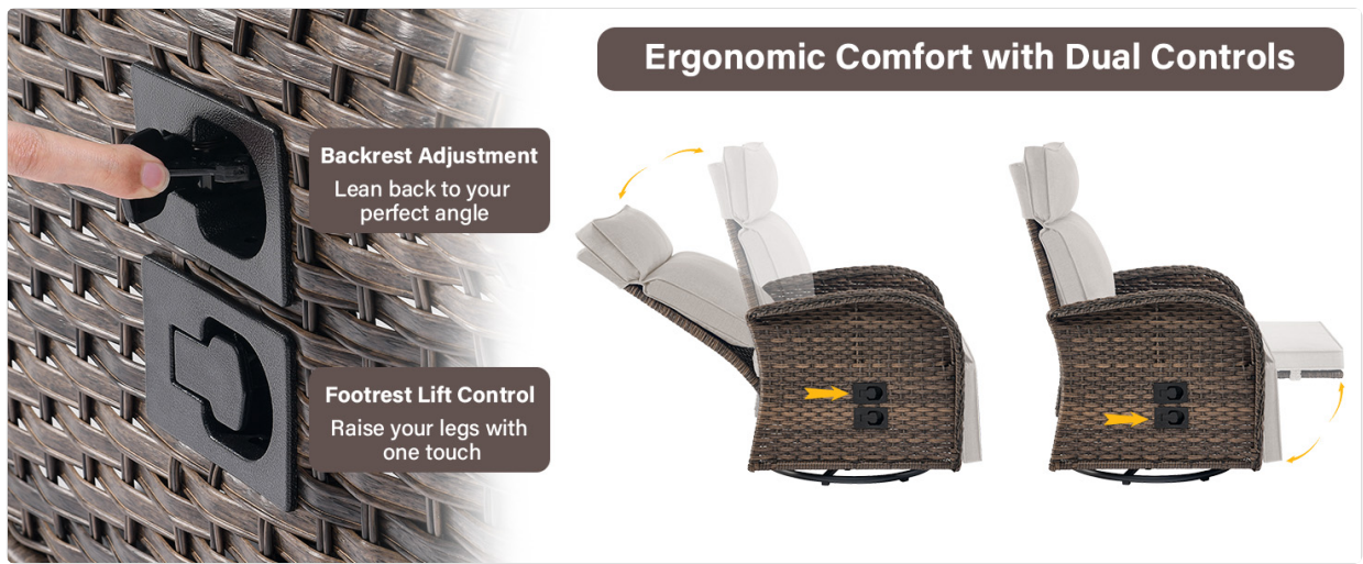
Figure 3.2: Close-up of backrest and footrest controls. This image provides a detailed view of the two control levers, showing how one is used to lean back and the other to raise the legs.