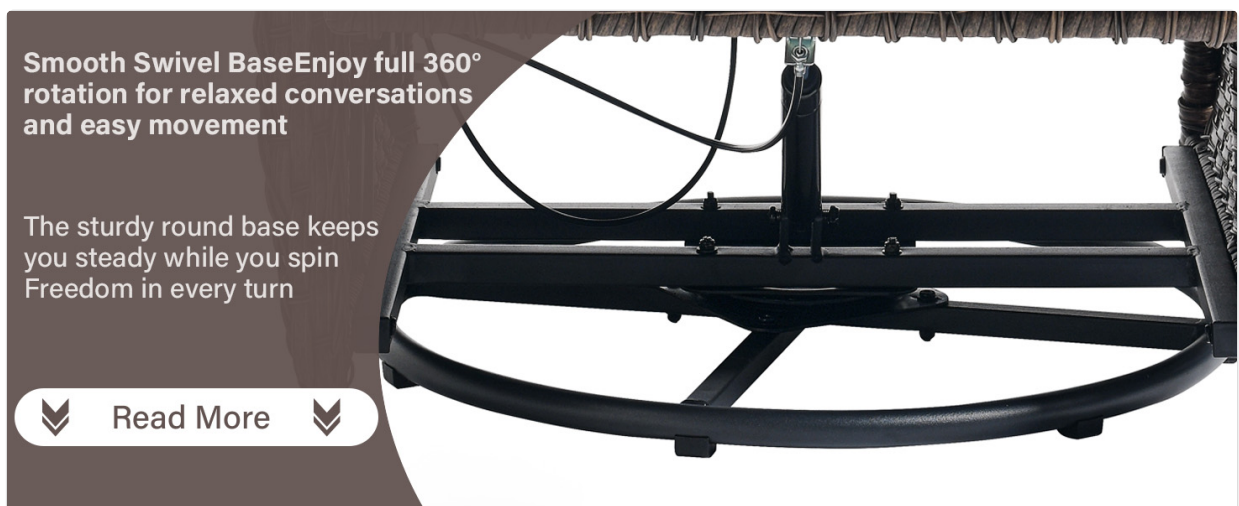
Figure 2.2: Detail of the smooth swivel base. This image shows the sturdy round base of the chair, designed for full 360-degree rotation and stability.