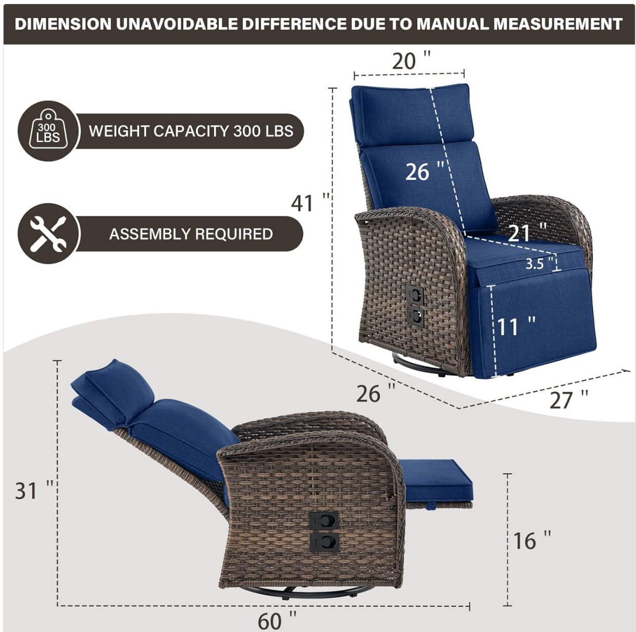
Figure 2.1: Product dimensions and assembly requirement. This image illustrates the chair's dimensions in both upright and reclined positions, indicating a weight capacity of 300 lbs and confirming that assembly is required.