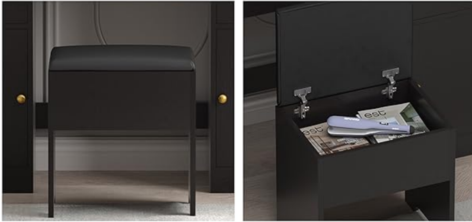
Figure 5.1.2: Vanity stool with hidden storage for small items.