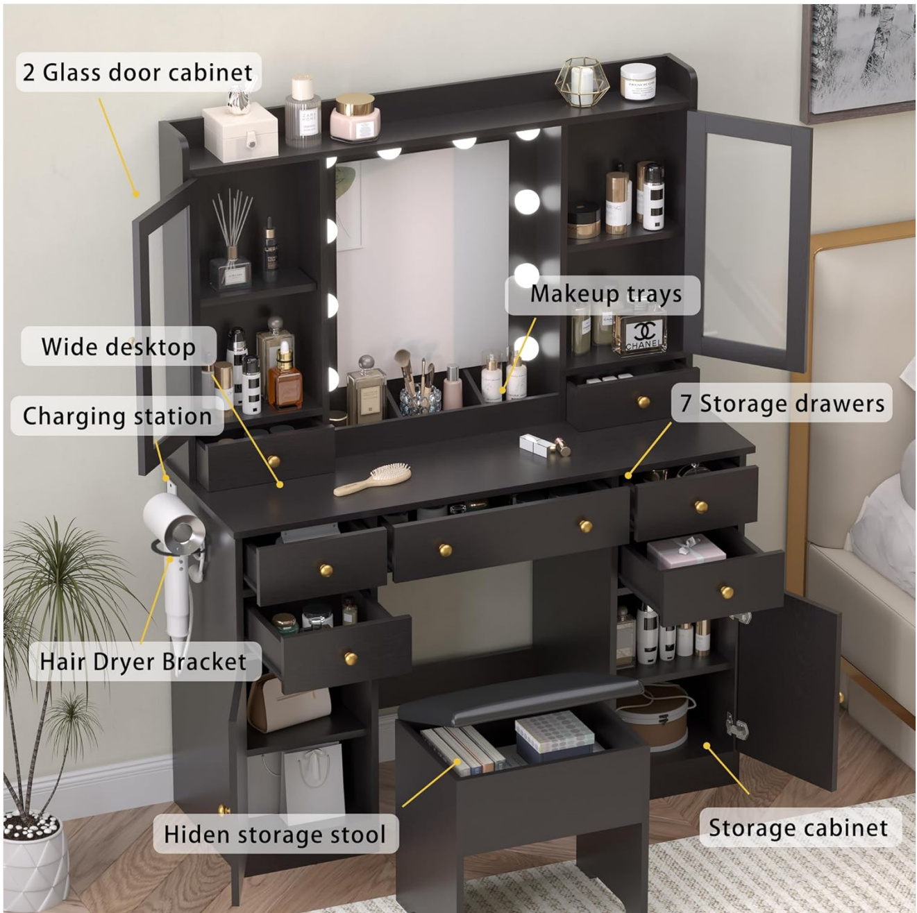
Figure 5.1.1: Detailed view of storage options including drawers, glass cabinets, and open shelves.