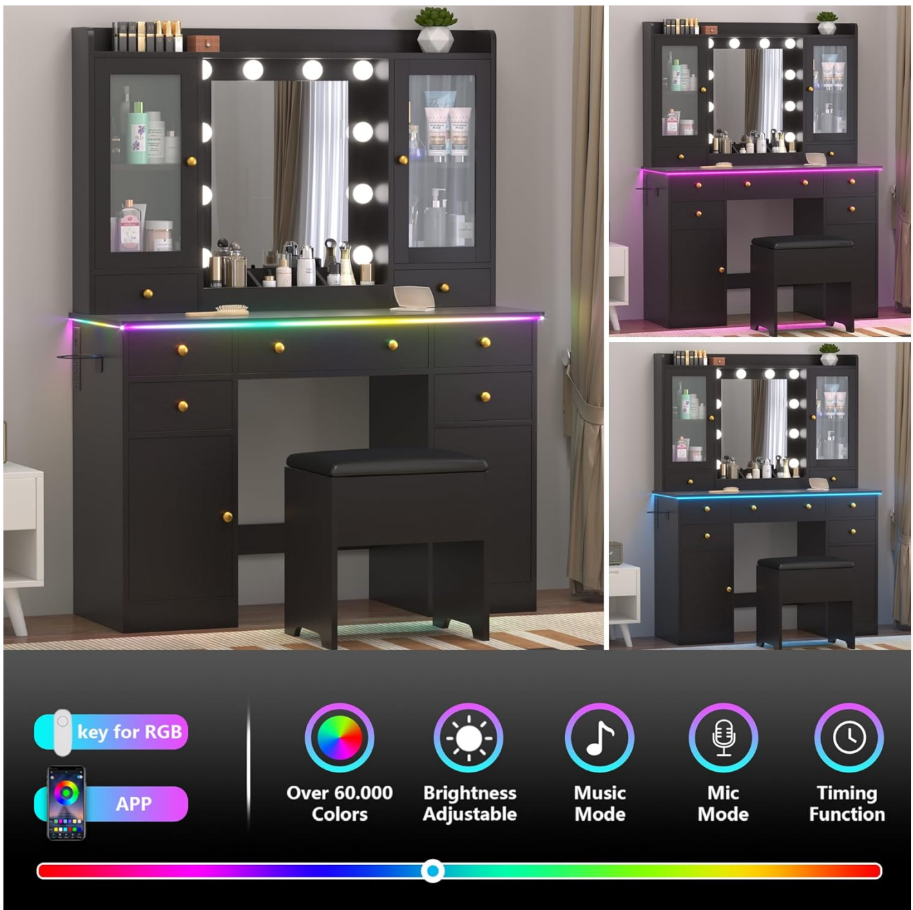
Figure 5.3.2: RGB LED strip functionality and control options.