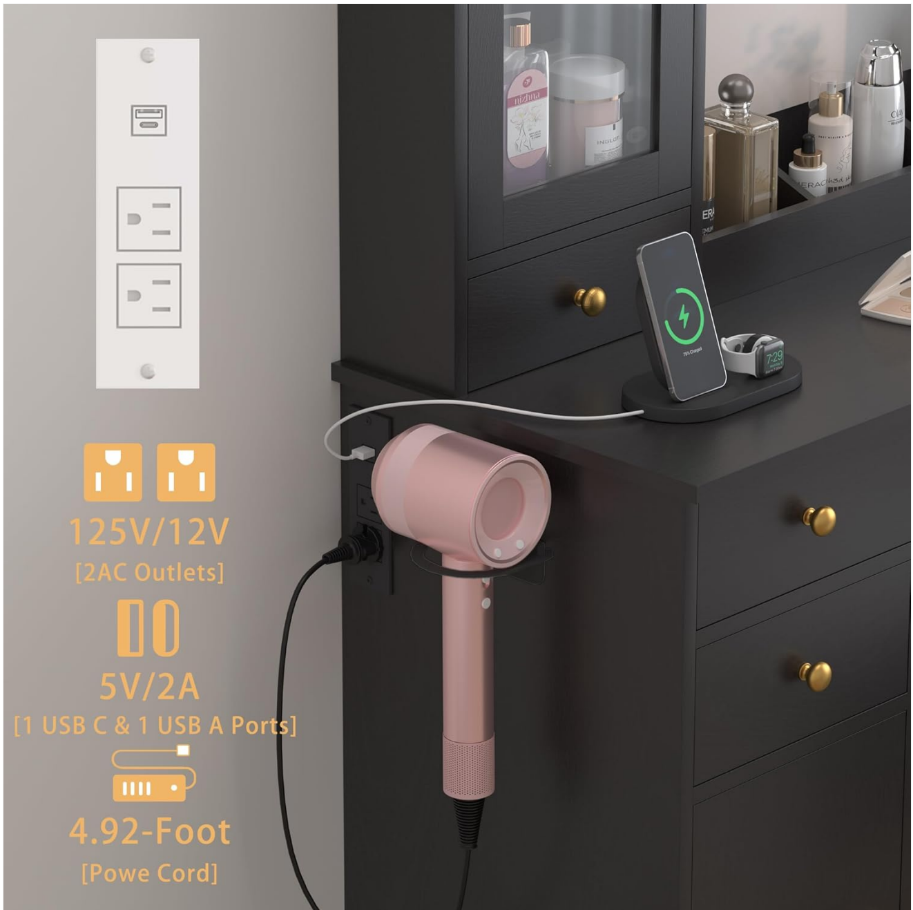
Figure 5.2.1: Built-in power outlet and hair dryer rack for easy access to power and storage.