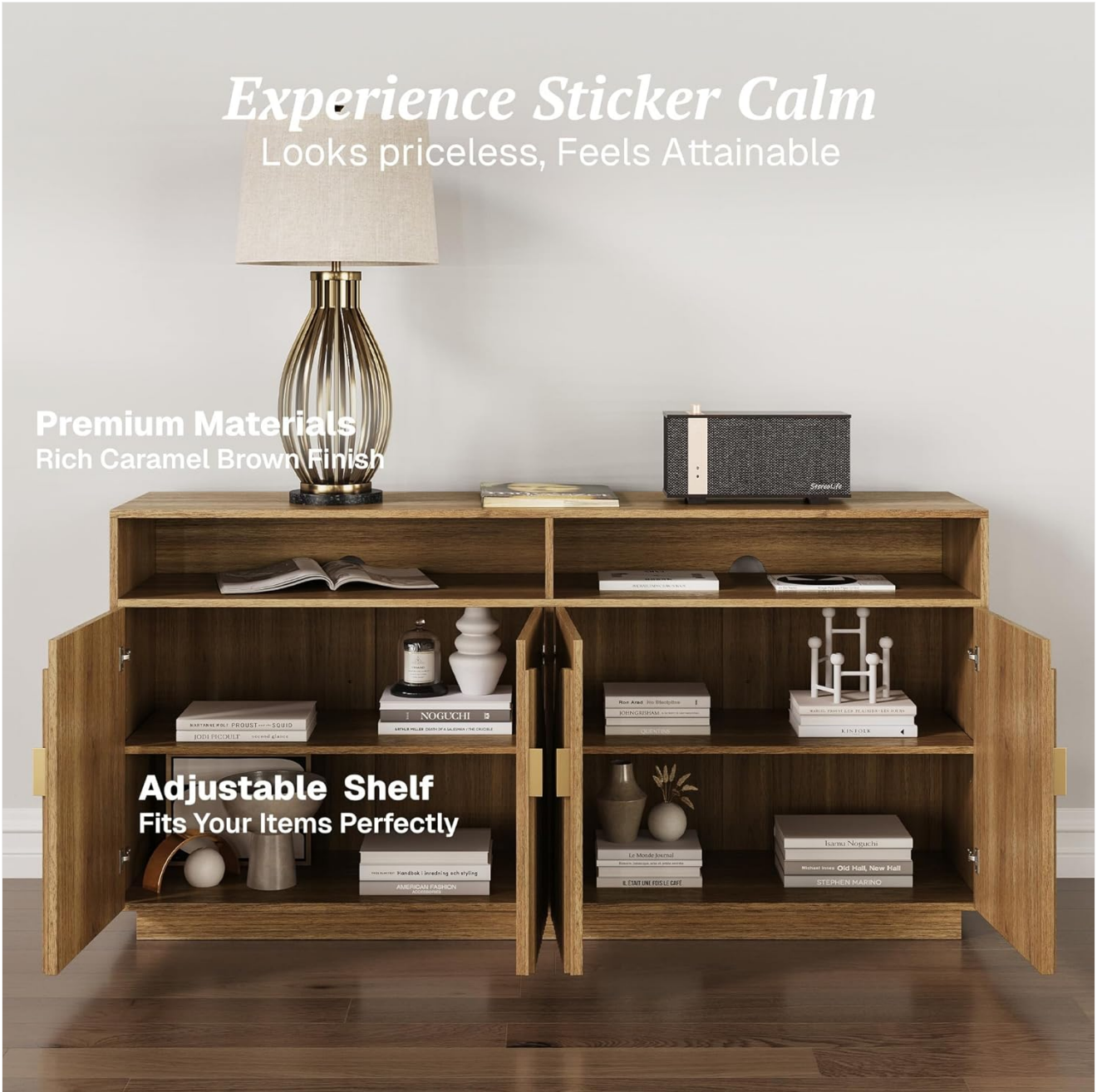
Image: Interior view of the TV stand, highlighting the adjustable shelves and ample storage space within the cabinets.

Adjustable Shelf Fits Your Items Perfectly