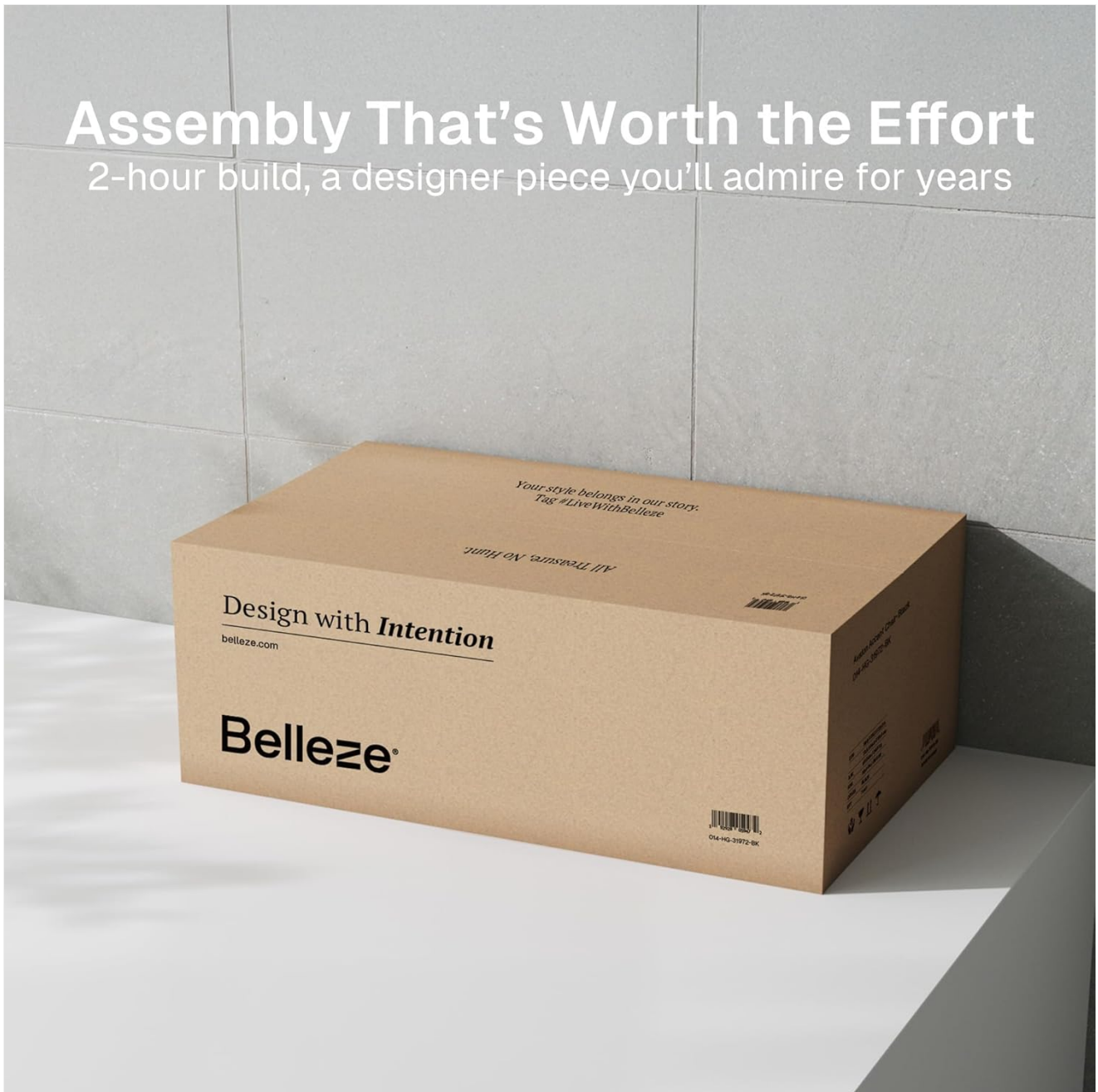
Image: Packaging for the BELLEZE TV Stand, indicating assembly is required.