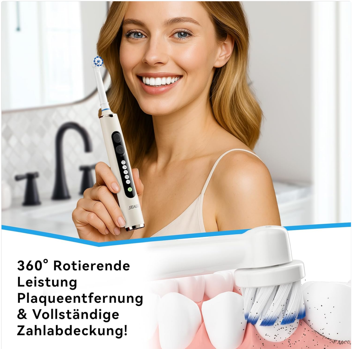
Figure 5: Illustration of the 360° rotating cleaning power, demonstrating effective plaque removal and comprehensive tooth coverage.

For optimal results, apply a small amount of toothpaste to the brush head. Place the brush head against your teeth at a slight angle towards the gumline. Move the brush slowly from tooth to tooth, allowing the rotating bristles to clean each surface.