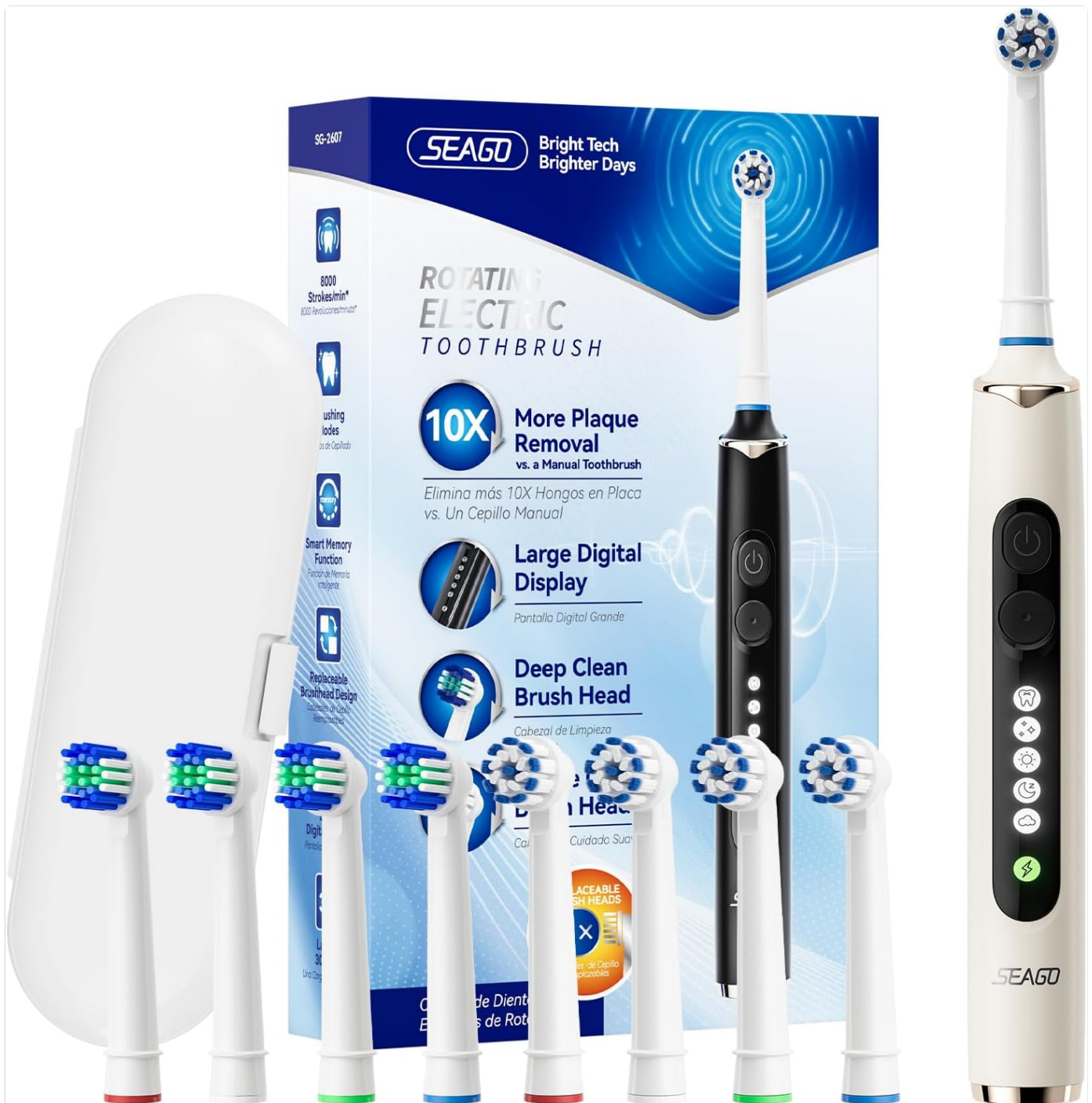
Figure 1: Seago SG2607 Electric Toothbrush, showing the main unit, travel case, and eight replacement brush heads, along with its packaging.

This package includes the main toothbrush unit, a travel case, a USB Type-C charging cable, and eight round replacement brush heads, ensuring extended use and convenience.