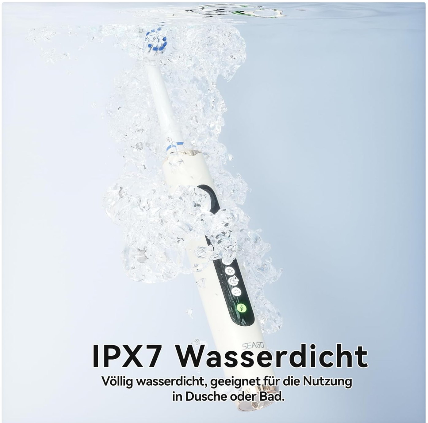
Figure 7: The toothbrush submerged in water, illustrating its IPX7 waterproof rating, making it suitable for use in the shower or bath.