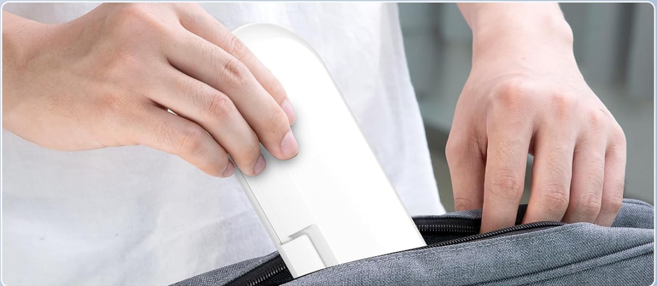
Figure 8: The toothbrush and brush heads neatly stored within the portable travel case, designed for easy and comfortable travel.