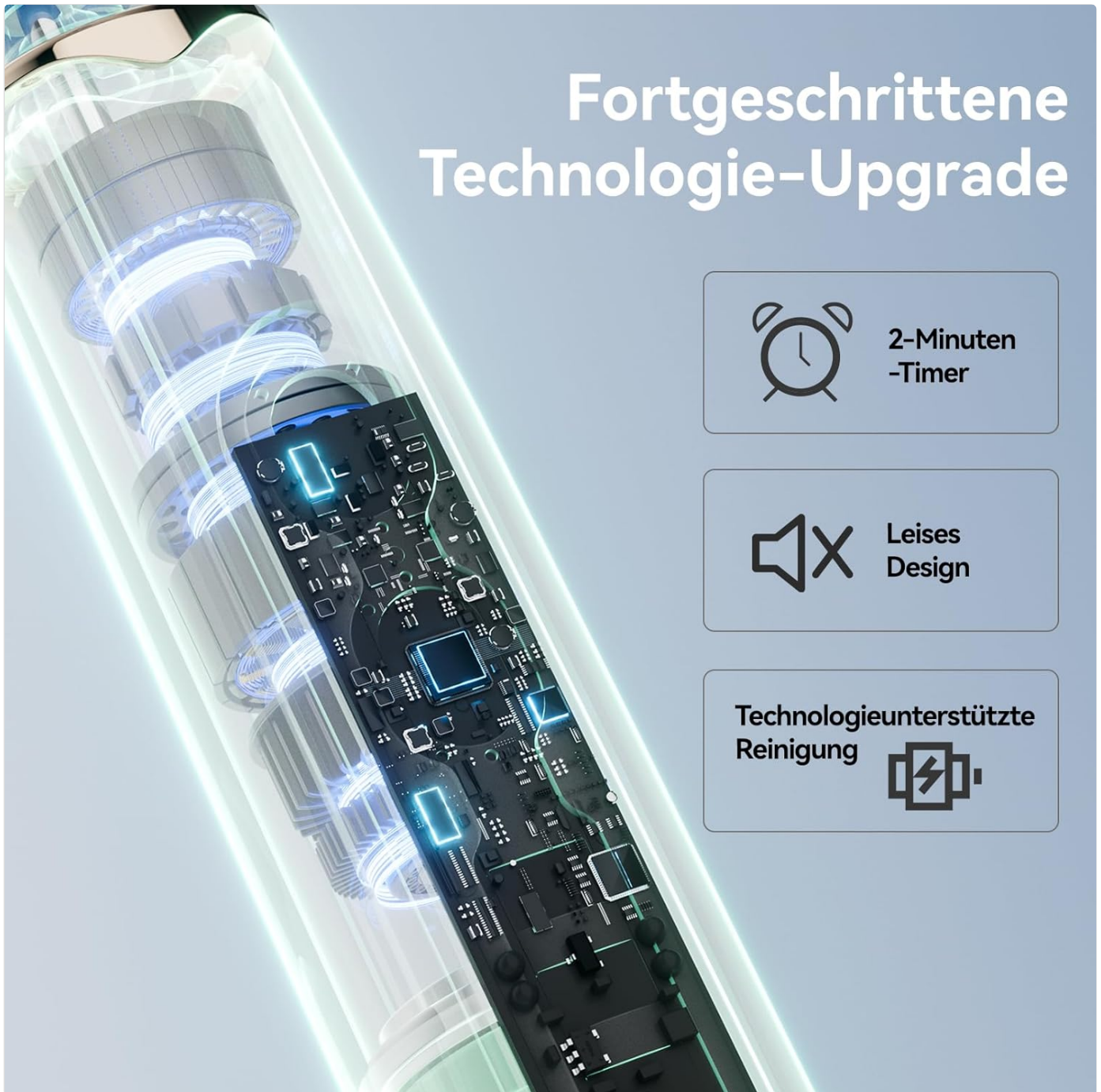
Figure 6: An internal view highlighting the advanced technology, including the 2-minute timer and quiet operational design.