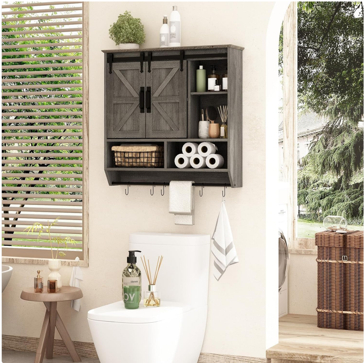
Image 5.1: The cabinet providing storage over a toilet, demonstrating practical placement.