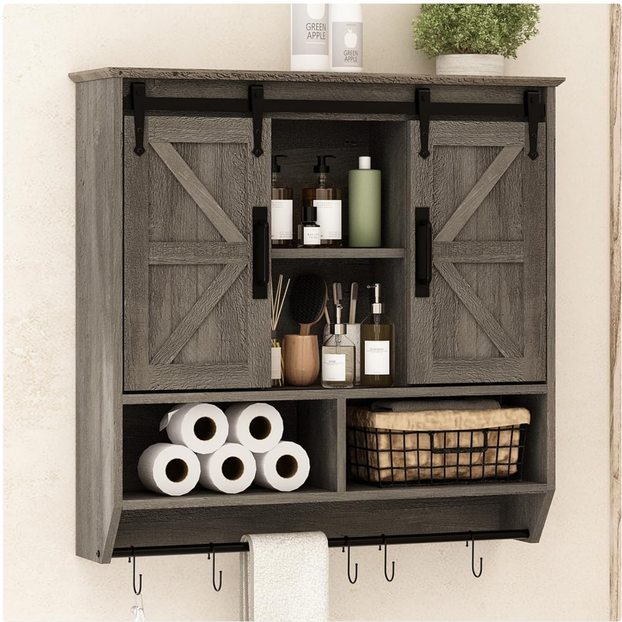
Image 1.1: The RUSTOWN Farmhouse Bathroom Wall Cabinet, showcasing its rustic design and storage capabilities.