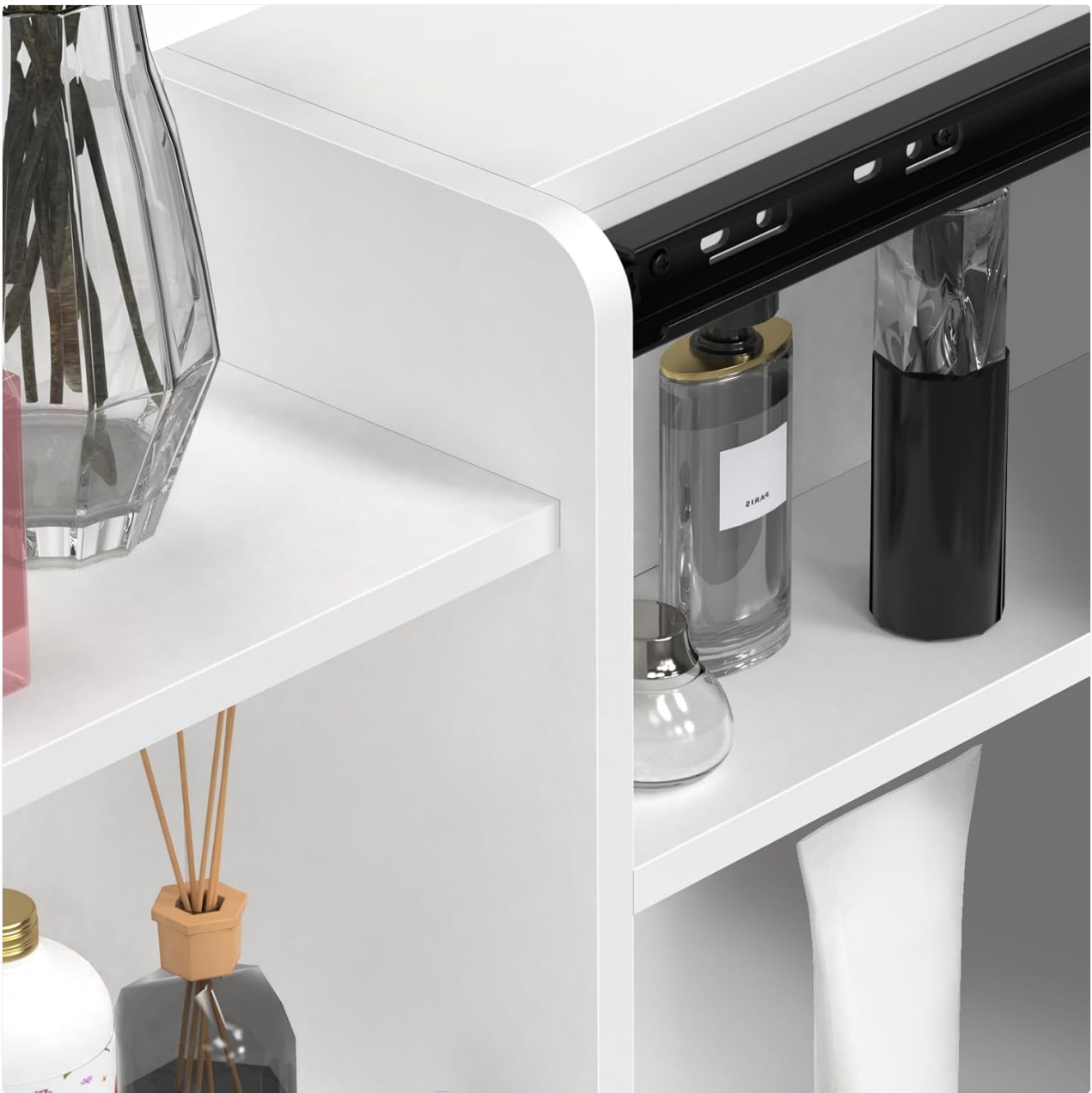
Image 4.2: A detailed view of the sliding mirror's track system and the internal shelves, demonstrating the smooth operation and organized storage capacity.