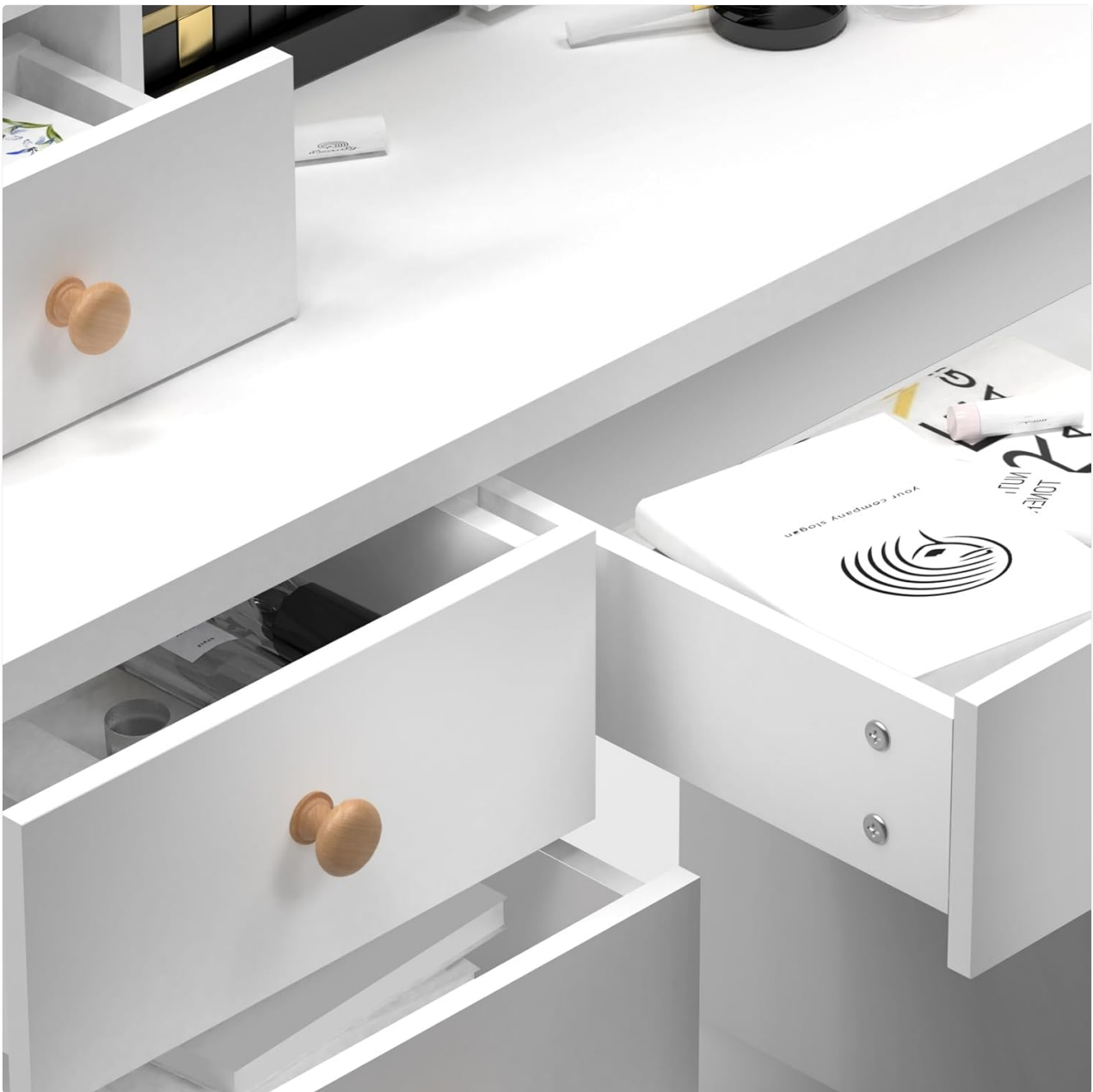
Image 4.3: A close-up of the vanity's drawers, highlighting the wooden handles and the lockable drawer for secure storage of personal items.