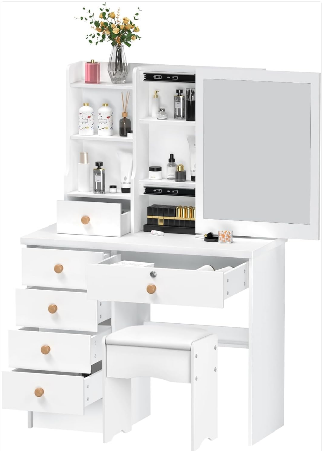
Image 3.1: The Shulemin Makeup Table and Vanity Desk fully assembled, showcasing its complete structure with the mirror unit, multiple drawers, and accompanying stool.