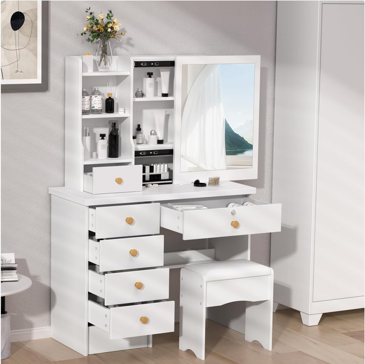
Image 4.1: The vanity desk with its mirror slid to the left, exposing the open shelving unit on the right side, designed for accessible storage of beauty products.