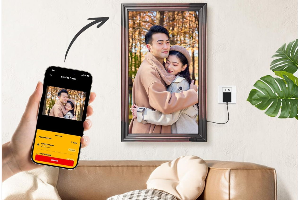
Image: A smartphone displaying the app interface for transferring photos to the frame.

Wi-Fiセンサーが内蔵され、スマホアプリを通して、写真データをデジタルフォトフレームに転送できます。アプリがなくてもメールで簡単転送できます！