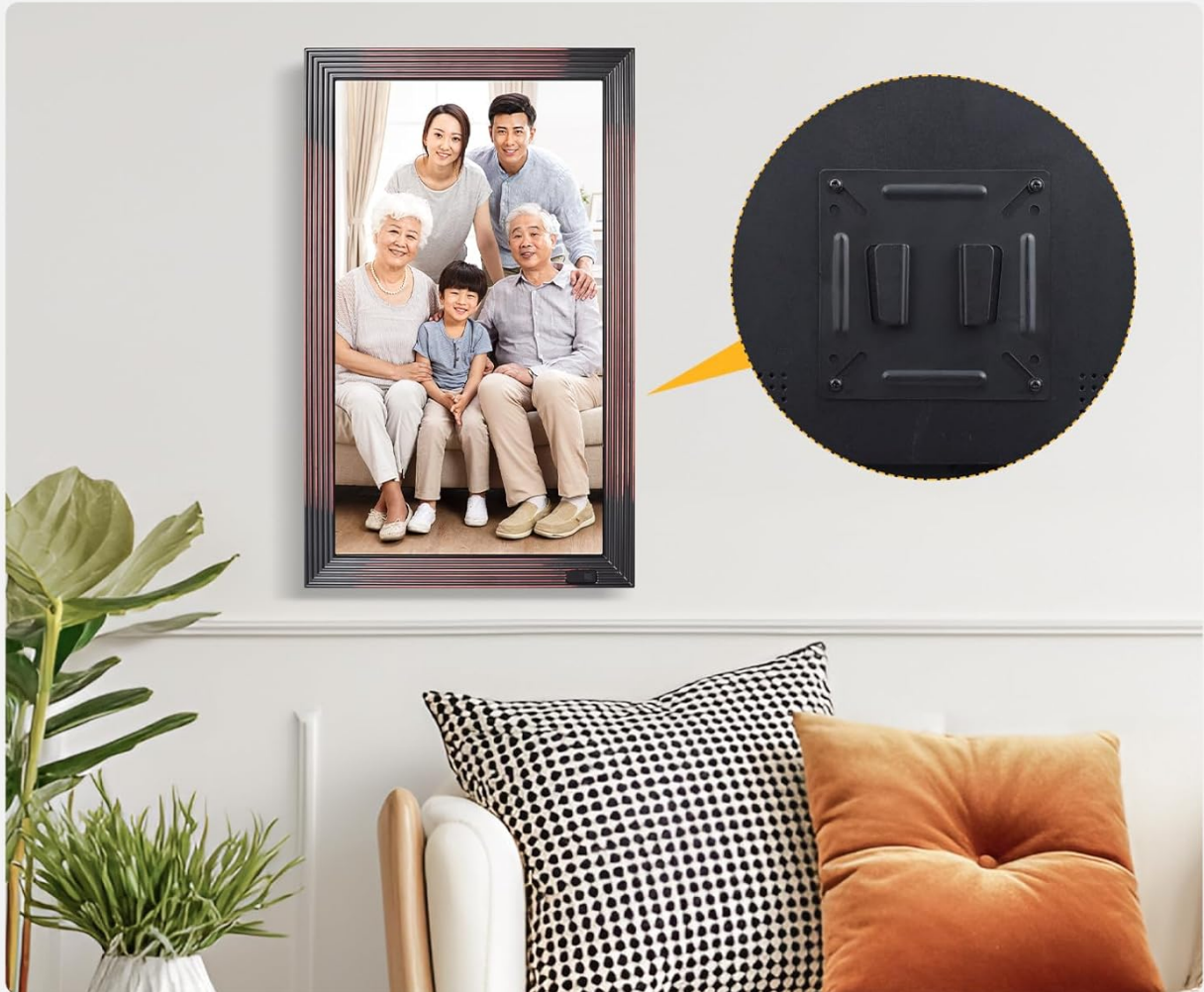
Image: Example of the digital photo frame mounted on a wall, highlighting the mounting bracket.

ご注意：本品は壁へのネジ止め取り付けが必要です。壁に穴を開けたくない場合、別方法での設置をご検討ください