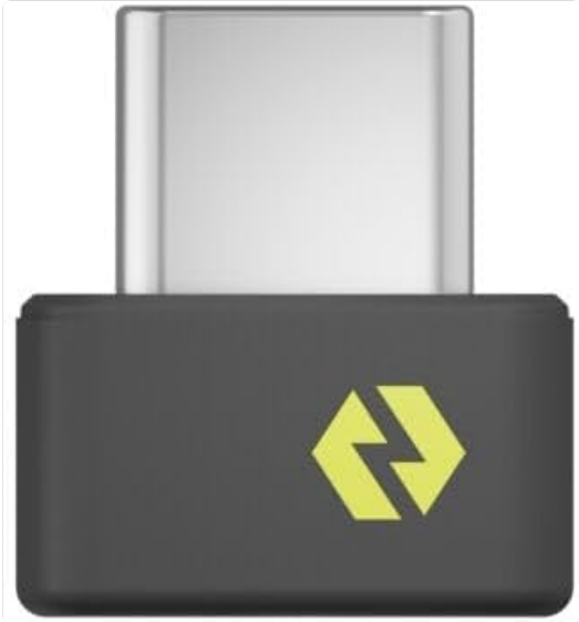
Image: Front view of the compact Logitech Bolt USB-C Receiver, highlighting its design.