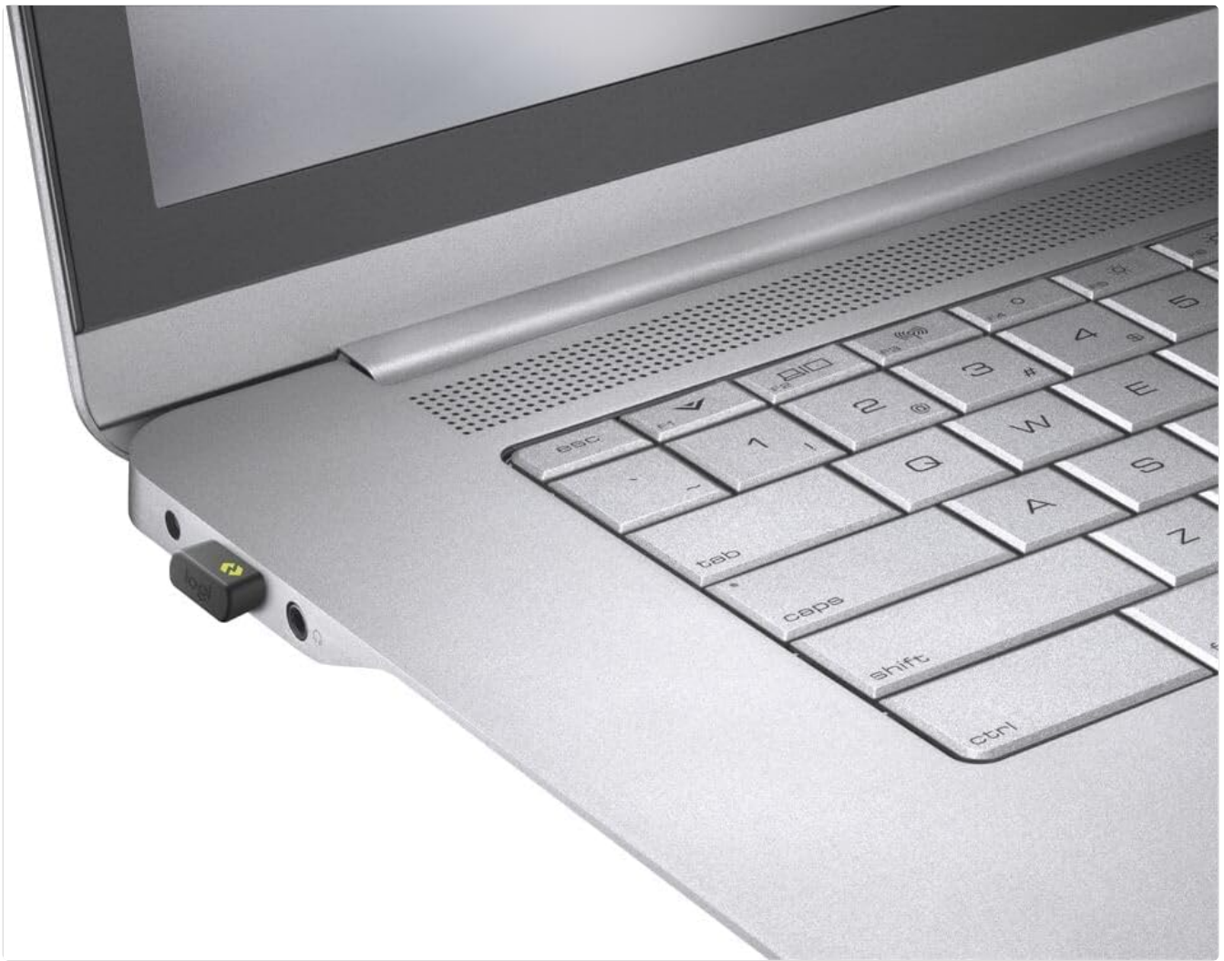
Image: The Logi Bolt USB-C Receiver inserted into a laptop's USB-C port, demonstrating its compact and discrete design.

Video: A comparison between Logitech Bolt and Unifying receivers, explaining their differences and compatibility. This video helps users understand the specific technology of the Bolt receiver.