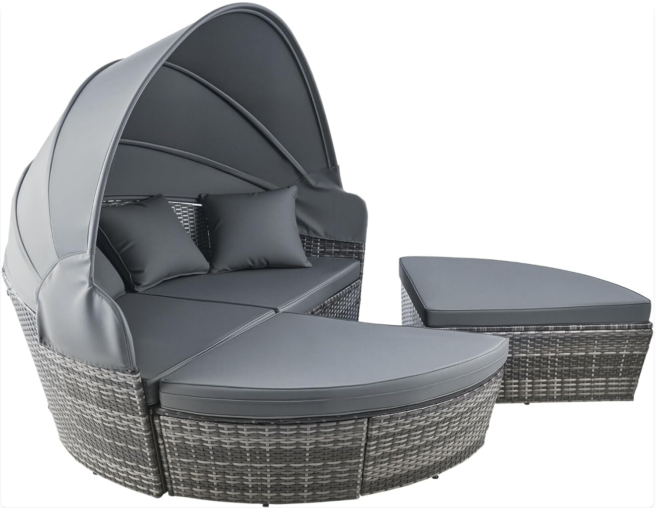
Image 5.1: The daybed separated into a lounge chair and an ottoman.