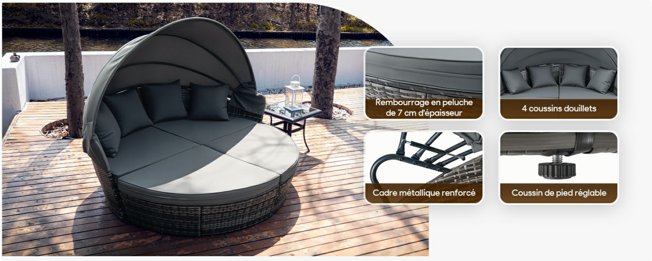
Image 5.2: Illustration of the retractable canopy's functionality.