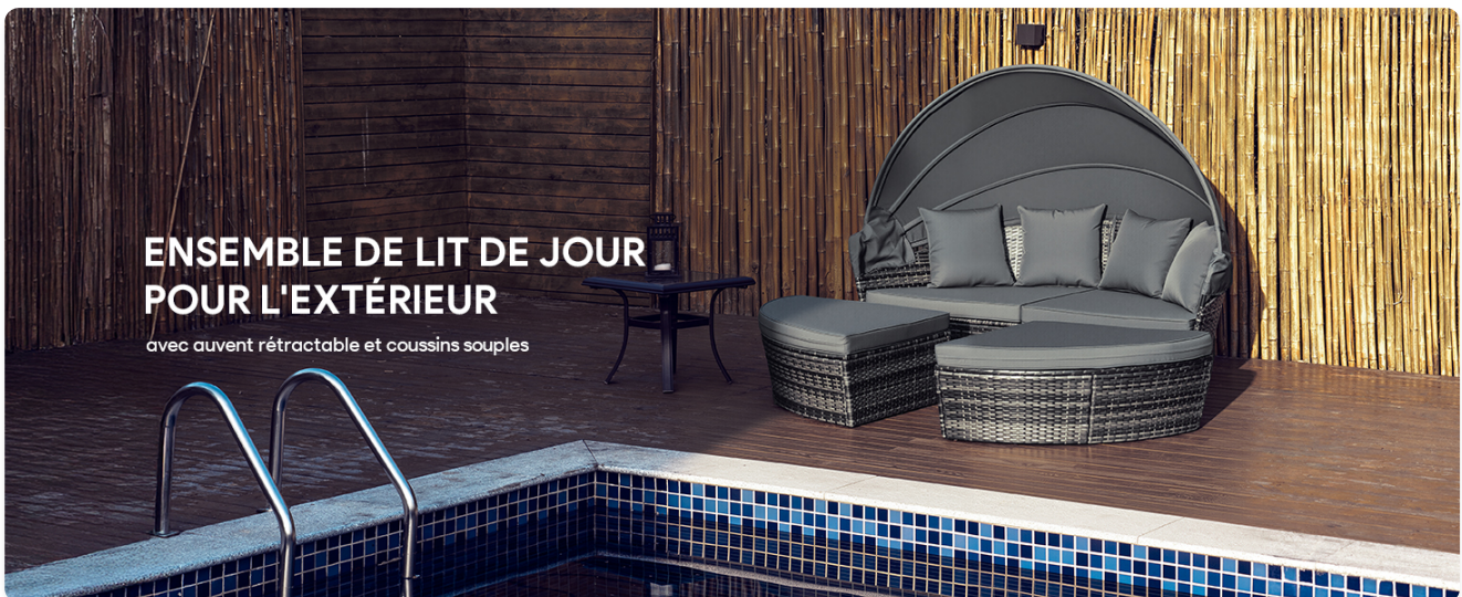
Image 1.1: The CO-Z Round Modular Outdoor Daybed configured for relaxation in an outdoor environment.

Thank you for choosing the CO-Z Round Modular Outdoor Daybed. This 2-in-1 daybed is designed to provide a versatile and comfortable outdoor relaxation experience. It can be used as a spacious daybed or easily reconfigured into a patio set with four cozy chairs. This manual provides essential information for the safe assembly, operation, and maintenance of your new outdoor furniture.