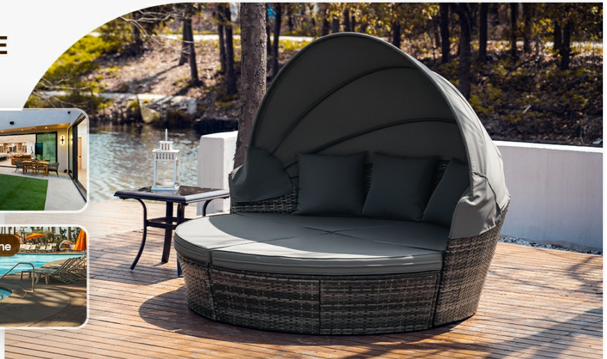
Image 4.1: Key features contributing to the daybed's structure and comfort.