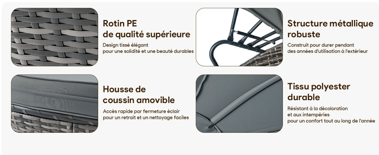
Image 6.1: Details of the comfortable and water-resistant cushions.