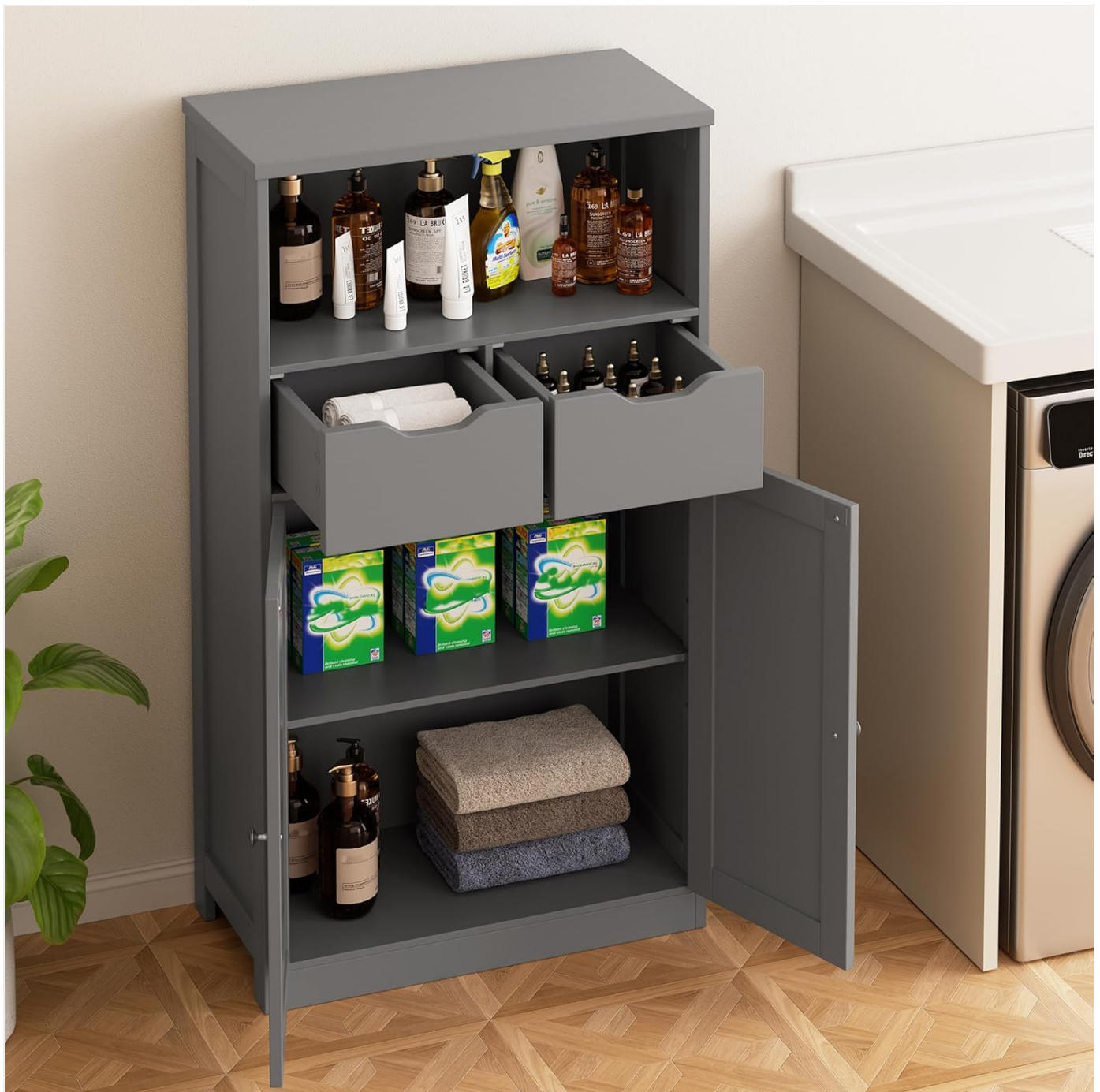
Figure 6: Cabinet in a Laundry Room Setting, demonstrating versatility.