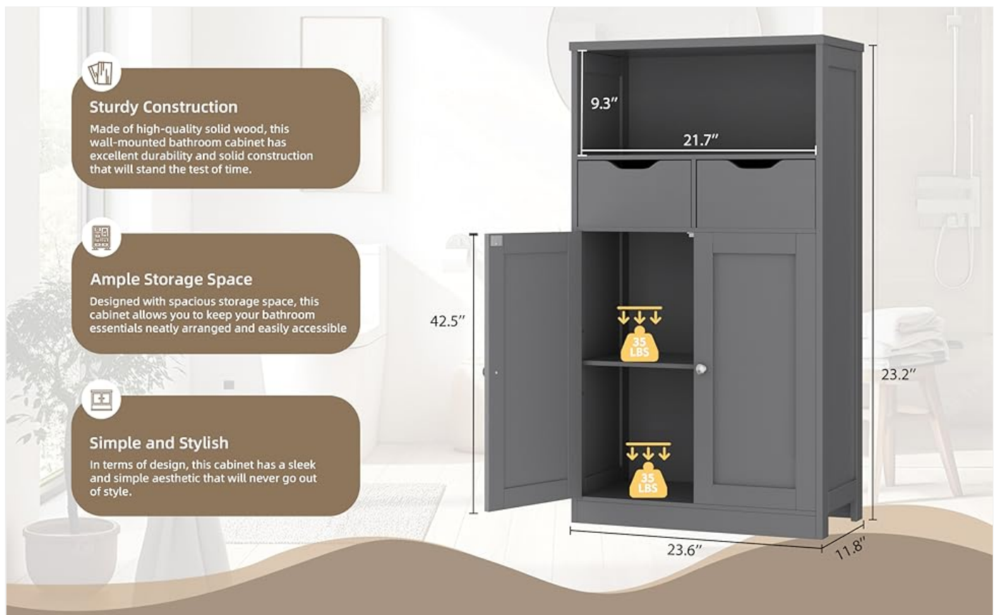
Figure 7: Key Features and Dimensions Overview.