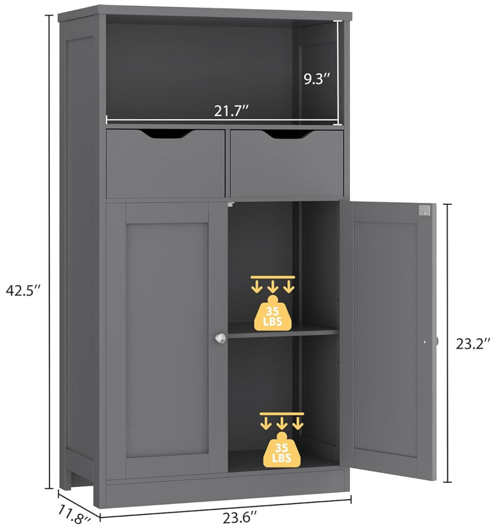
Figure 3: Product Dimensions and Shelf Weight Capacity.