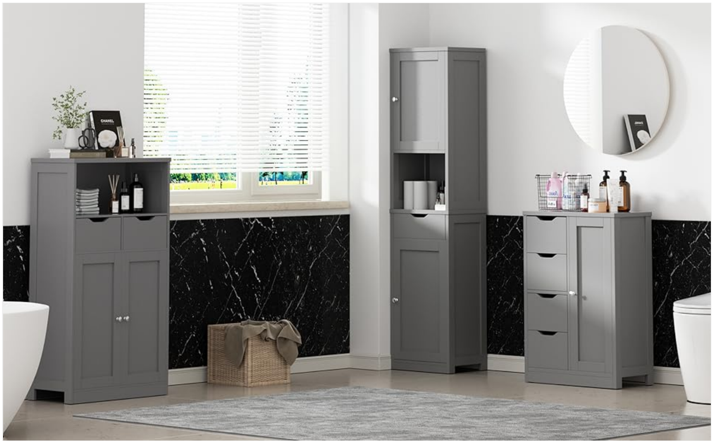
Figure 2: Walsunny Storage Cabinets in various room settings.