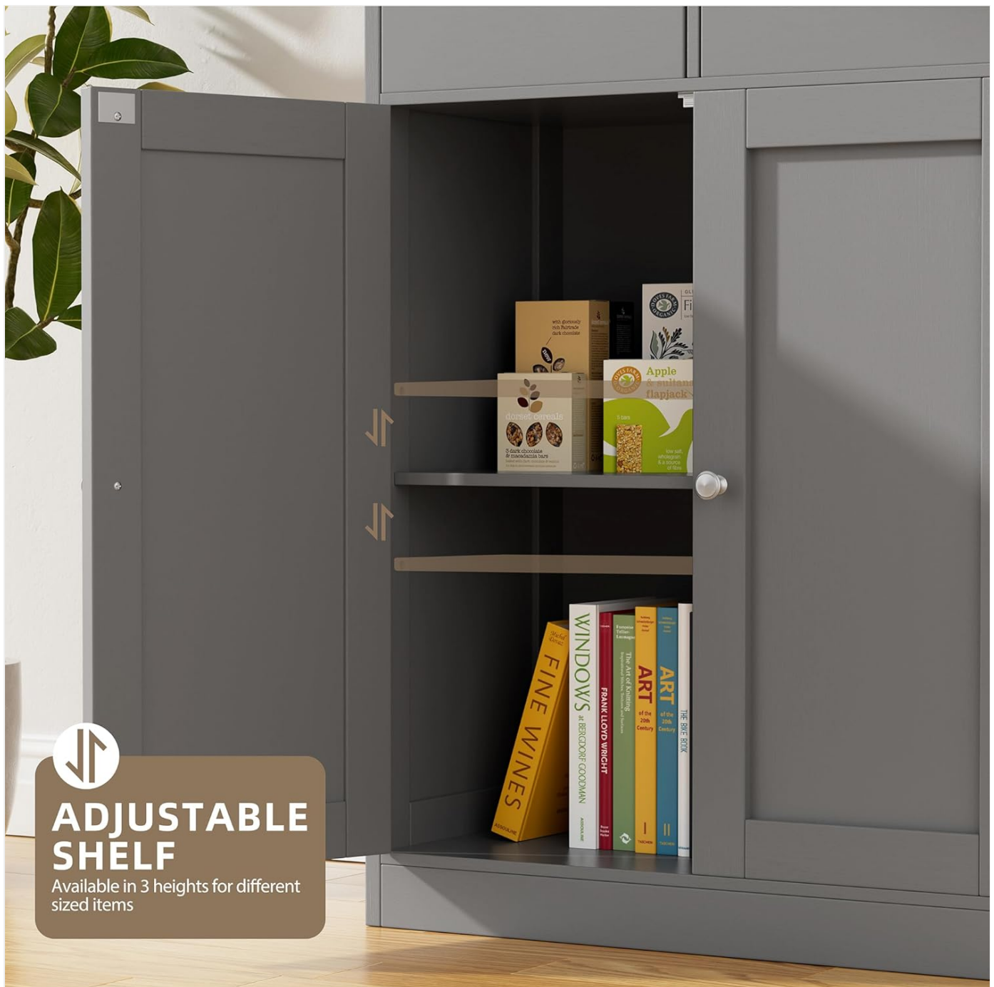
Figure 4: Adjustable Shelf Feature.