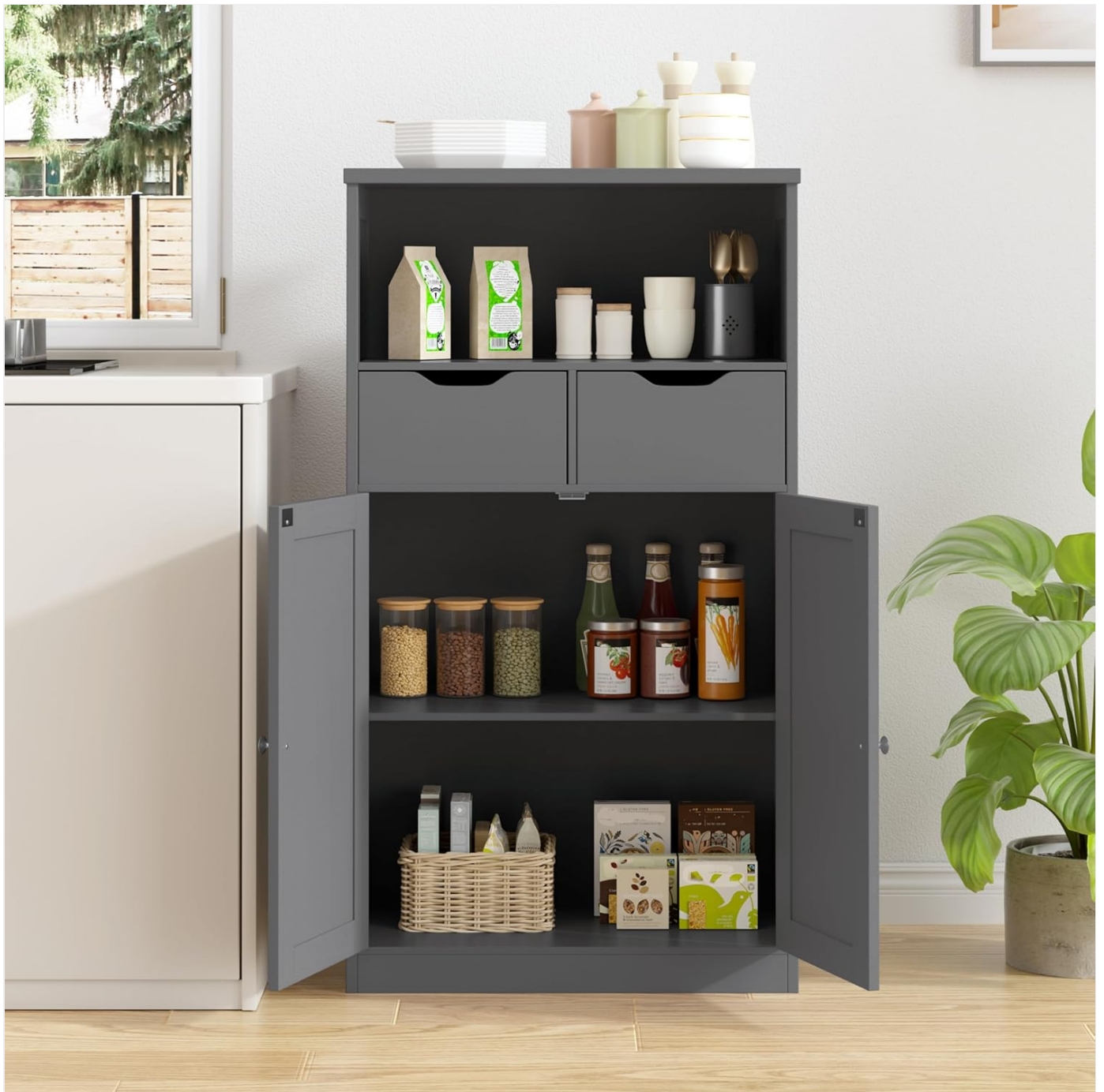
Figure 1: Assembled Walsunny Floor Storage Cabinet in Grey.