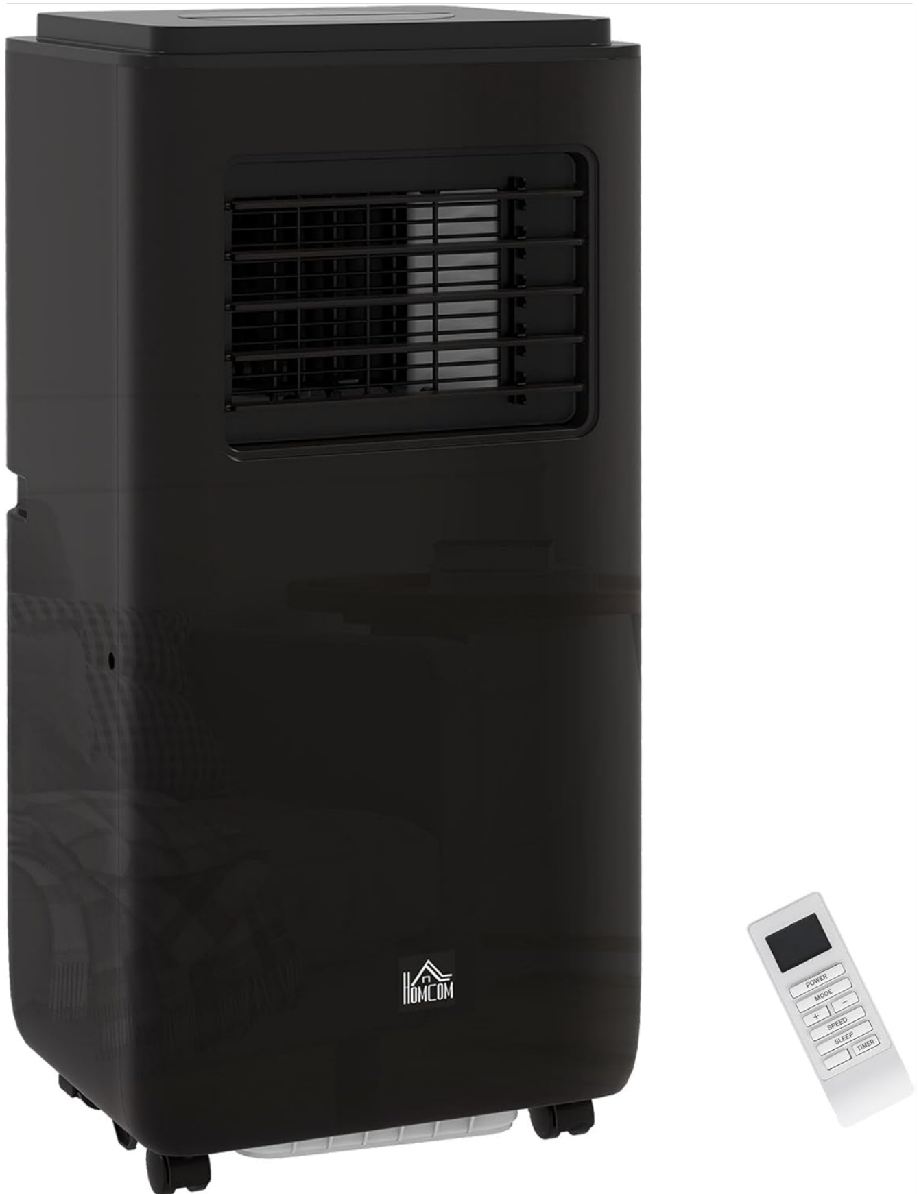
Image 1.1: Front view of the HOMCOM Portable Air Conditioner with its remote control.