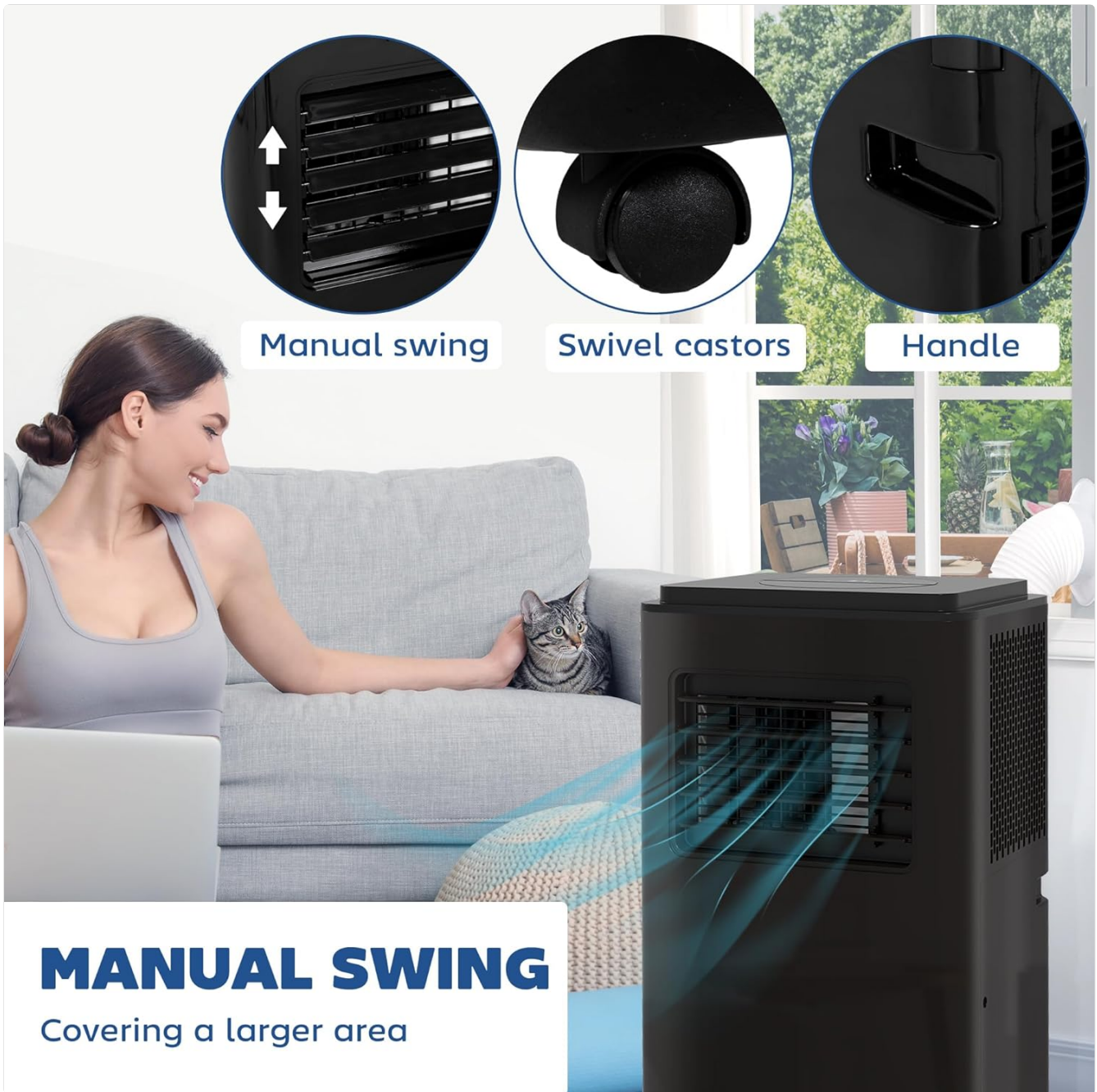
Image 4.2: Details highlighting the manual swing function for wider air distribution, swivel castors for mobility, and the integrated handle for easy transport.