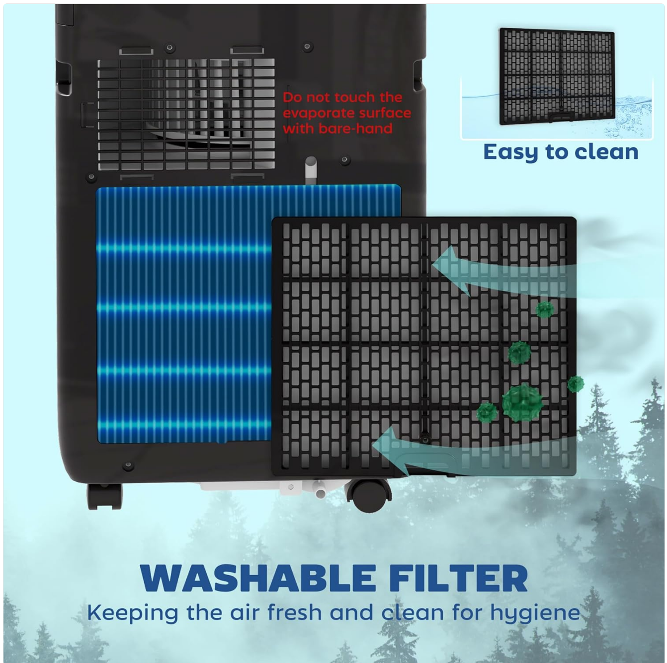
Image 7.1: Step-by-step visual guide on removing and cleaning the washable air filter for hygiene and efficient operation.