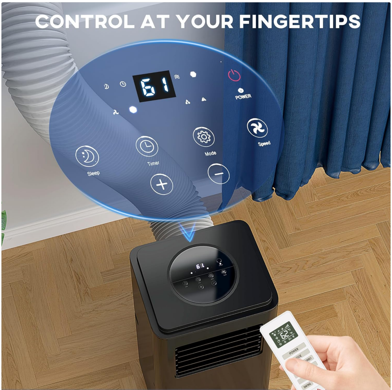
Image 6.1: The unit's top control panel and the remote control, illustrating the various buttons for operation.