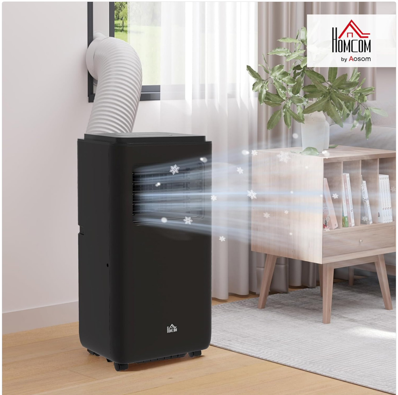
Image 5.1: The portable air conditioner positioned in a room, demonstrating the exhaust hose connection to a window.