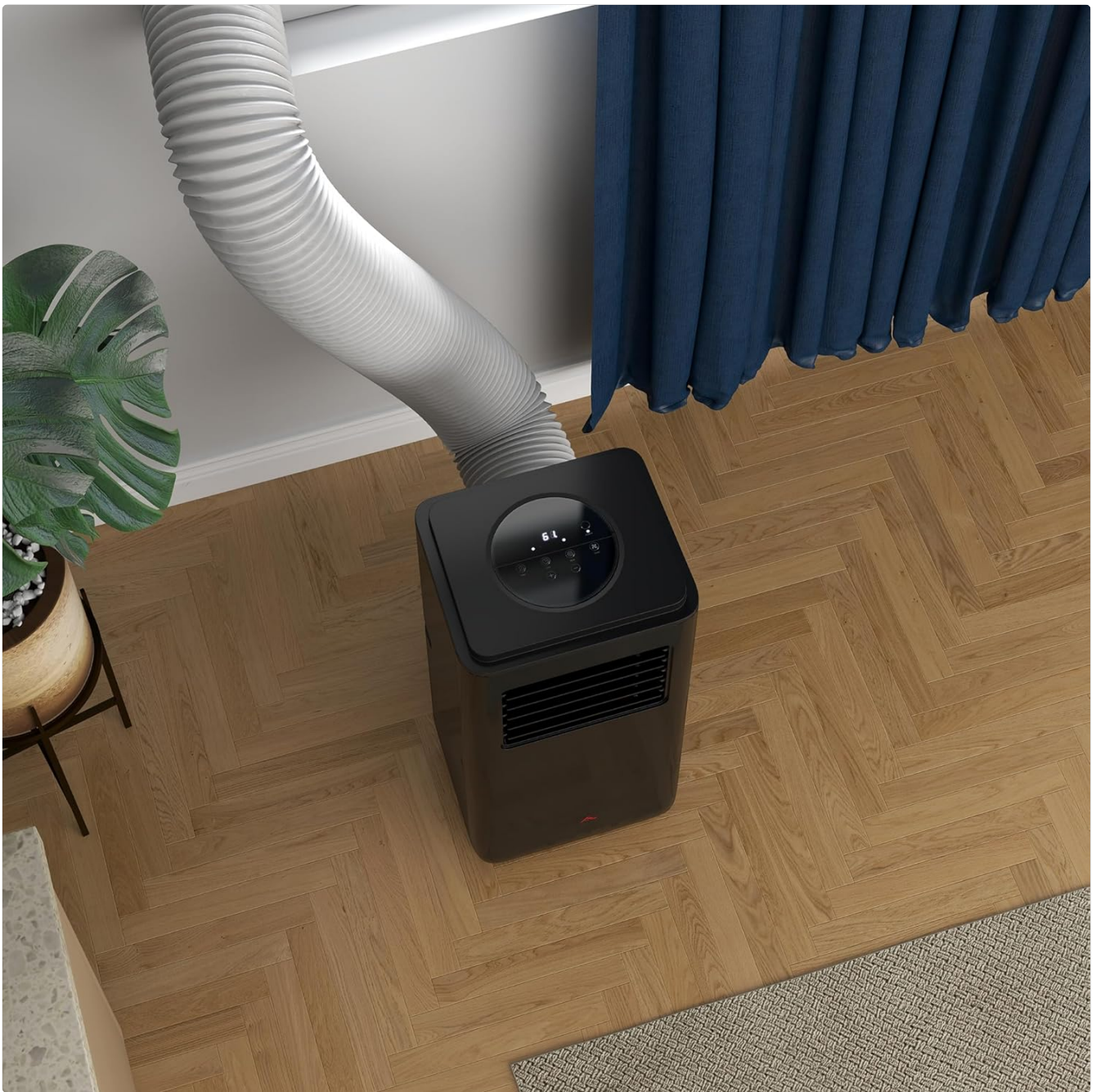
Image 5.3: Overhead view of the air conditioner, showing the exhaust hose properly connected and routed towards the window.