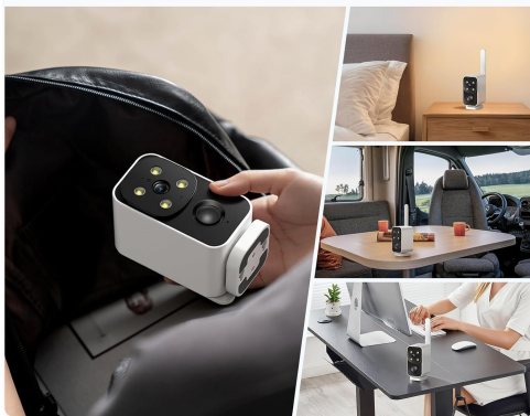
Image: The compact, palm-sized SEHMUA ZY-G3 camera being used in various indoor and outdoor portable scenarios.