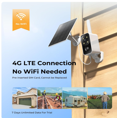
Image: SEHMUA ZY-G3 Cellular Security Camera with included solar panel, illustrating the 4G LTE connection and no Wi-Fi requirement.