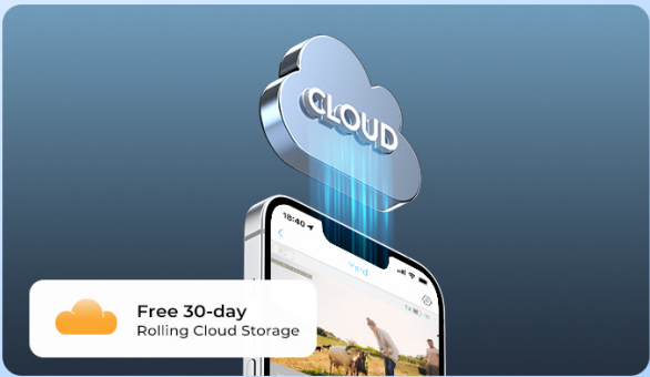
Image: Visual representation of local storage via an SD card (up to 128GB) and cloud storage options for the SEHMUA ZY-G3 camera.