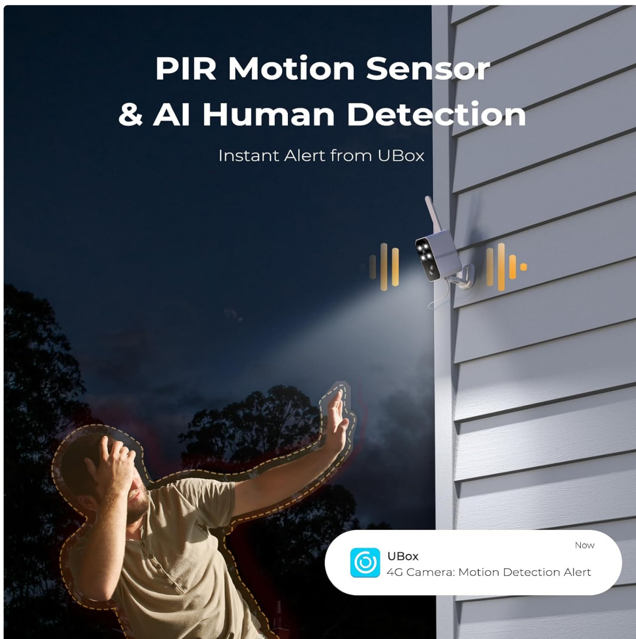
Image: Illustration of PIR Motion Detection triggering an instant alert notification on a smartphone from the UBox app.