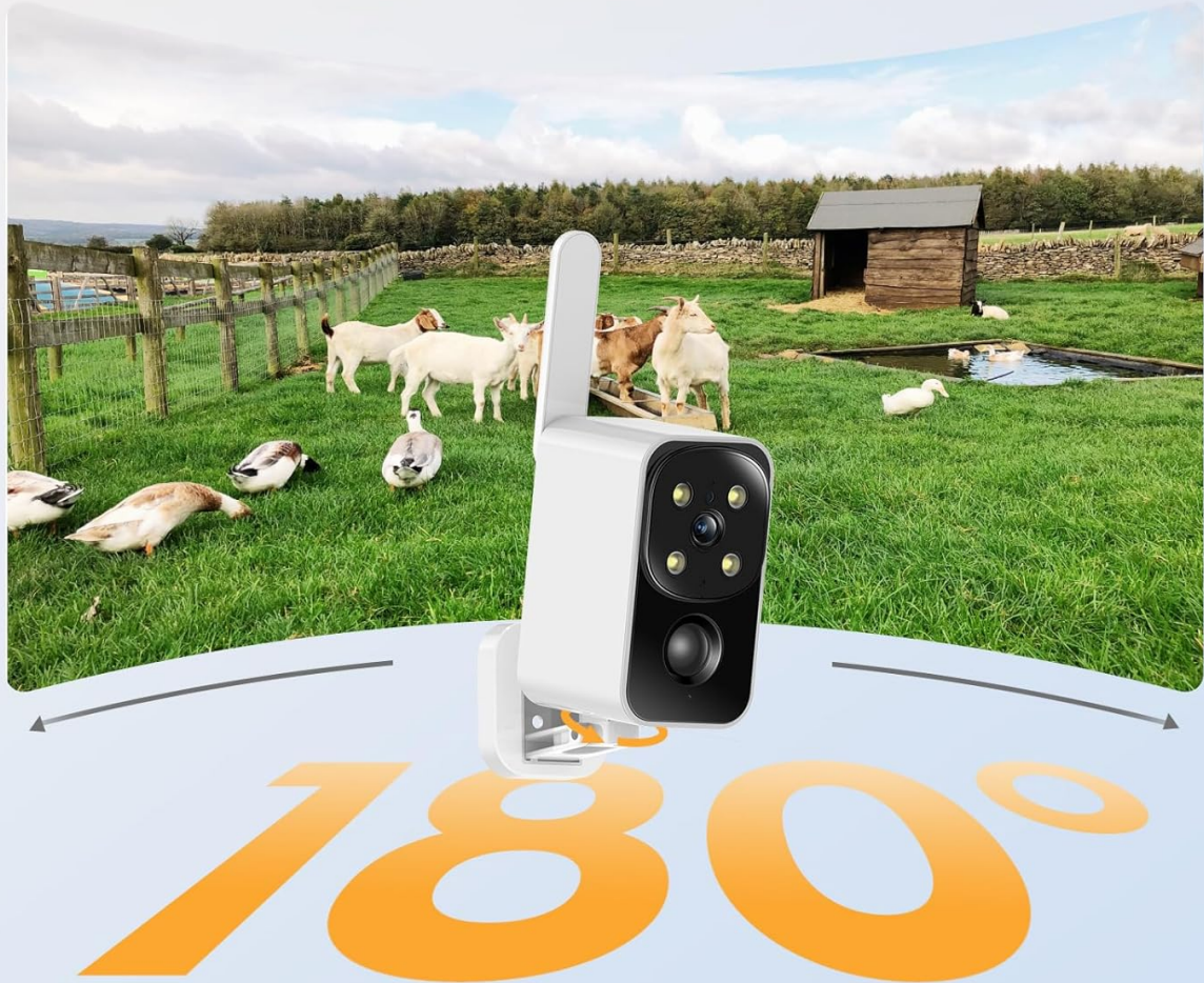
Image: The SEHMUA ZY-G3 camera demonstrating its 180° horizontal auto-rotation for wide area coverage.