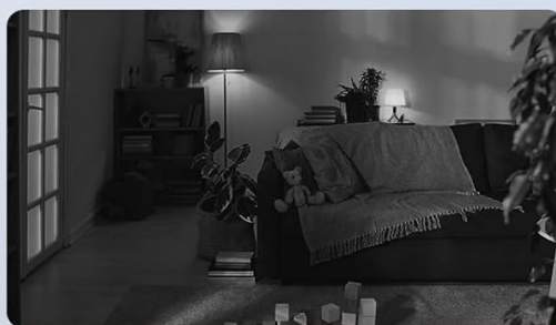
Infrared Night Vision

Image: Comparison of 2K Color Night Vision (with spotlight) and Infrared Night Vision (without spotlight) captured by the SEHMUA ZY-G3 camera.