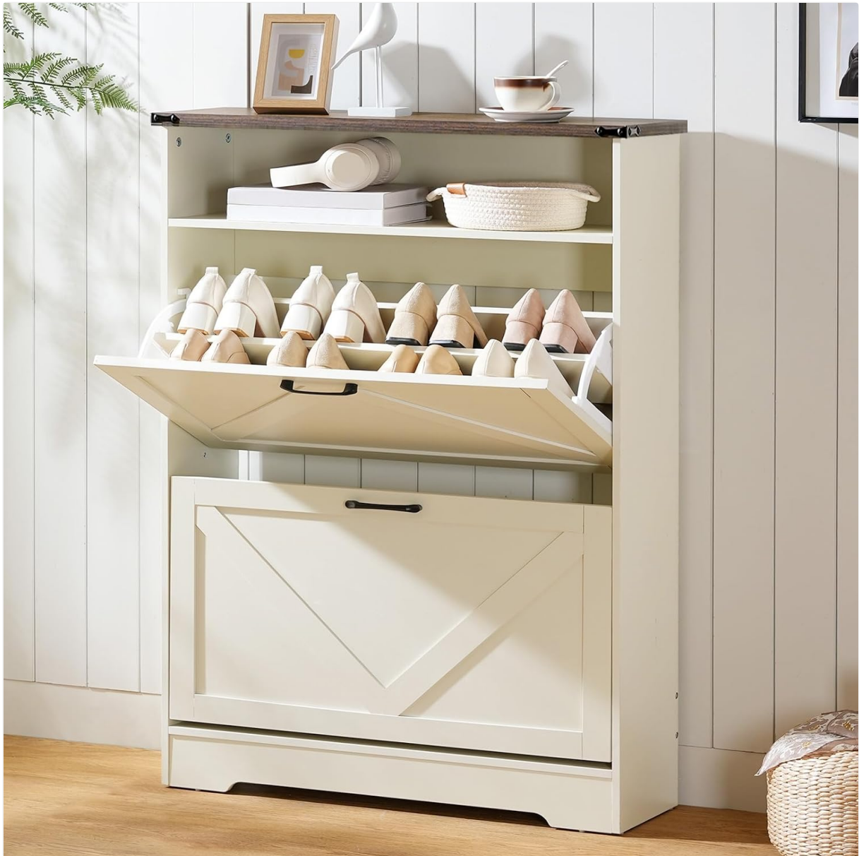
Image 4.1: The shoe cabinet with one flip drawer open, demonstrating how shoes are stored.