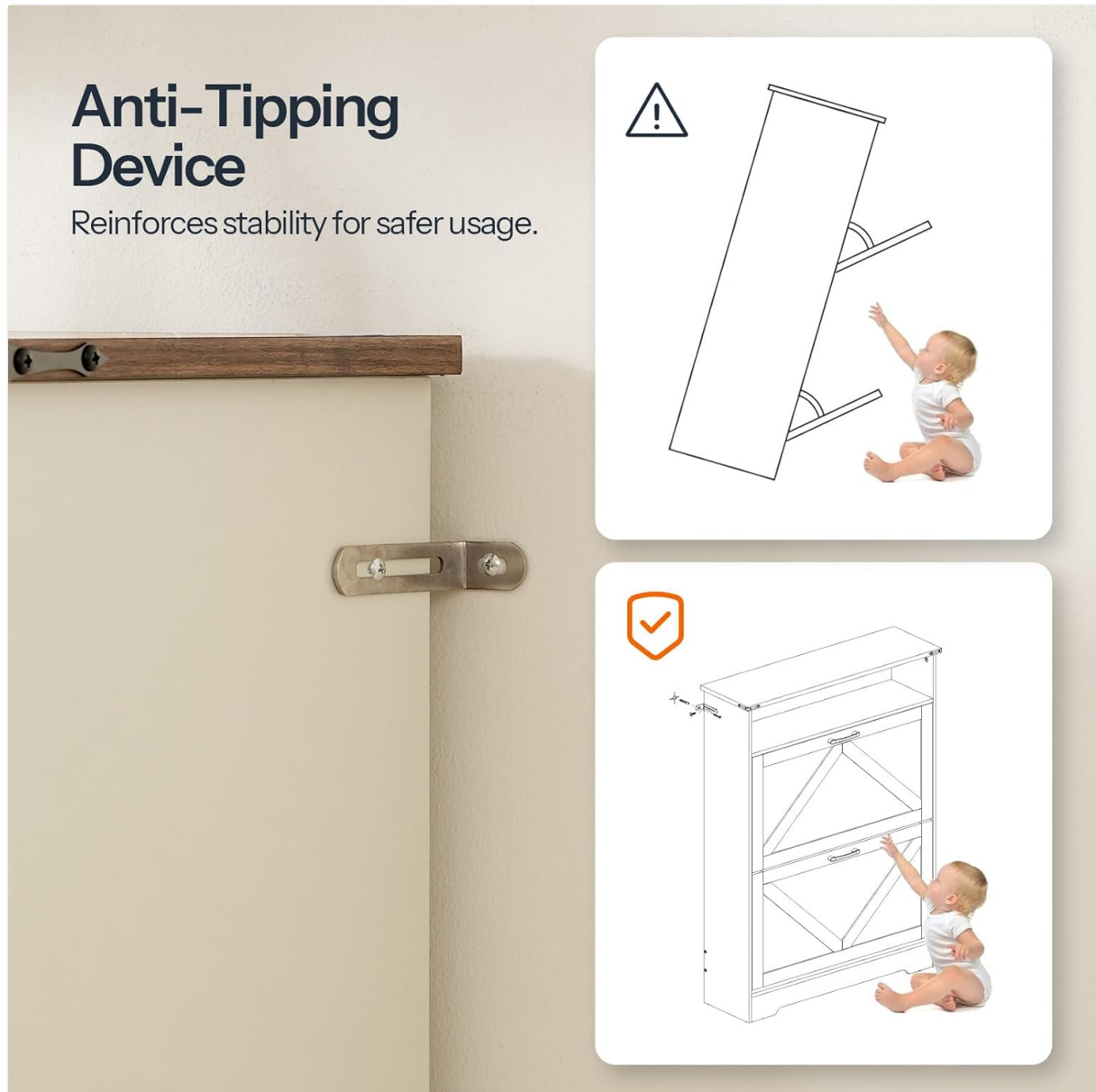
Image 2.1: Illustration of the anti-tipping device and its importance for stability and safety.