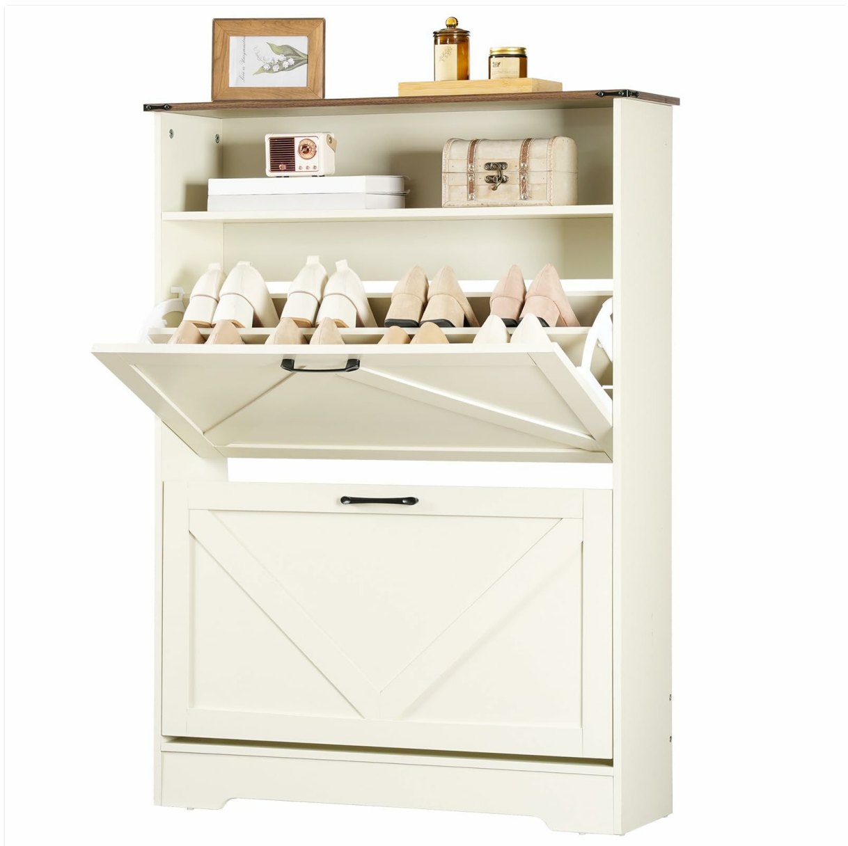
Image 1.1: The HOOBRO Farmhouse Shoe Storage Cabinet in a home entryway, showcasing its design and functionality.