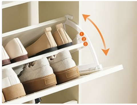
Image 4.2: A detailed view of the adjustable shelves within a flip drawer, illustrating the three possible height settings.