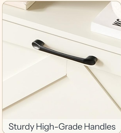
Image 3.1: Detail view of the cabinet's top, open compartment, and drawer handles, highlighting the quality of components.