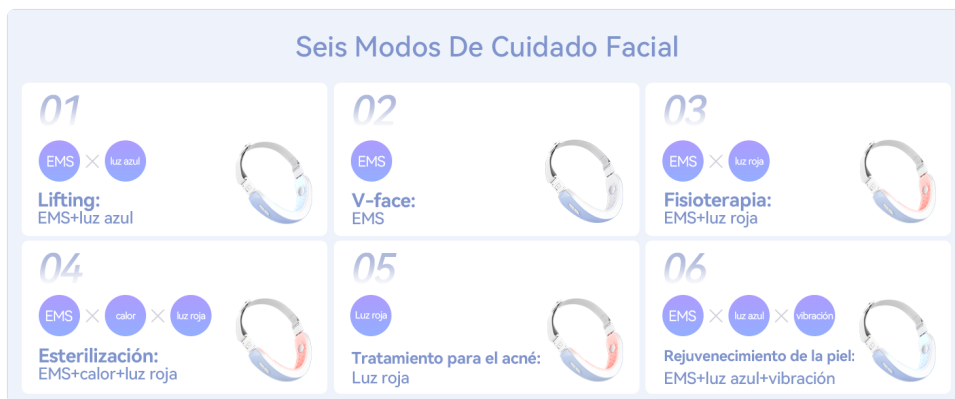
Figure 9: Overview of the six distinct facial care modes available on the device.

The device offers six distinct facial care modes, each combining different technologies for specific benefits: