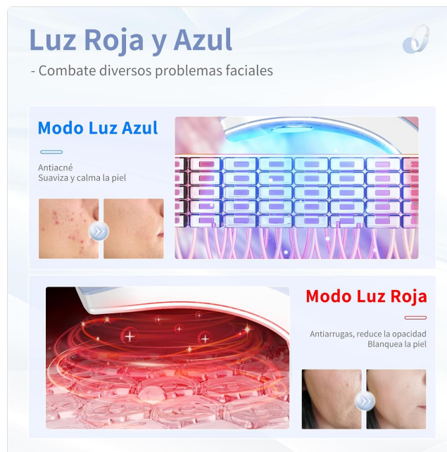
Figure 3: Illustration of Red and Blue Light Therapy targeting different skin concerns.