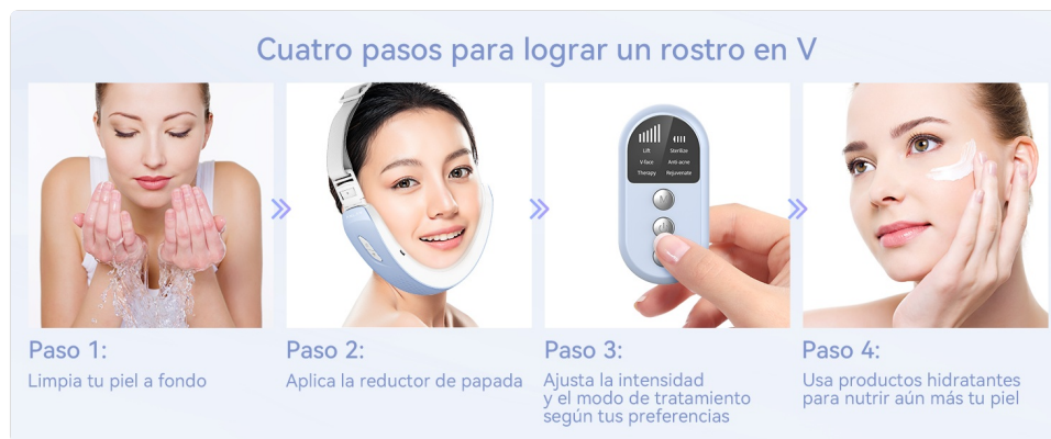
Figure 10: The four essential steps for achieving a V-shaped face with the device.