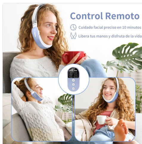
Figure 2: The remote control allows for easy adjustment of modes and intensity during use.