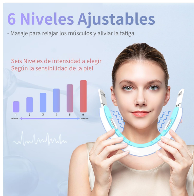
Figure 6: The device offers multiple vibration intensity levels to customize your massage experience.

The facial lifting instrument provides 9 adjustable vibration levels. Levels 1-3 are suitable for sensitive skin, 4-5 for prominent masticatory muscles and double chin (recommended 3-5 weeks), and 6-8 for wide jaws and tense muscles (recommended 3 months). Vibration helps relax muscles and alleviate fatigue.