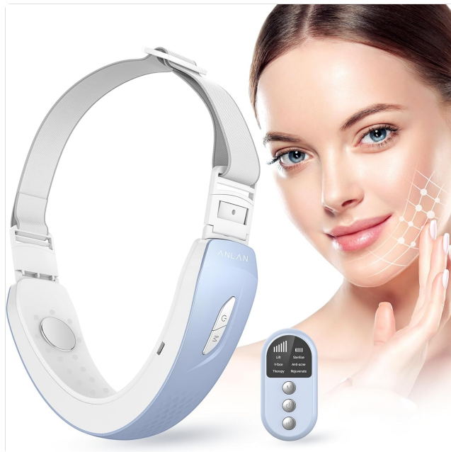
Figure 1: The ANLAN V-Face Lifting Facial Massager device and its accompanying remote control.