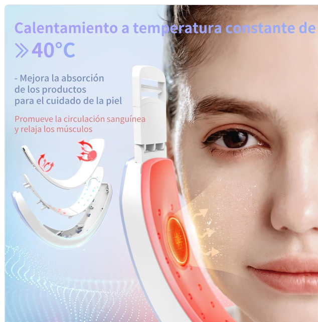
Figure 7: The constant temperature heating function enhances product absorption and promotes circulation.