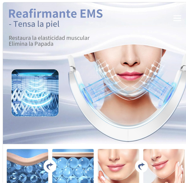
Figure 5: EMS microcurrent technology works to tighten and firm the skin, restoring muscle elasticity.