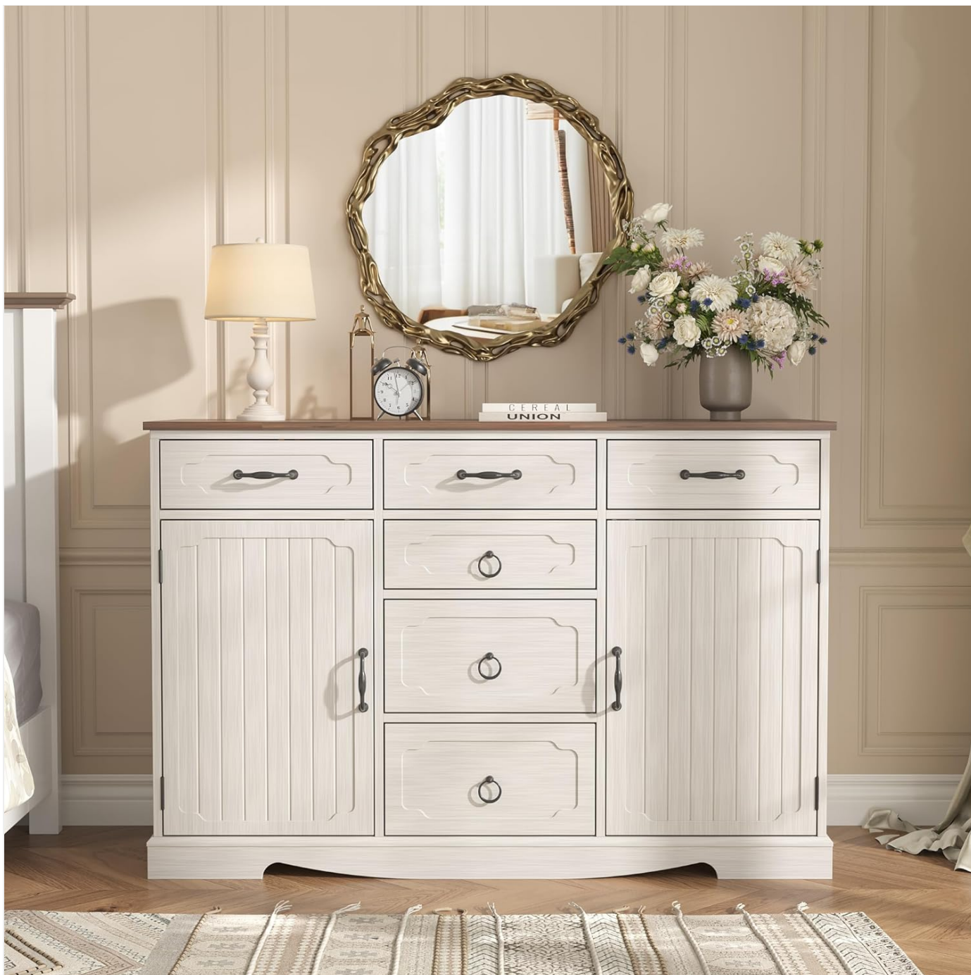
Figure 1.1: Maupvit Buffet Cabinet (White) in a typical room setup.