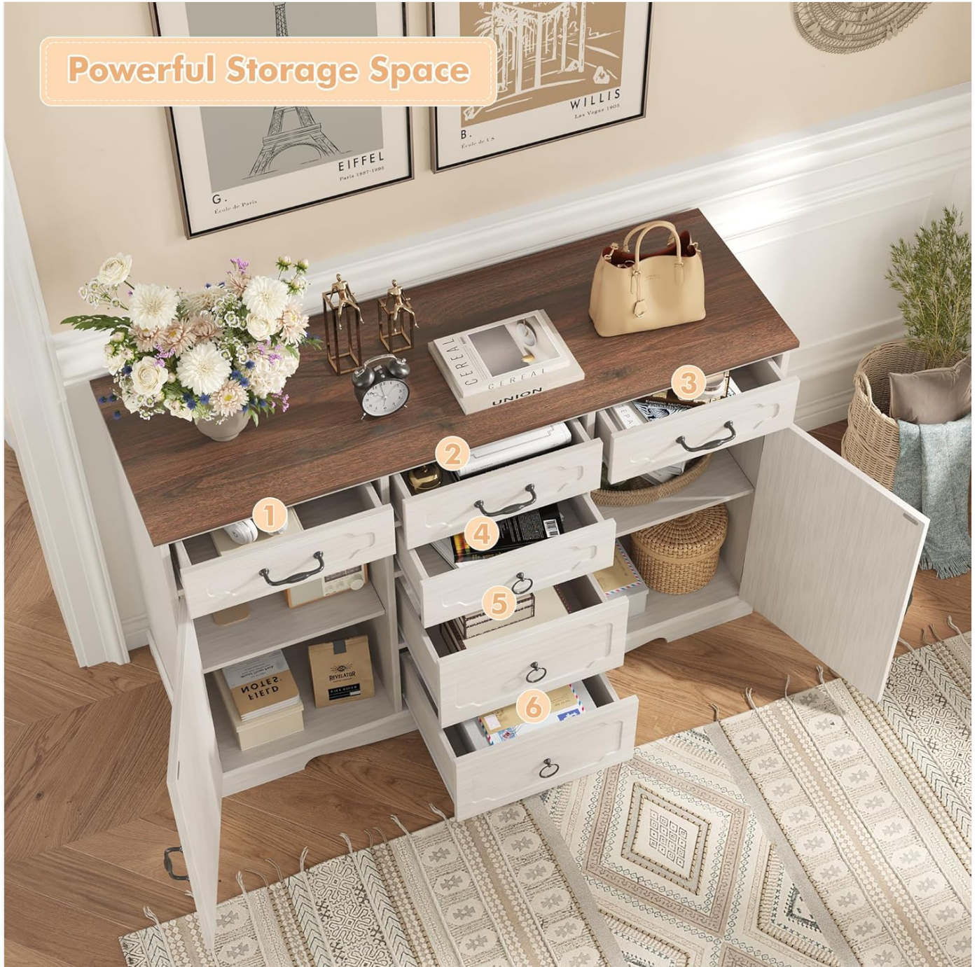
Figure 3.1: Overview of the cabinet's storage compartments, indicating areas for organization.