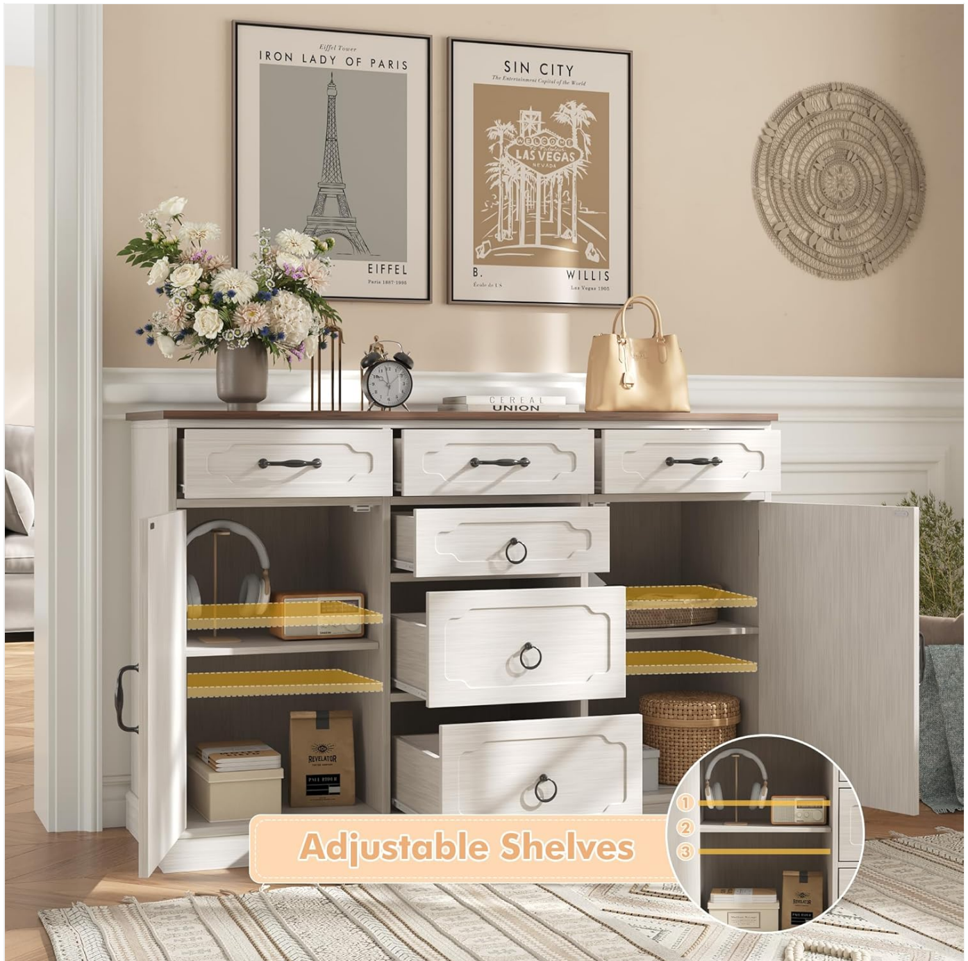
Figure 4.1: Adjustable shelves feature, allowing customization of storage space.