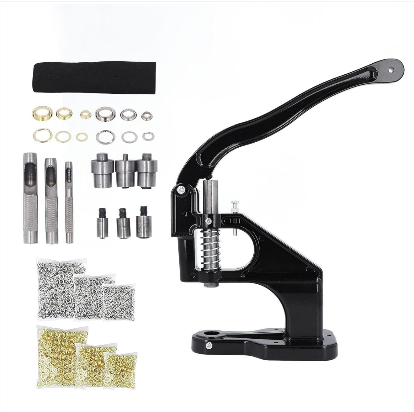
Figure 2.1: Overview of the Walfront Hand Press Grommet Machine and its complete set of accessories, including various dies and grommets.