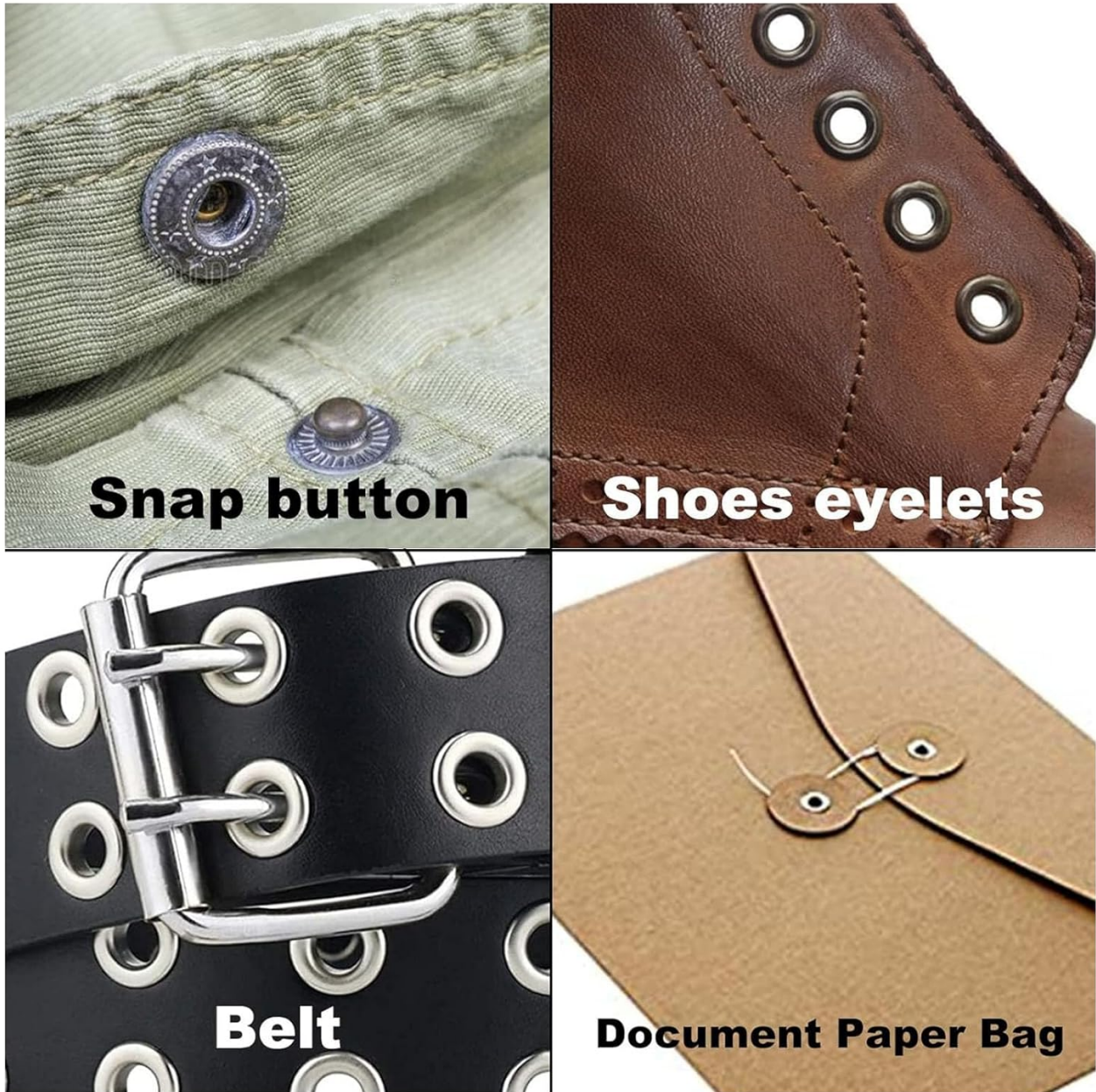
Figure 5.3: Examples of common applications for the grommet machine, showcasing finished items like snap buttons, shoe eyelets, belts, and document paper bags.