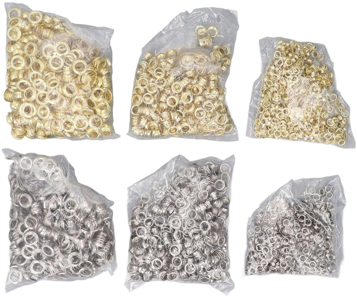
Figure 2.2: Assortment of gold and silver grommets provided with the kit, available in 6mm, 10mm, and 12mm sizes.