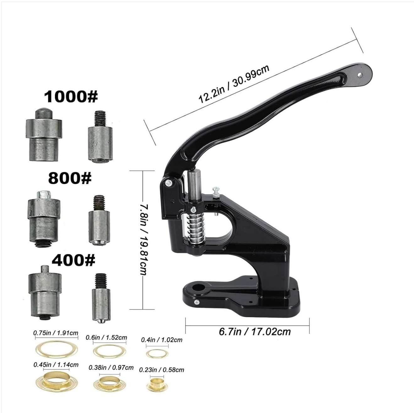
Figure 3.1: Detailed dimensions of the grommet machine and the corresponding sizes for the 400#, 800#, and 1000# dies.