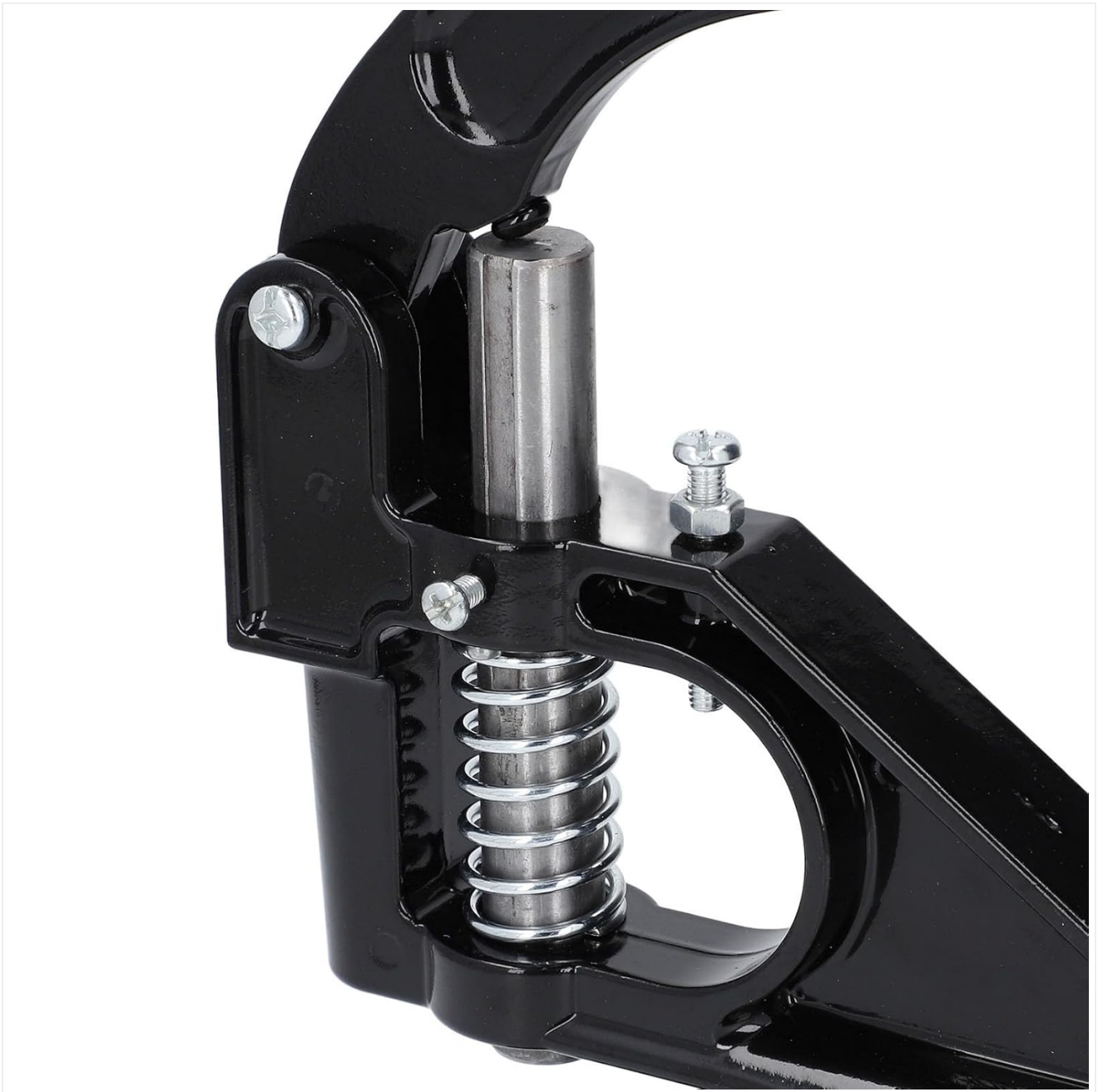
Figure 4.1: Close-up of the machine's mechanism, showing where the dies are installed and the spring for smooth operation.