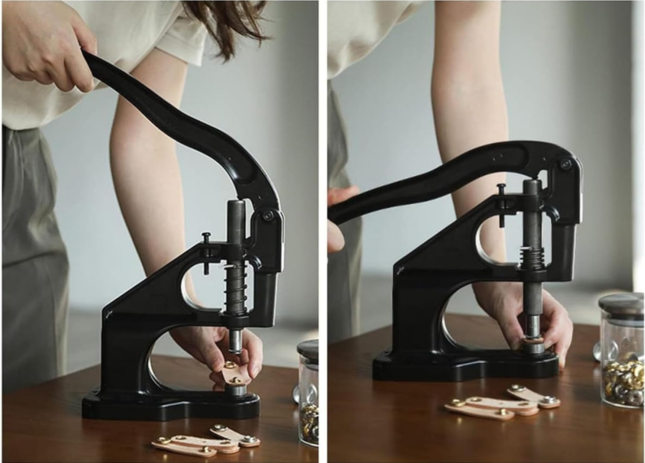
Figure 5.2: The machine is suitable for various materials such as fabrics, banners, signs, curtains, posters, drapes, leather kits, digital printing, scrapbooking, pullovers, belts, and bag making.

Suitable for fabrics, banners, signs, curtains, posters, drapes, leather kits, digital printing, scrapbooking, pullovers, belts, bag making, footwear and more.