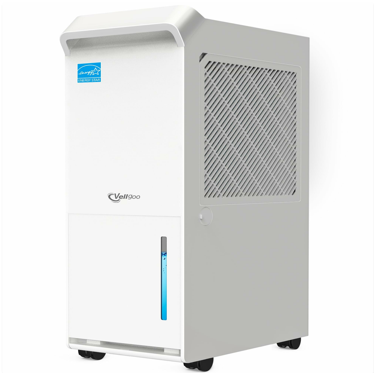
Image: Front view of the Vellgoo Max 60 Pint/D Dehumidifier, showcasing its compact design and Energy Star label.