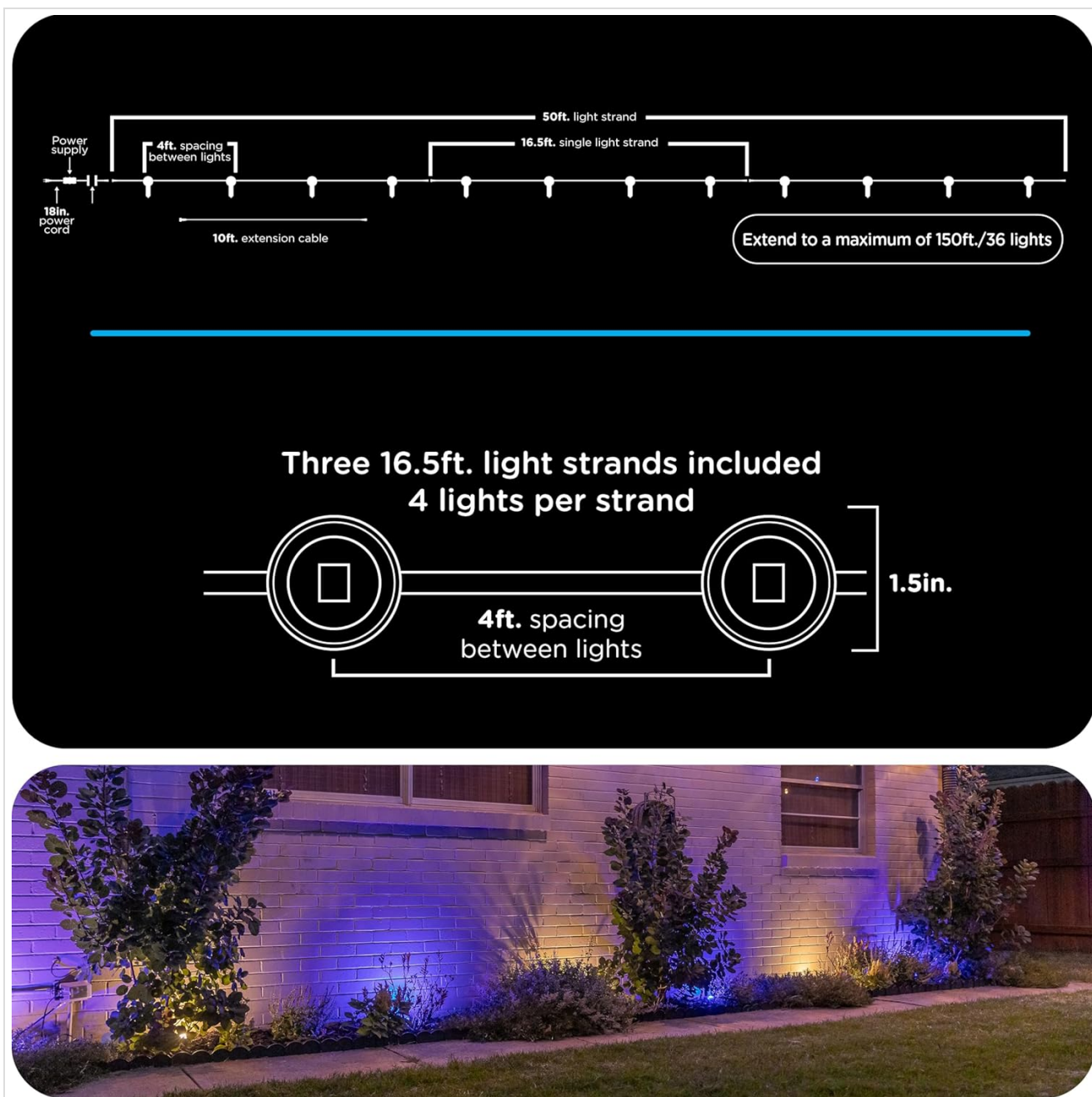
Image: A diagram showing how the 16.5ft light strands connect, including the 10ft extension cable, to achieve a total length of 50ft, and how to extend up to 150ft.