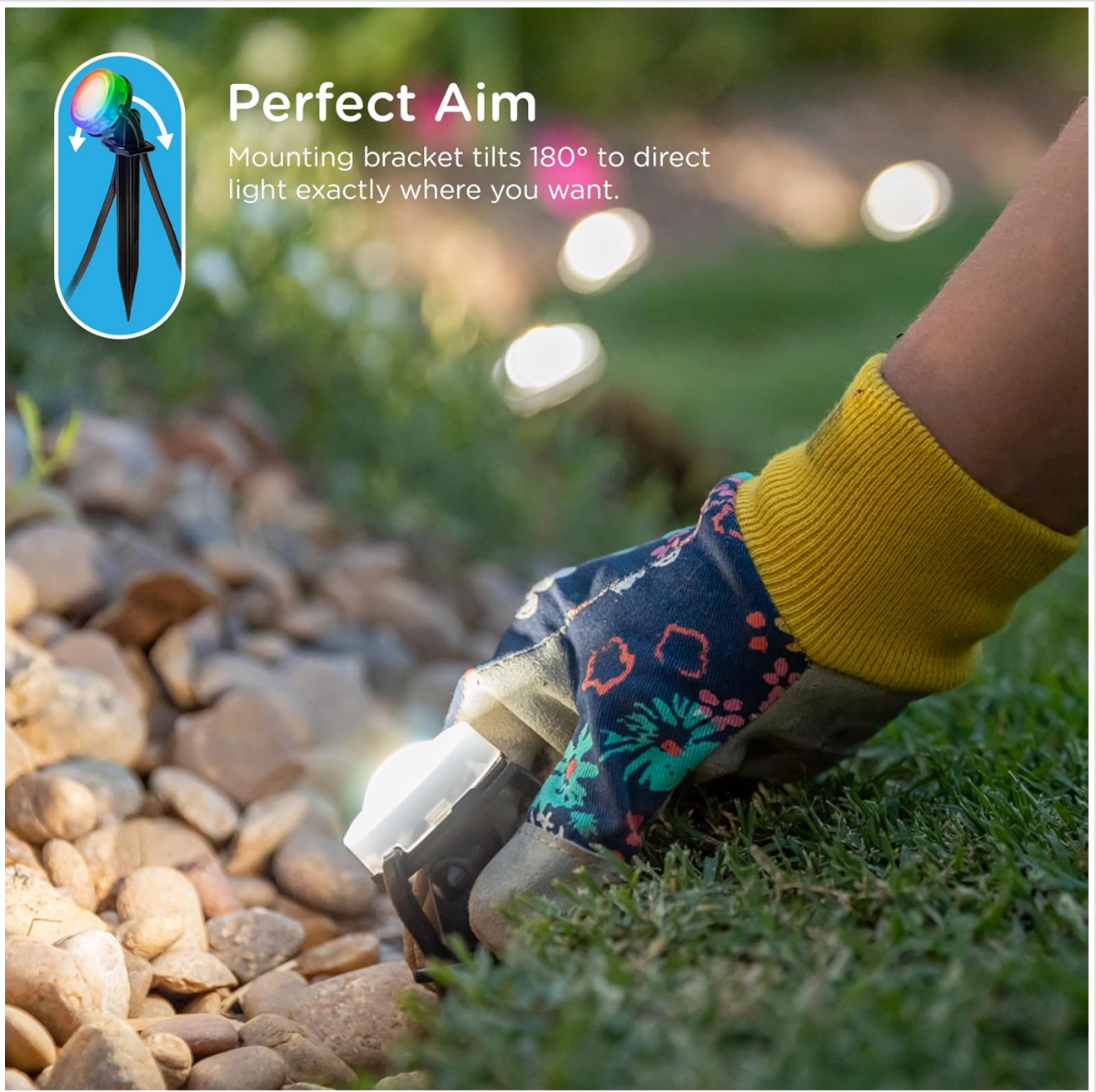
Image: A close-up of a hand installing a puck light into the ground, showing the adjustable mounting bracket.

Mounting bracket tilts 180° to direct light exactly where you want.