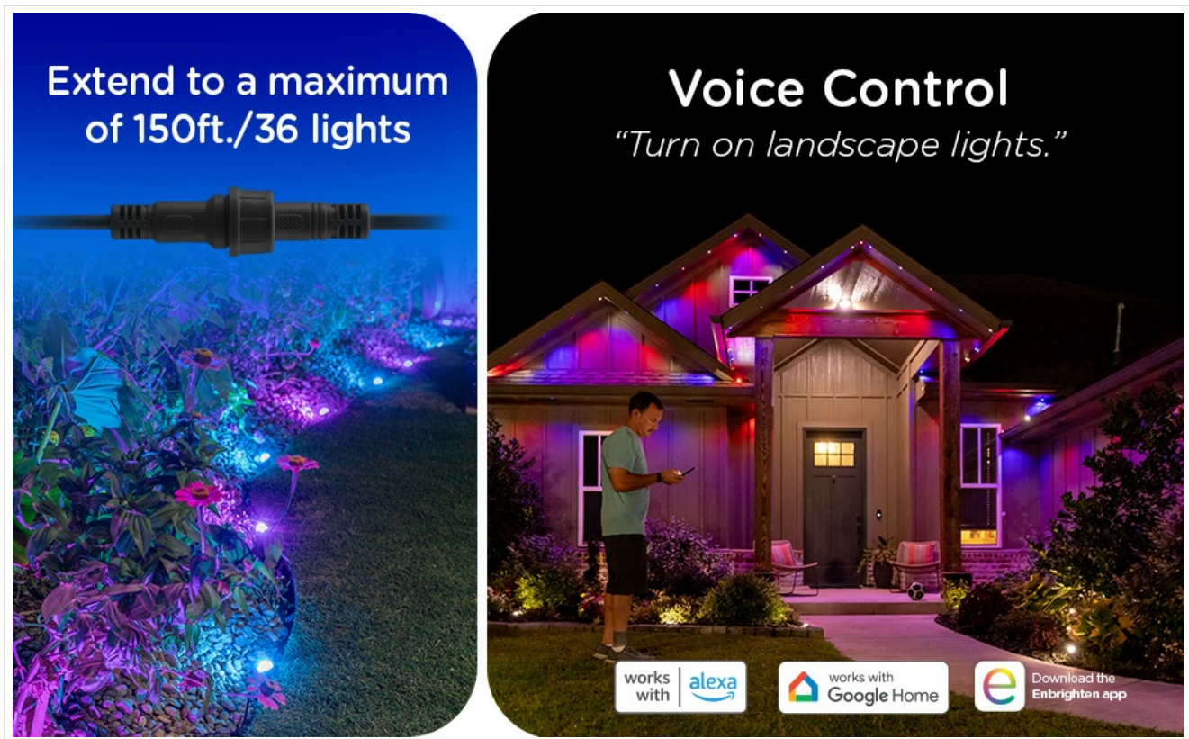
Image: The Enbrighten app interface demonstrating Wi-Fi control, with compatibility logos for Alexa and Google Home.