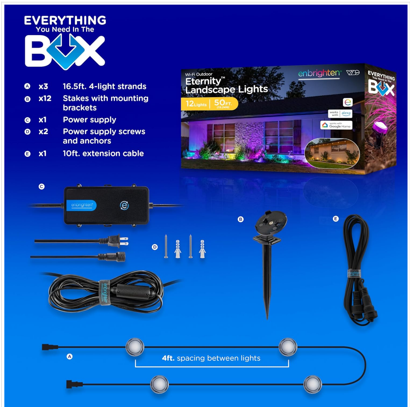
Image: All components included in the box, such as light strands, stakes, power supply, and extension cable.