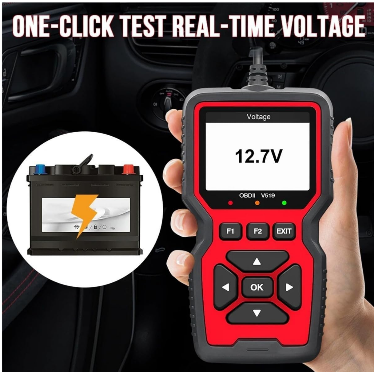
Figure 6.3: The V519 scanner displaying a real-time voltage reading of 12.7V, with an illustration of a car battery. This function allows for a quick check of the vehicle's battery voltage.