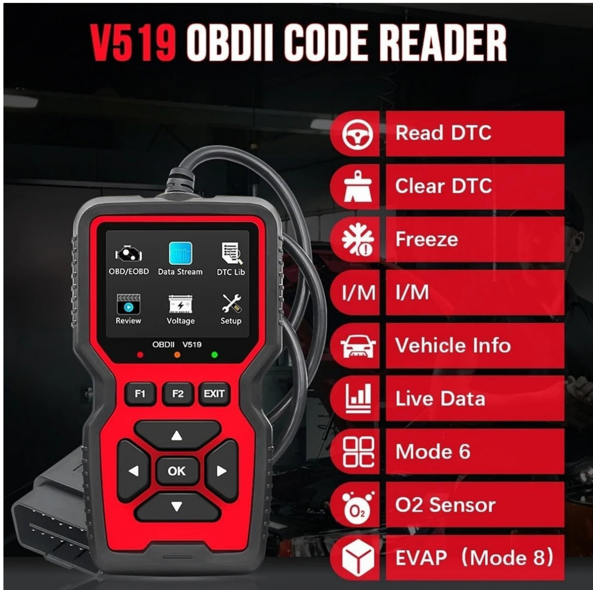
Figure 4.2: Diagram illustrating the main functions of the V519 OBDII Code Reader, including Read DTC, Clear DTC, Freeze Frame, I/M Readiness, Vehicle Info, Live Data, Mode 6, O2 Sensor, and EVAP (Mode 8).