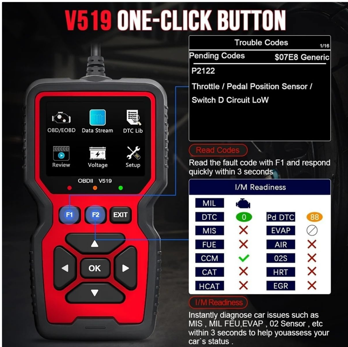
Figure 6.2: Screen display showing "Trouble Codes" (P2122 - Throttle / Pedal Position Sensor / Switch D Circuit Low) and "I/M Readiness" status indicators for various monitors (MIL, DTC, MIS, FUE, EVAP, AIR, O2S, CCM, CAT, HRT, HCAT, EGR). This function allows for quick assessment of emission system status.

This function checks the readiness of the vehicle's emission monitoring systems. It indicates if all monitors have completed their diagnostic cycles.