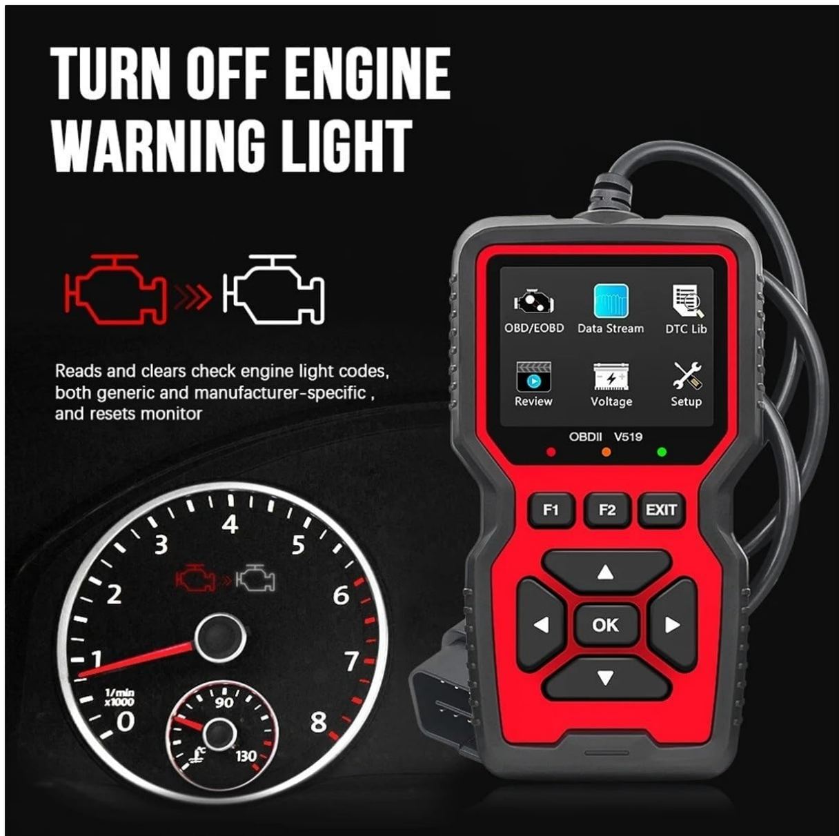
Figure 6.1: Image showing the V519 scanner connected to a vehicle, with an illustration of a dashboard indicating a check engine light being turned off after reading and clearing codes. The scanner reads and clears both generic and manufacturer-specific codes.