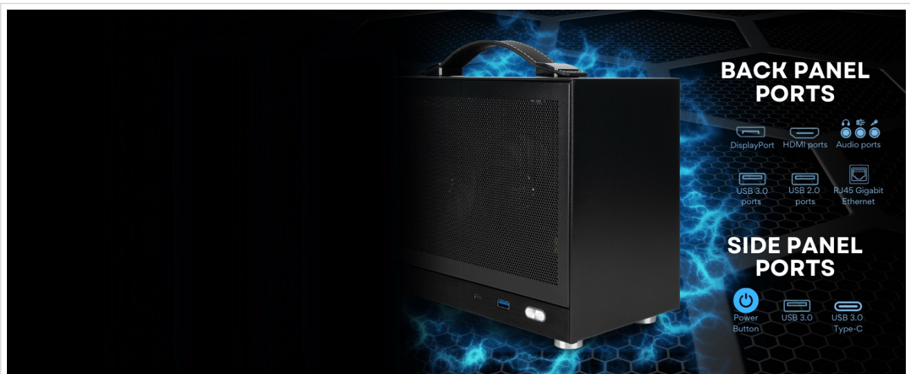
Figure 3: Overview of the back and side panel ports for connecting peripherals.