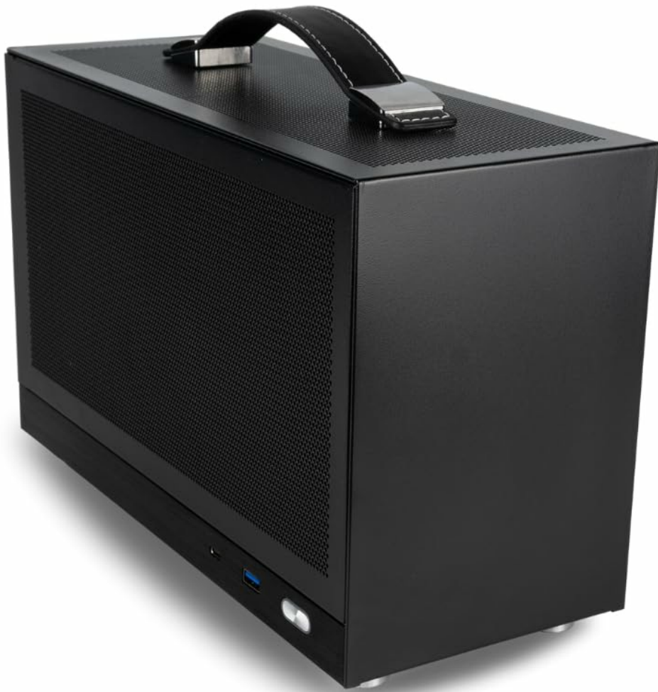
Figure 1: Empowered PC LAN Gamer RTX 5060 Mini ITX SFF Desktop.