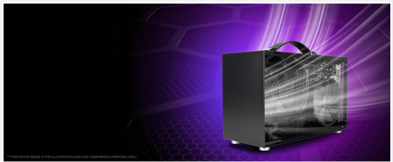
Figure 4: The LAN Gamer PC is suitable for various applications including gaming, streaming, and work tasks.

Video 2: A demonstration of the LAN Gamer Mini Gaming PC (White variant), highlighting its compact size and gaming capabilities.