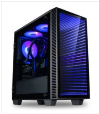
Figure 7: This product includes lifetime technical and diagnostic support.