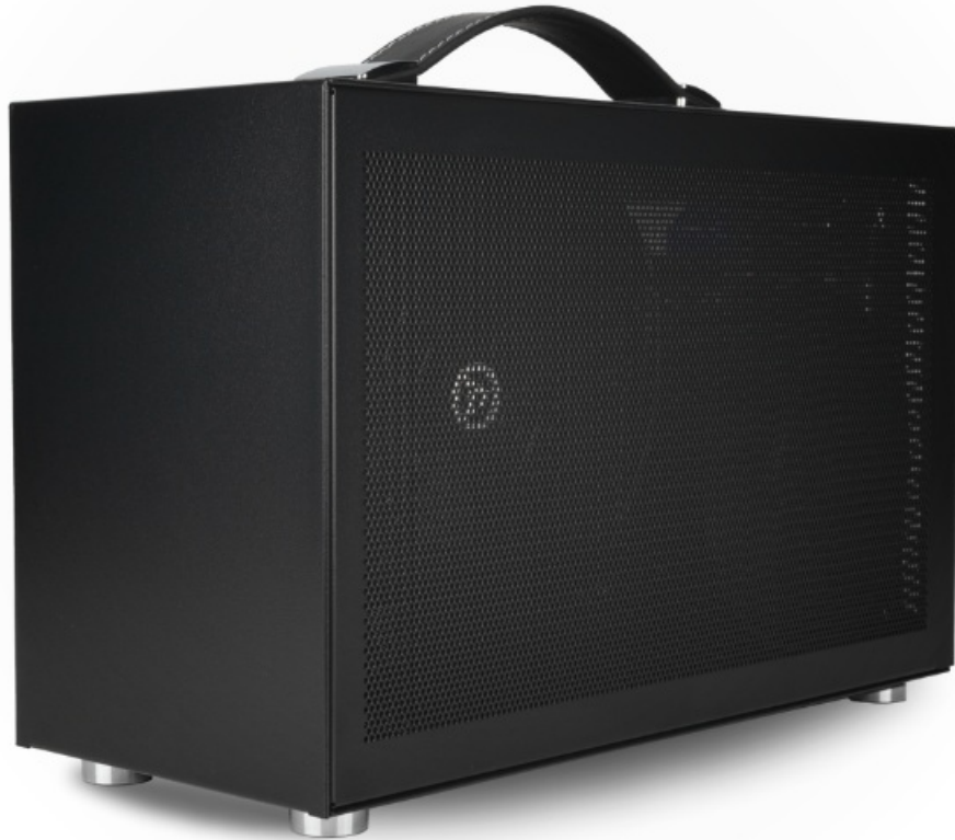
Figure 2: The compact design of the LAN Gamer Mini PC, featuring a carrying handle for portability.