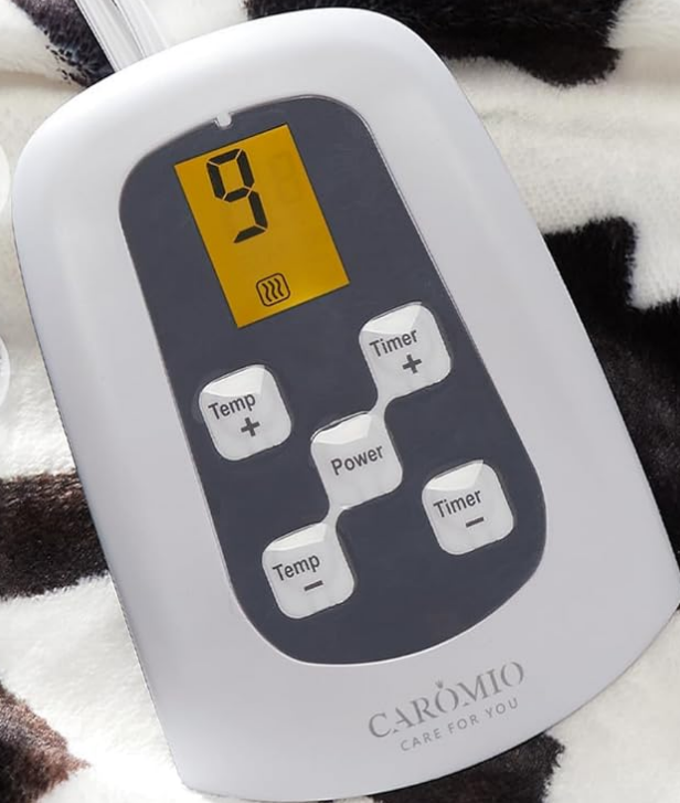
Image: Close-up of the LCD controller, showing buttons for temperature adjustment (Temp +/-, Power), and timer settings (Timer +/-). The display shows "9" for heat level.