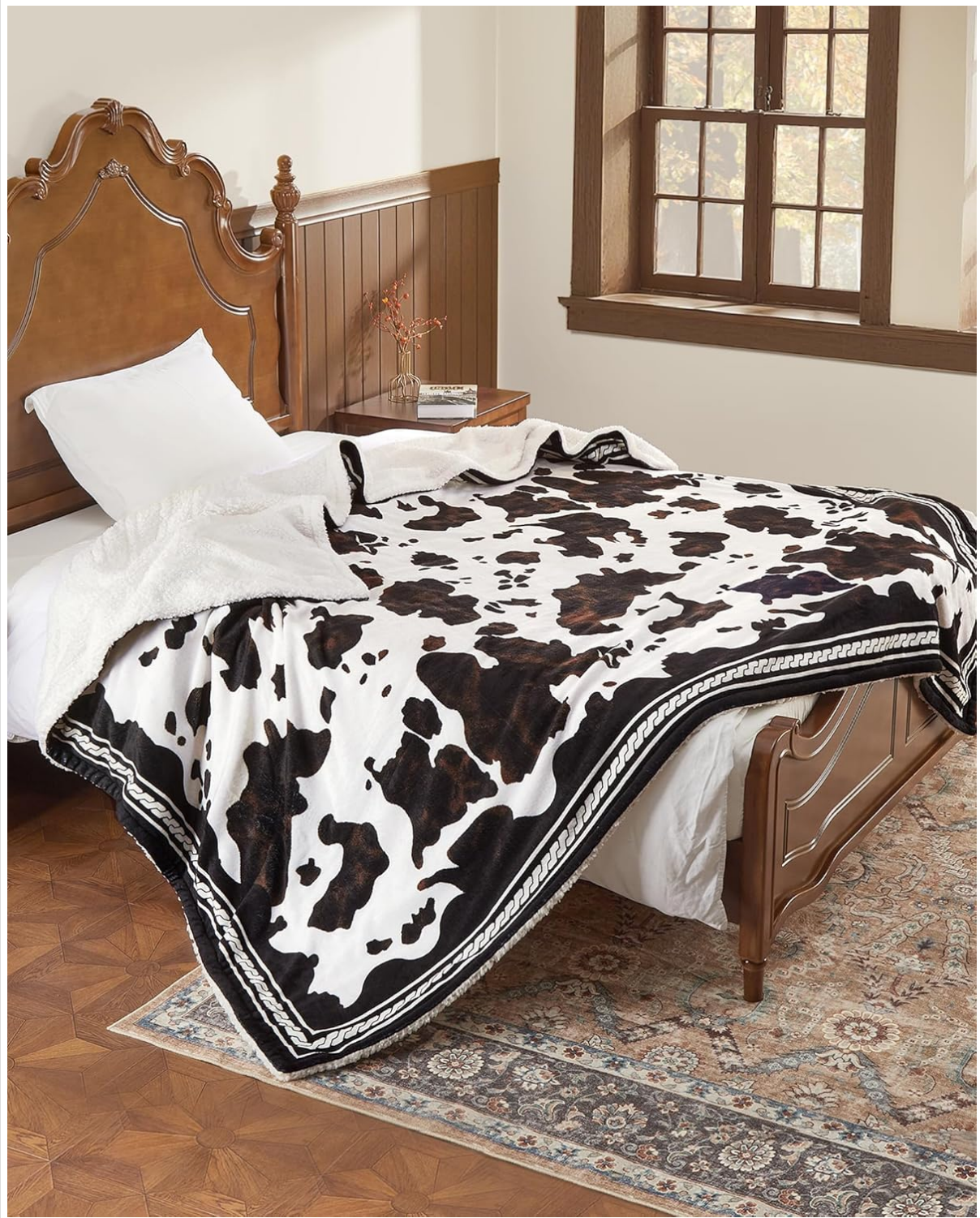
Image: The CAROMIO Heated Electric Blanket in cow print design, draped over a bed.