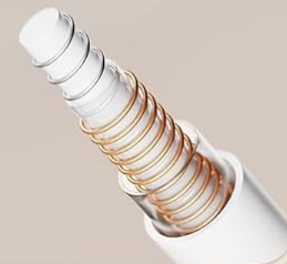
Image: Cross-section view showing the layers of the electric blanket, highlighting the 220 GSM milk velvet, double layer non-woven fabric, PTC/NTC heating wires, and 210 GSM sherpa, emphasizing upgraded safety features.