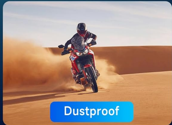
Image: Features highlighting the device's IP67 waterproof, quake-proof, and dustproof capabilities, suitable for various riding environments.