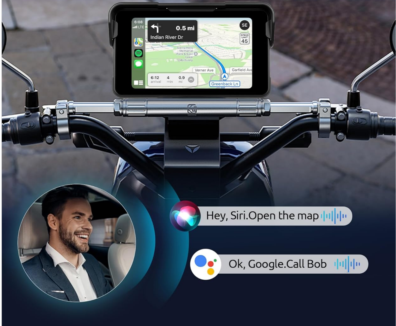
Image: Display of voice control functionality for GPS navigation, calls, and music, compatible with Google Maps and Apple Maps.