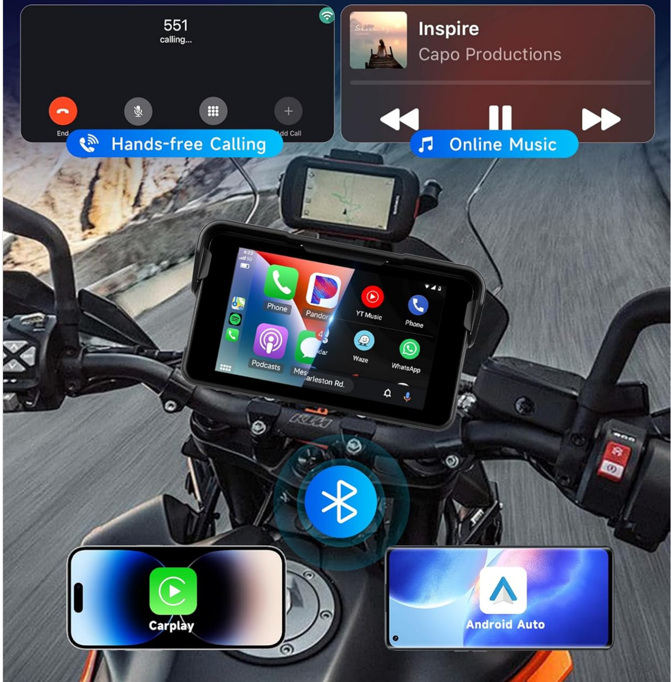
Image: The device interface showing wireless CarPlay and Android Auto connectivity, including hands-free calling and online music playback.