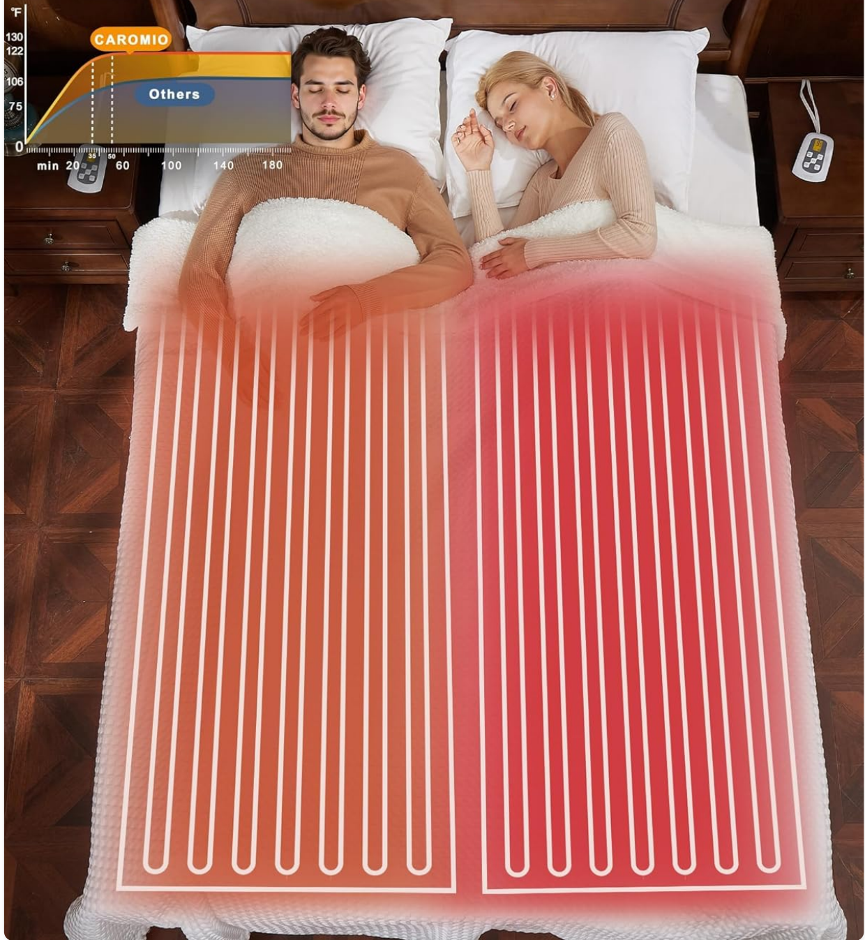
Image: The LCD dual controllers for the CAROMIO heated blanket, illustrating the 10 temperature modes and 1-12 hour timer settings.

Data show 82% couples have 5°F+ sleep preferences |Dual-zone system resolves the sleep temperature gap