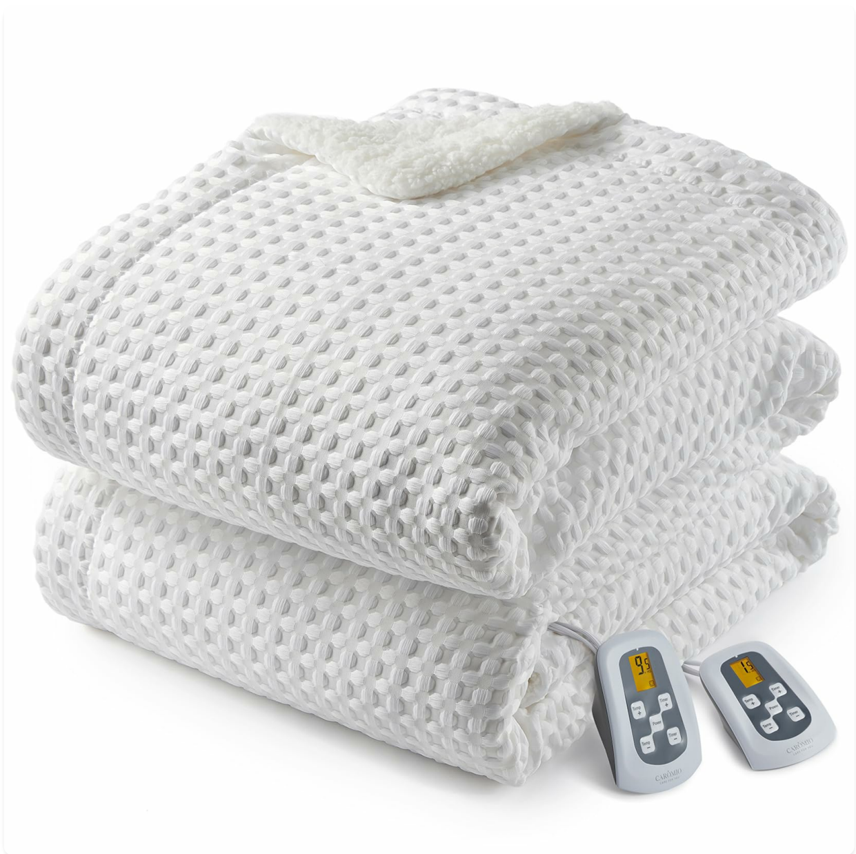
Image: The CAROMIO Queen Size Heated Blanket in off-white, laid out on a bed, highlighting its safety features like overheat and warm protection.