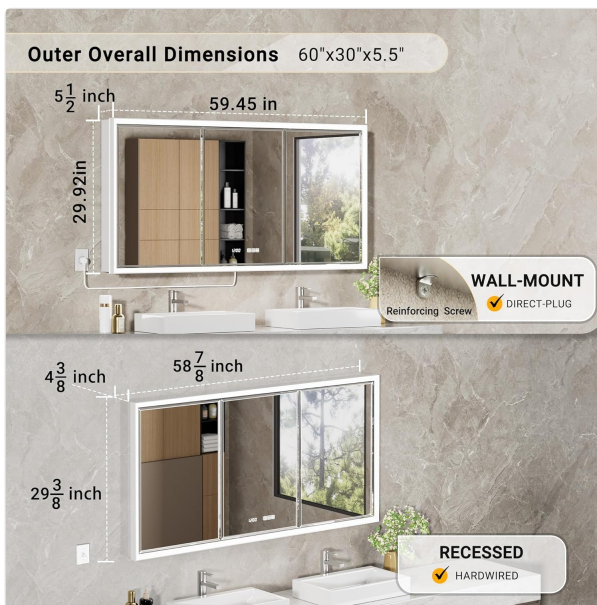
Figure 5.1: Outer Overall Dimensions for Surface and Recessed Mounting (60x30x5.5 inches)

Your QueenFun medicine cabinet can be installed using two methods: surface-mount or recessed-mount.