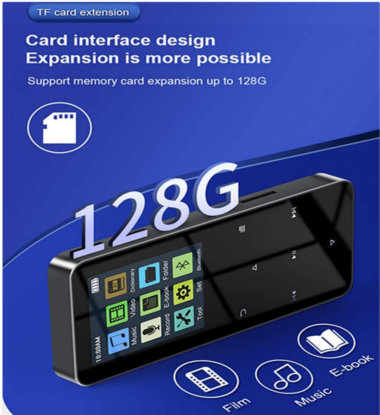
Illustration showing the TF card slot for memory expansion up to 128GB.

Your MP3 player comes with a 32GB TF card pre-installed. If you wish to expand storage, you can replace it with a TF card up to 128GB. Locate the TF card slot on the side of the device. Gently insert the TF card into the slot until it clicks into place. To remove, push the card in slightly until it springs out.