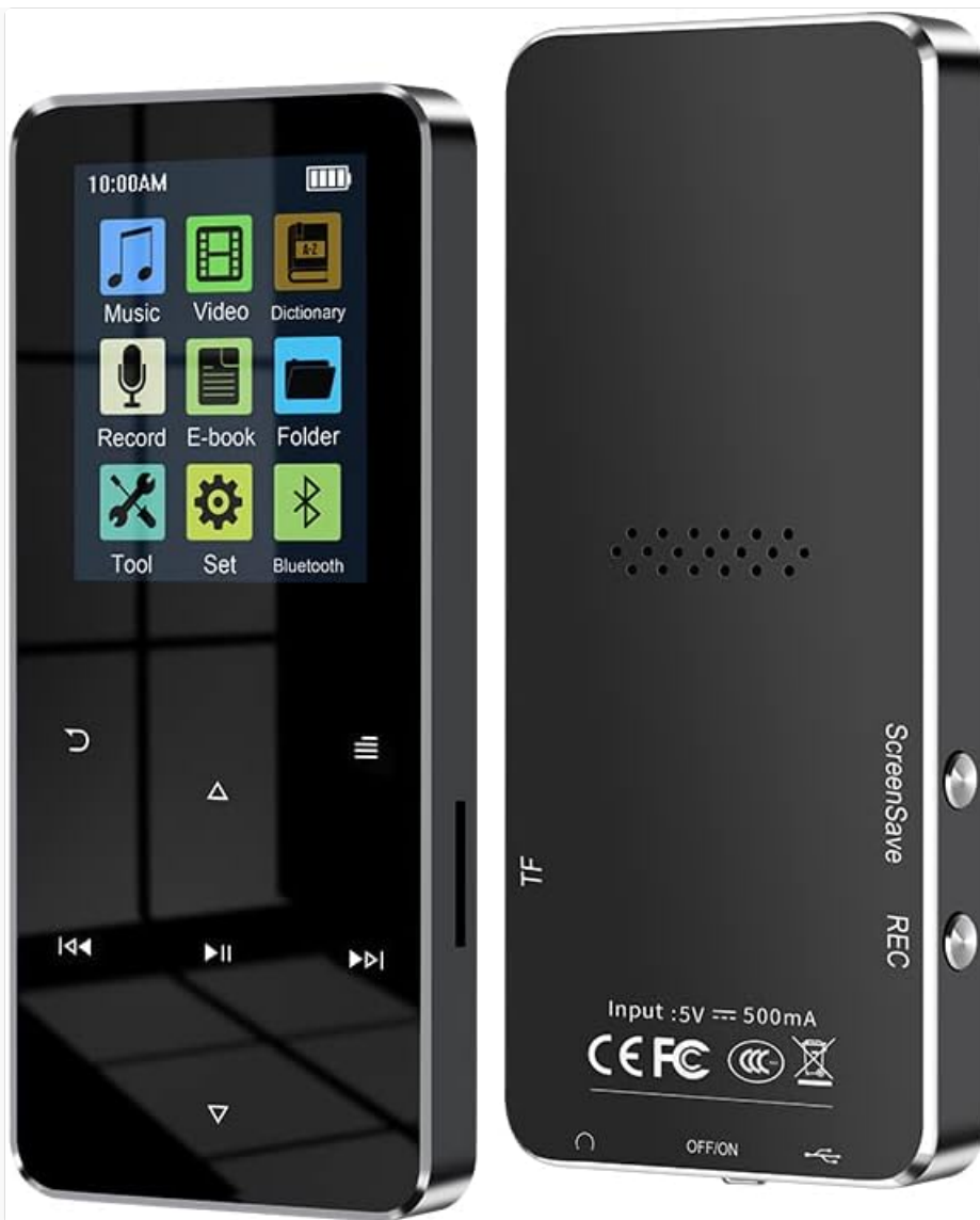
Front and back view of the RIJAHO 64GB MP3 Player, showcasing its compact design and touch buttons.