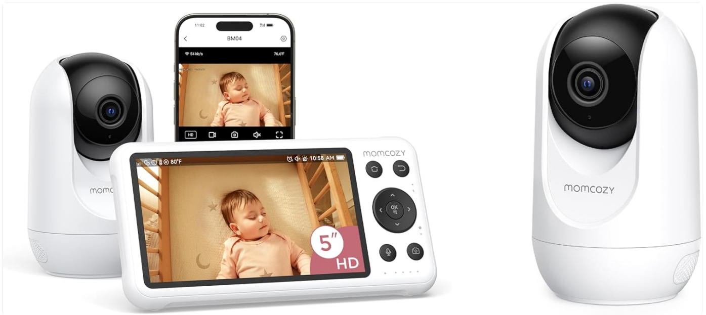
Image: The Momcozy Smart WiFi Baby Monitor system, showing the parent unit, camera, and the mobile application interface.