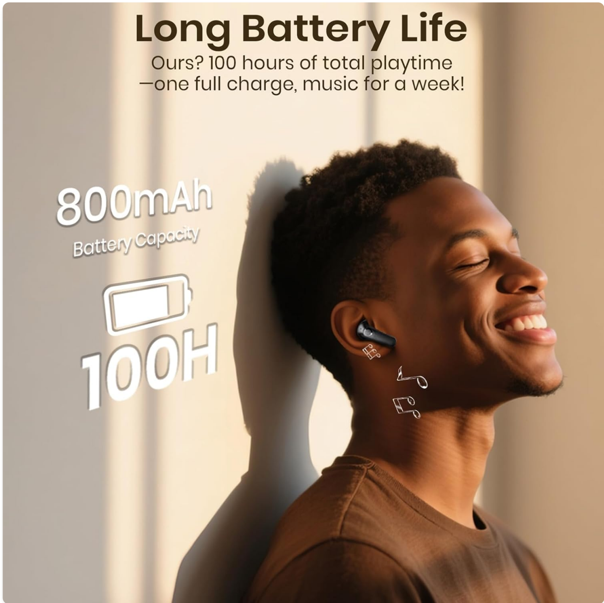
Image: Visual representation of the 100-hour total playtime and 800mAh battery capacity of the charging case.