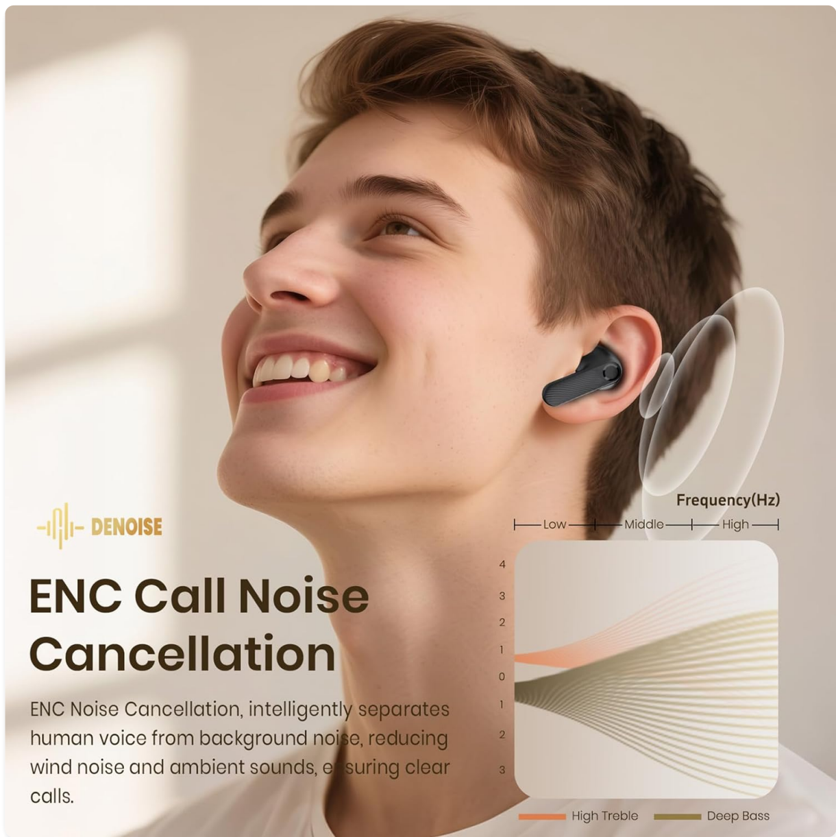
Image: A graphic representation of how Environmental Noise Cancellation (ENC) filters out background noise during calls.