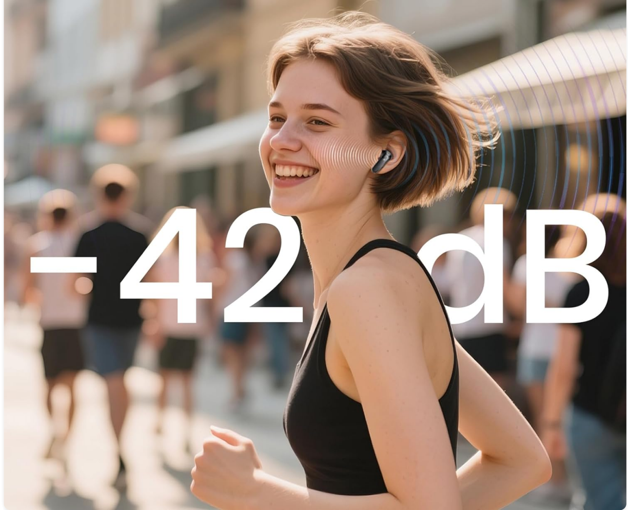
Image: A person using the earbuds in a busy setting, illustrating the effectiveness of Active Noise Cancellation.

-42dB Noise Cancellation Perfect for commuting, workouts, or deep focus.