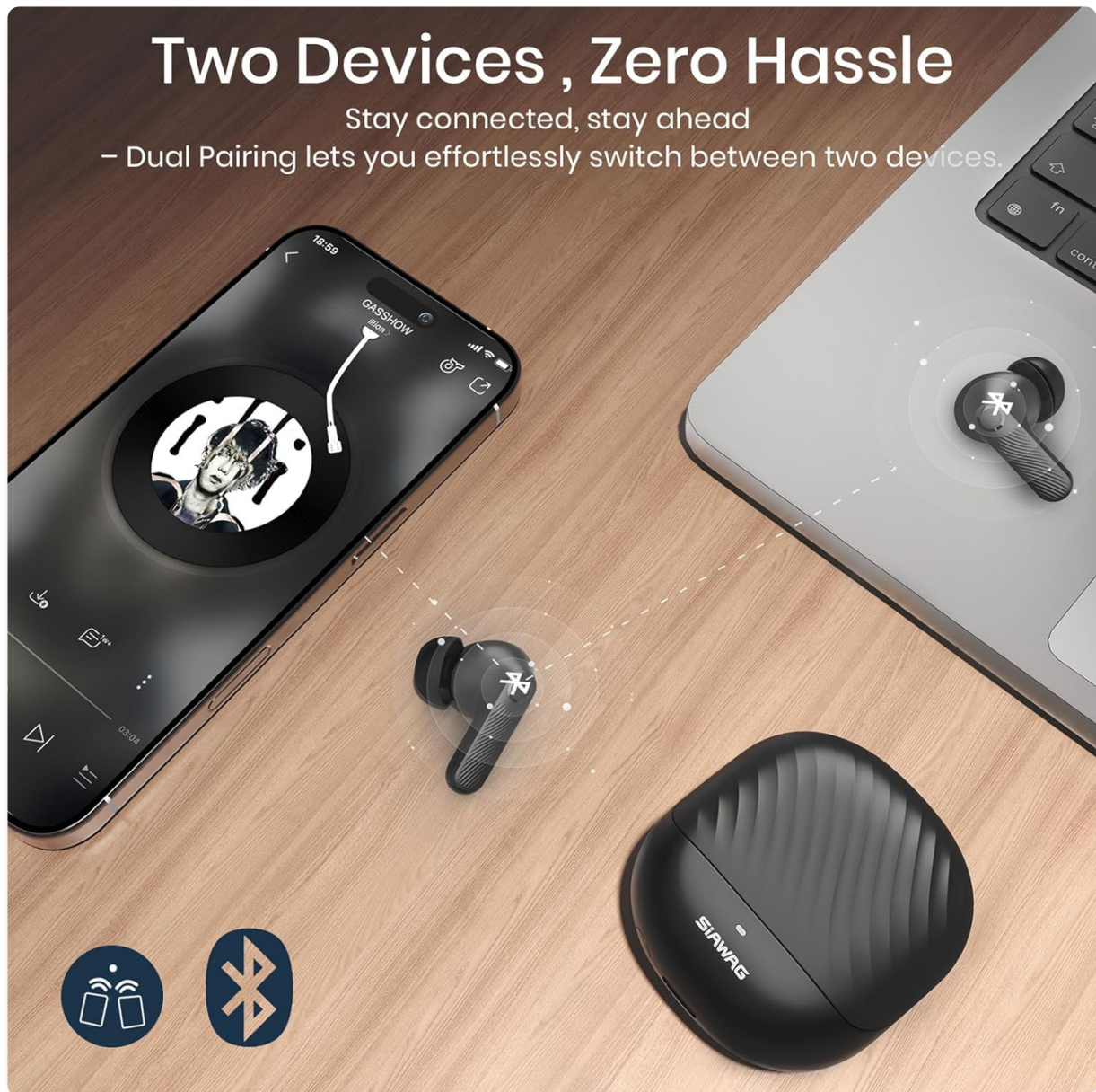
Image: Earbuds connected to both a smartphone and a laptop, demonstrating dual device connectivity.