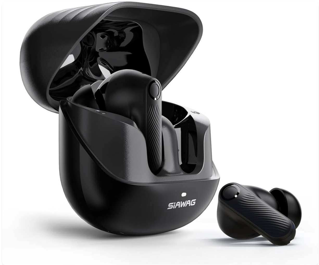
Image: SIAWAG BTW73001 Wireless Earbuds in their charging case, with one earbud removed.

The SIAWAG BTW73001 Wireless Earbuds are designed for high-quality audio and communication, featuring Bluetooth 5.4 connectivity, Active Noise Cancellation (ANC), Environmental Noise Cancellation (ENC), and IPX5 water resistance.