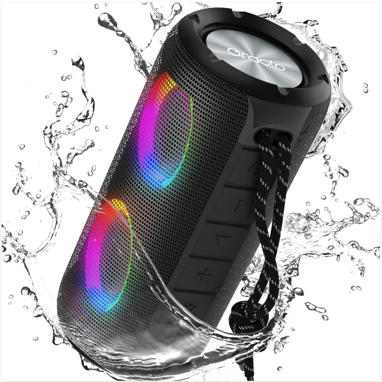
Image: The BUGANI Luster Bluetooth Speaker, showcasing its design and the vibrant light effects, surrounded by water splashes to highlight its waterproof capabilities.