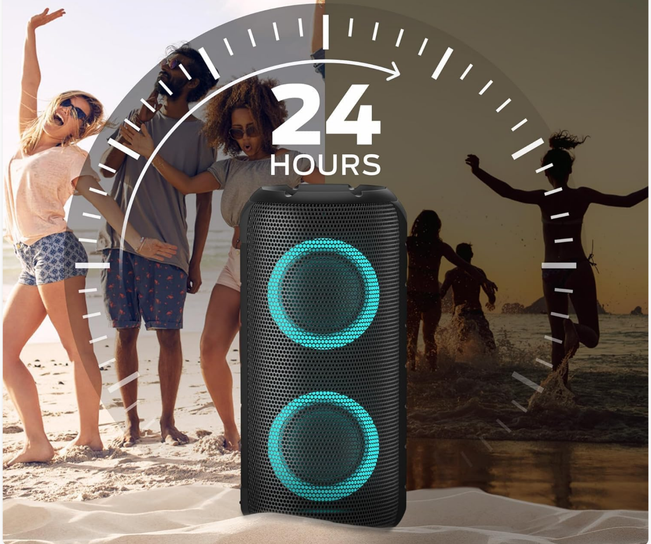
Image: The BUGANI Luster speaker showcasing its vibrant and dynamic colorful light patterns, which enhance the listening experience.

24+ Hours Playtime on 50% Volume off Lights