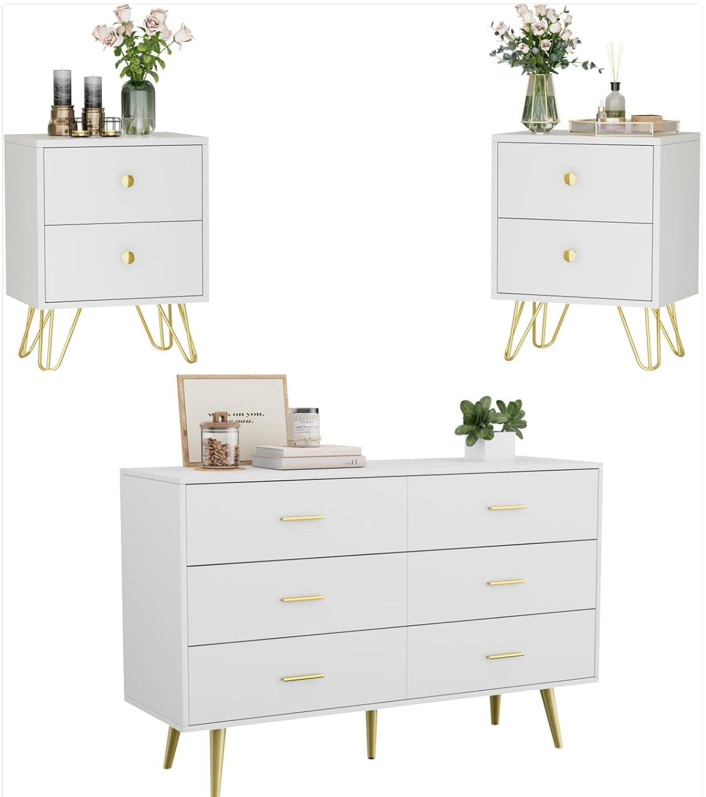
Image 3.1: An isolated view of the complete 3-piece set, including the dresser and two nightstands, as they appear in the package.