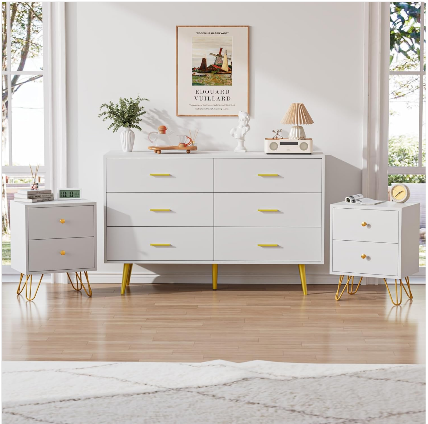
Image 1.1: The CARPETNAL White Dresser and Nightstand 3 Piece Set, showcasing the dresser and two nightstands in a room environment.