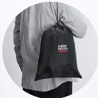
Image: Image showing the KEMIMOTO scooter leg cover folded and stored in its black drawstring carrying bag, with an inset showing the bag being placed in a scooter's storage compartment and carried. This illustrates the portability and convenient storage of the product.