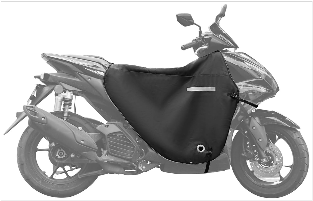
Image: KEMIMOTO Scooter Leg Cover L installed on a black scooter, viewed from the side. This image demonstrates the full coverage provided by the leg cover when mounted on a scooter.