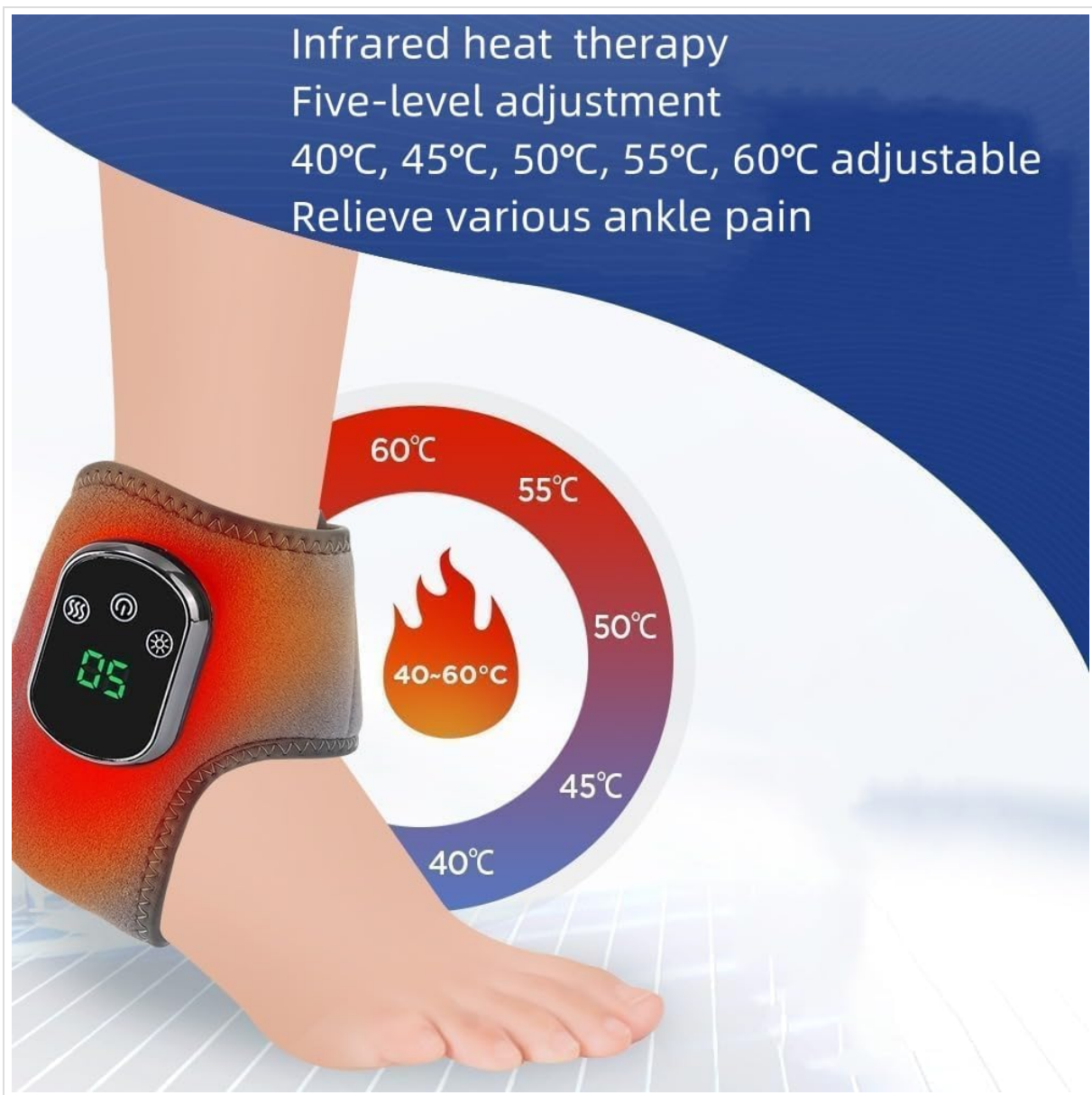
Image: Illustration of the infrared heat therapy feature, detailing the five adjustable temperature settings ranging from 40°C to 60°C.