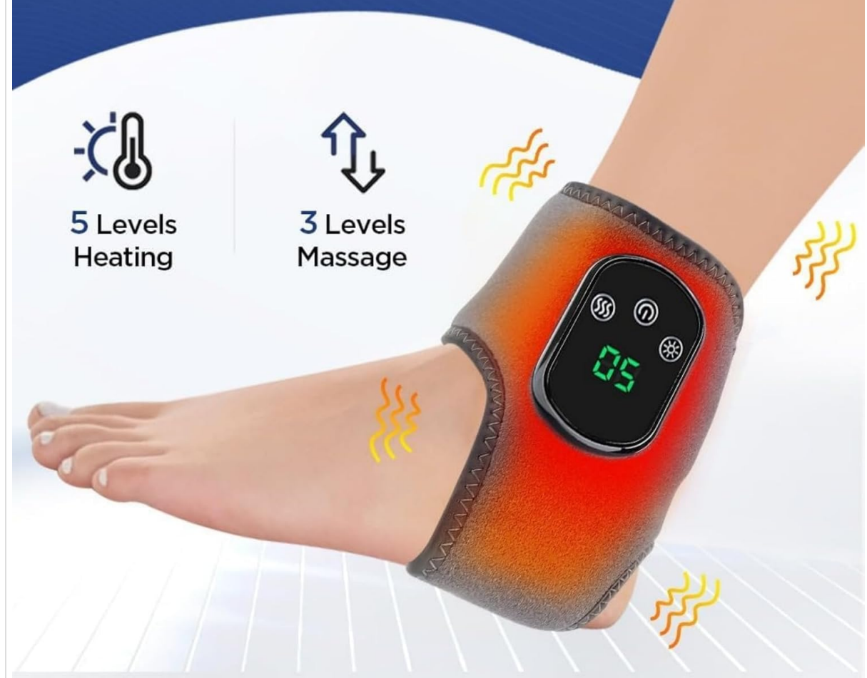
Image: Diagram showing the availability of 5 heating levels and 3 massage levels for personalized therapy.

Imitate traditional Chinese massage Suitable for different groups of people