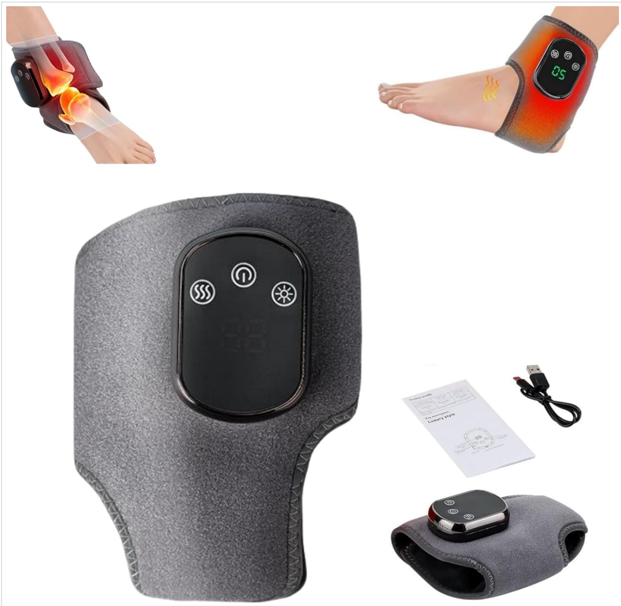
Image: The 3-in-1 Foot & Ankle Massager, showing its main unit, control panel, and included USB-C charging cable.