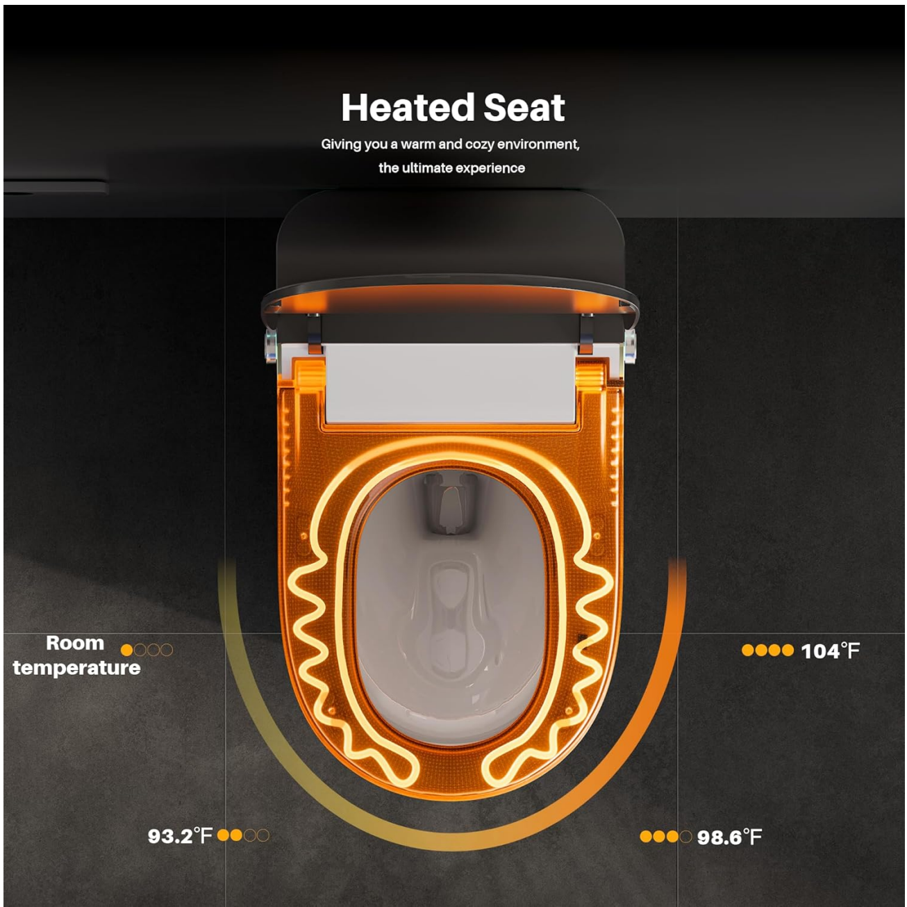
Figure 3: Auto-Sensing Features