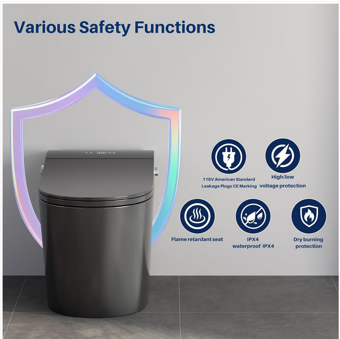
Figure 5: Heated Seat Functionality