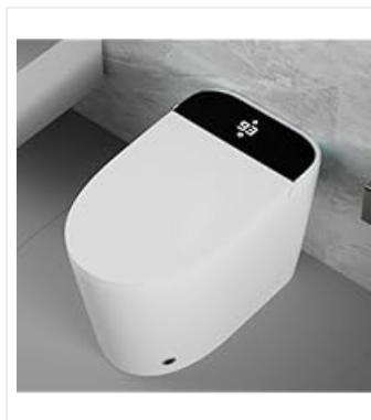
Figure 11: ADA Comfort Height