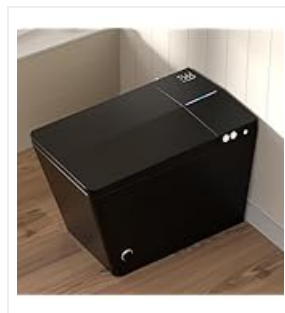
Figure 7: Soft Night Light Illumination

Your browser does not support the video tag.