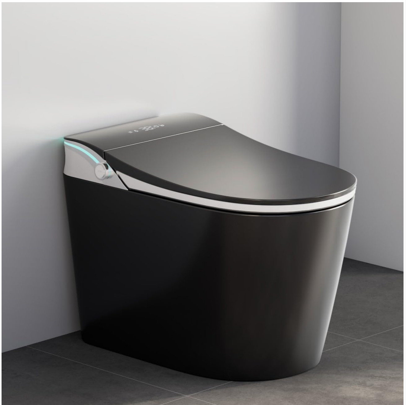
Figure 1: WinZo Smart Toilet SM8008-2