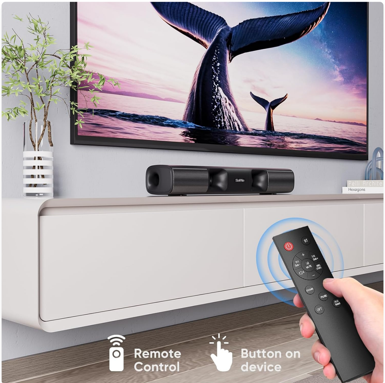
Figure 4.1: Remote control and on-device buttons for sound bar operation.