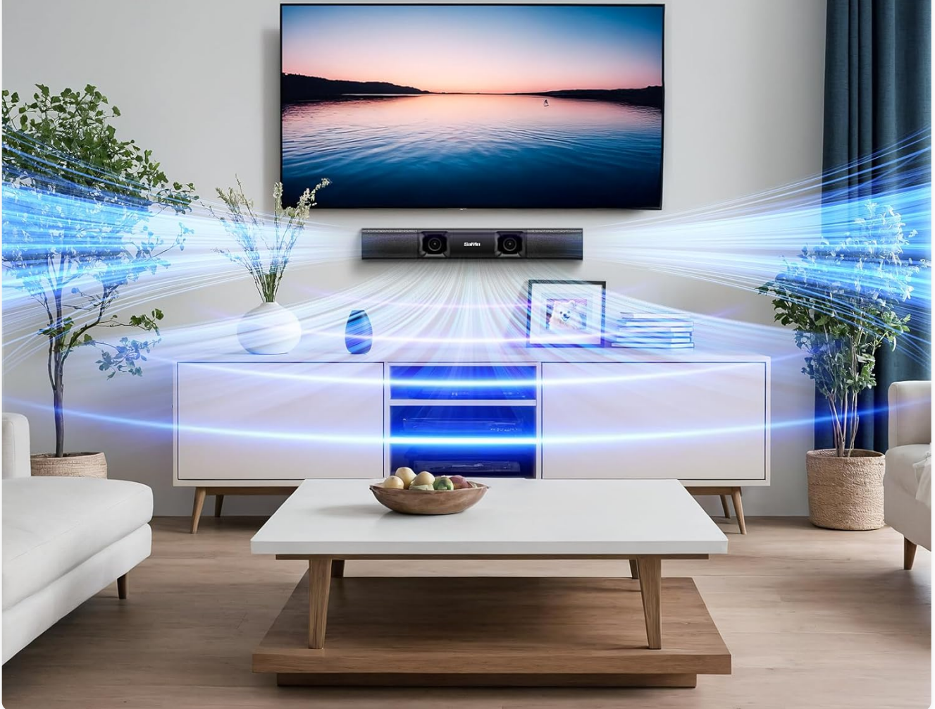
Figure 3.2: The sound bar can be wall-mounted to save space and enhance decor.