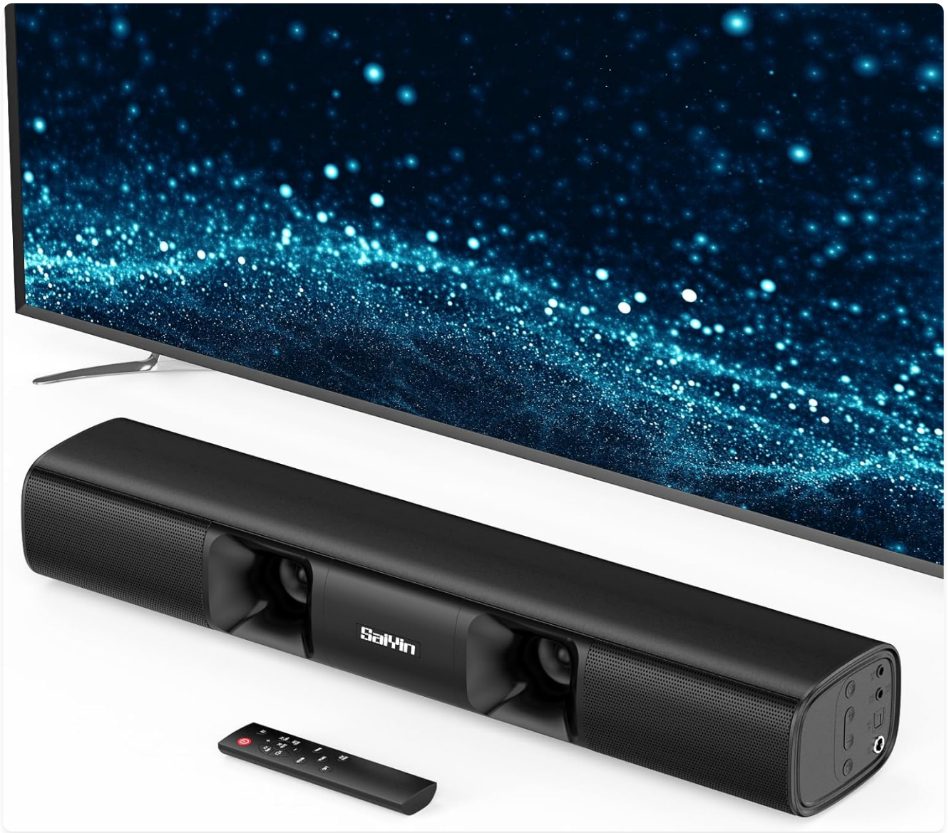
Figure 1.1: Saiyin DS6301H Pro Sound Bar in a typical setup.