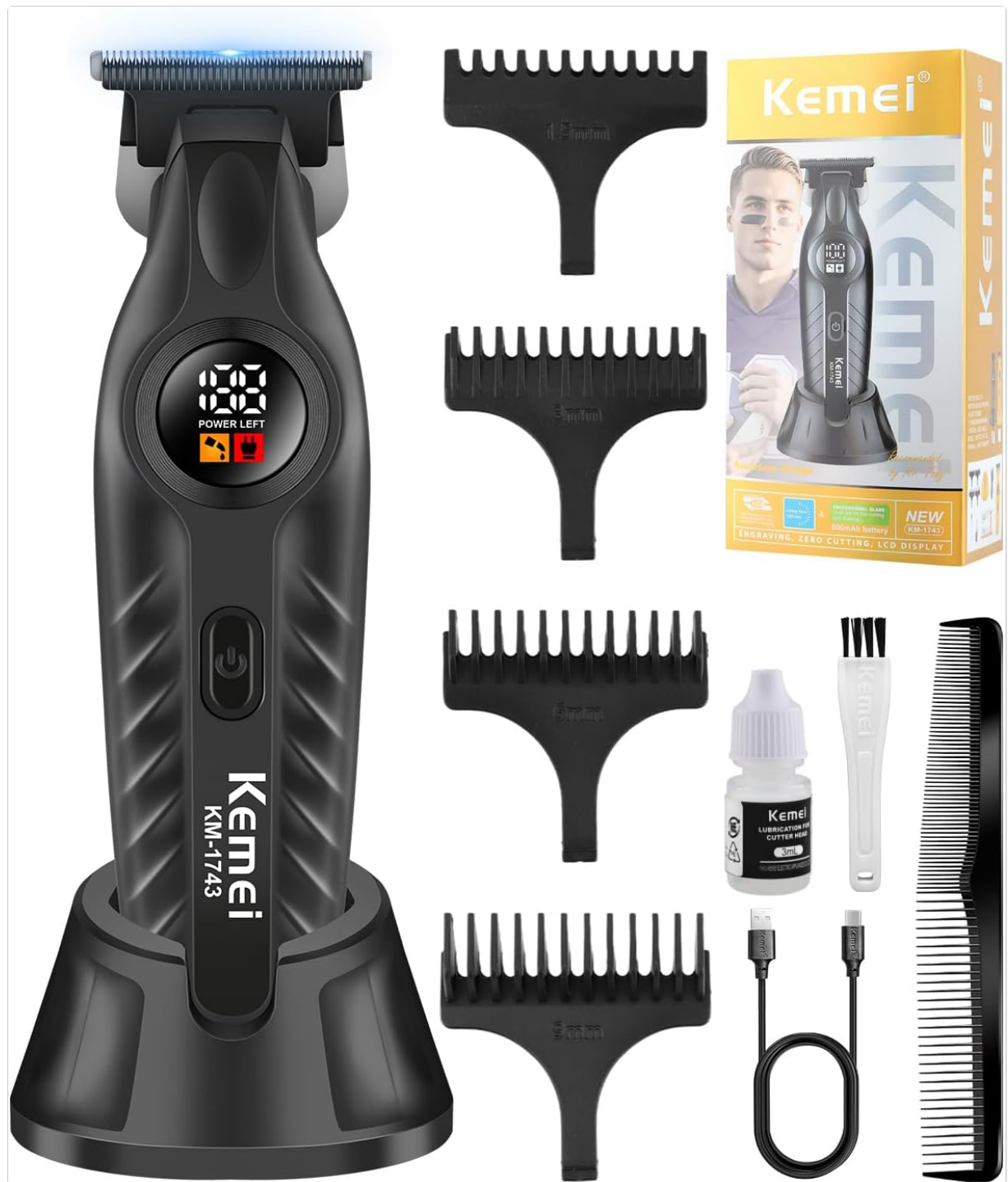
Figure 2.1: KEMEI 1743 Hair Clipper and included accessories.