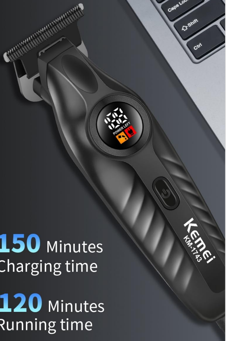
Figure 4.1: The KEMEI 1743 supports multiple USB charging options.