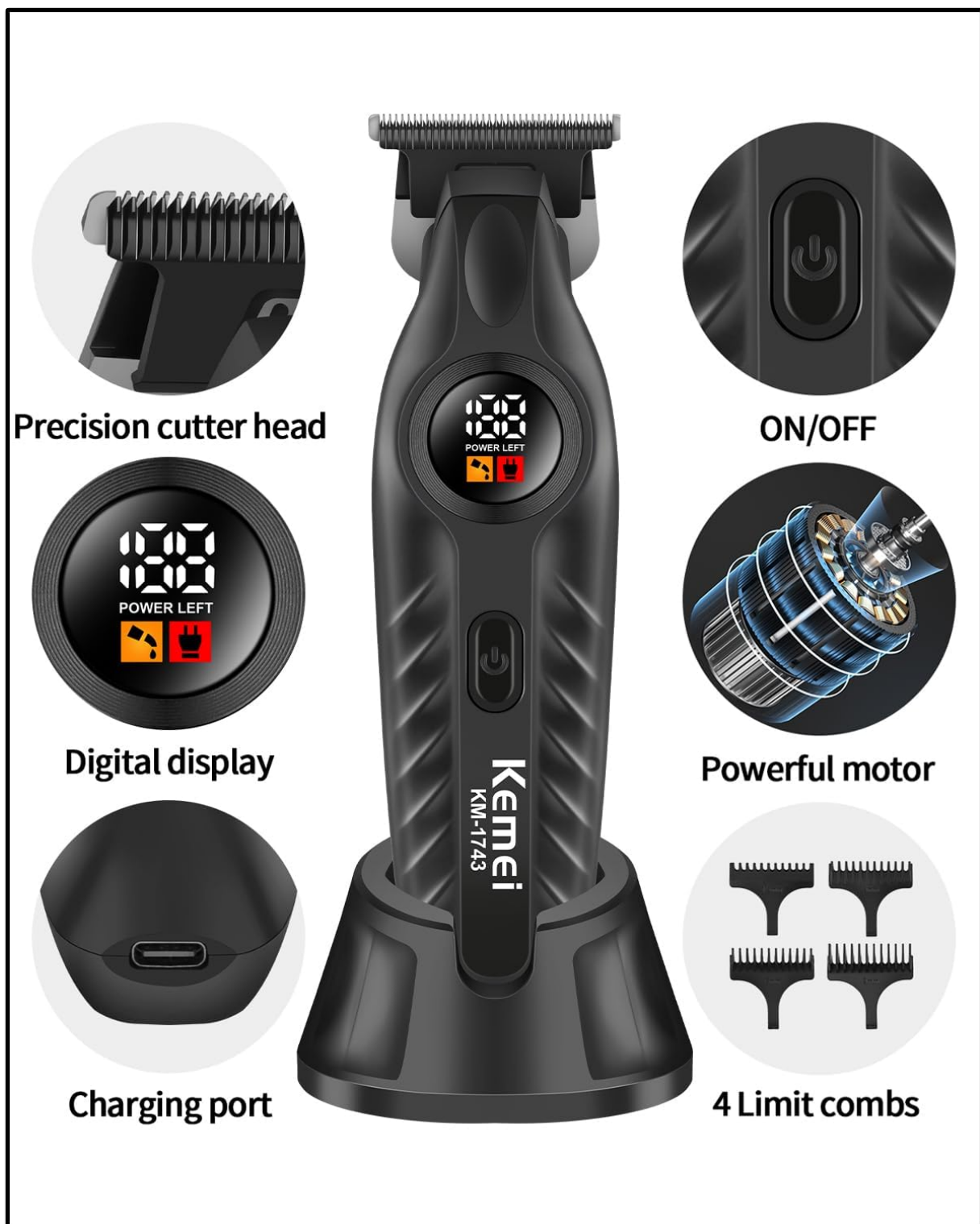
Figure 2.2: Key components of the KEMEI 1743 Hair Clipper.