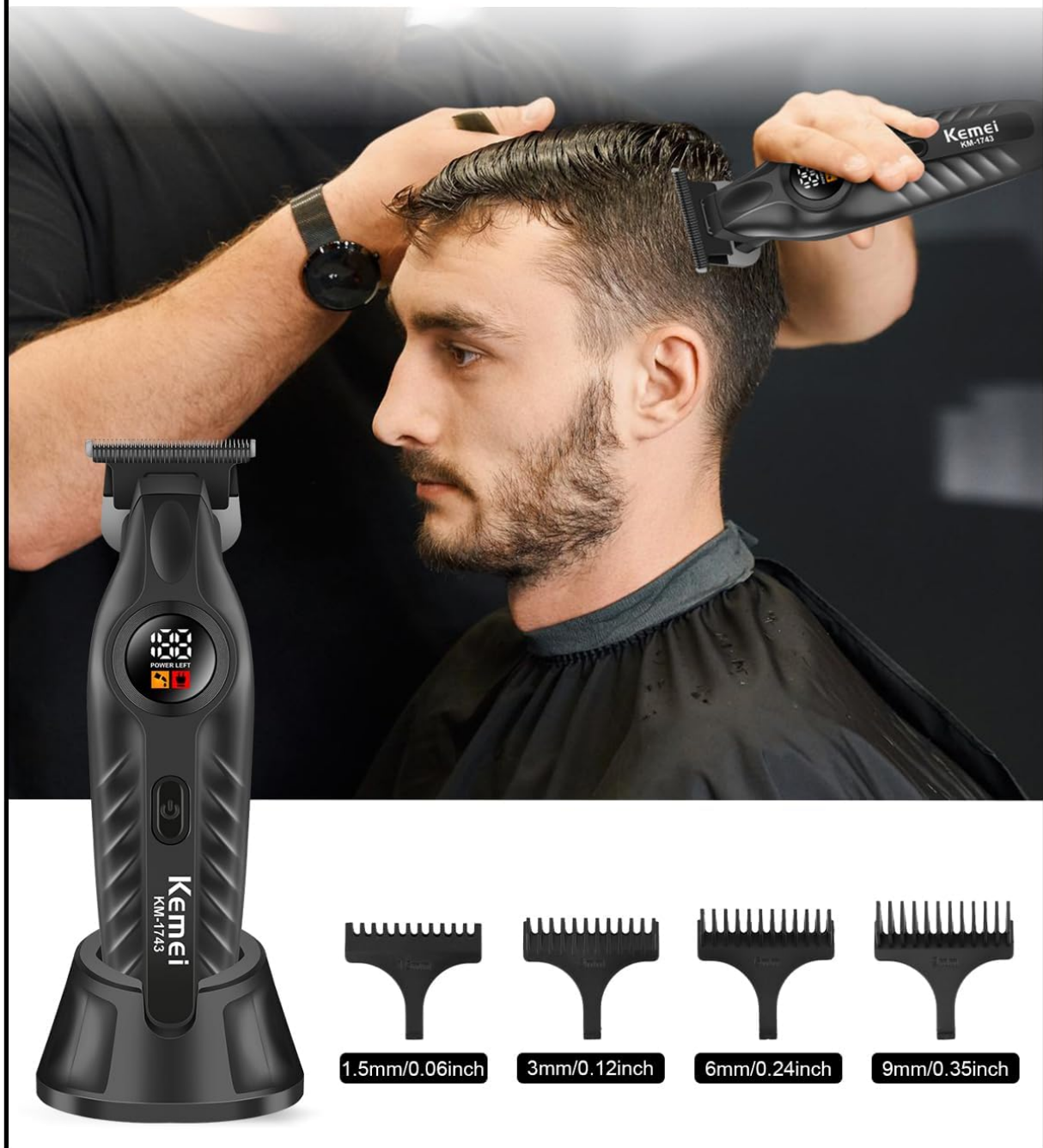
Figure 4.2: The KEMEI 1743 includes four guide combs for various lengths.