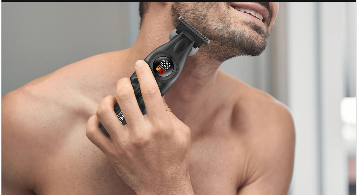
Figure 5.2: Demonstrating the KEMEI 1743 for professional trimming.