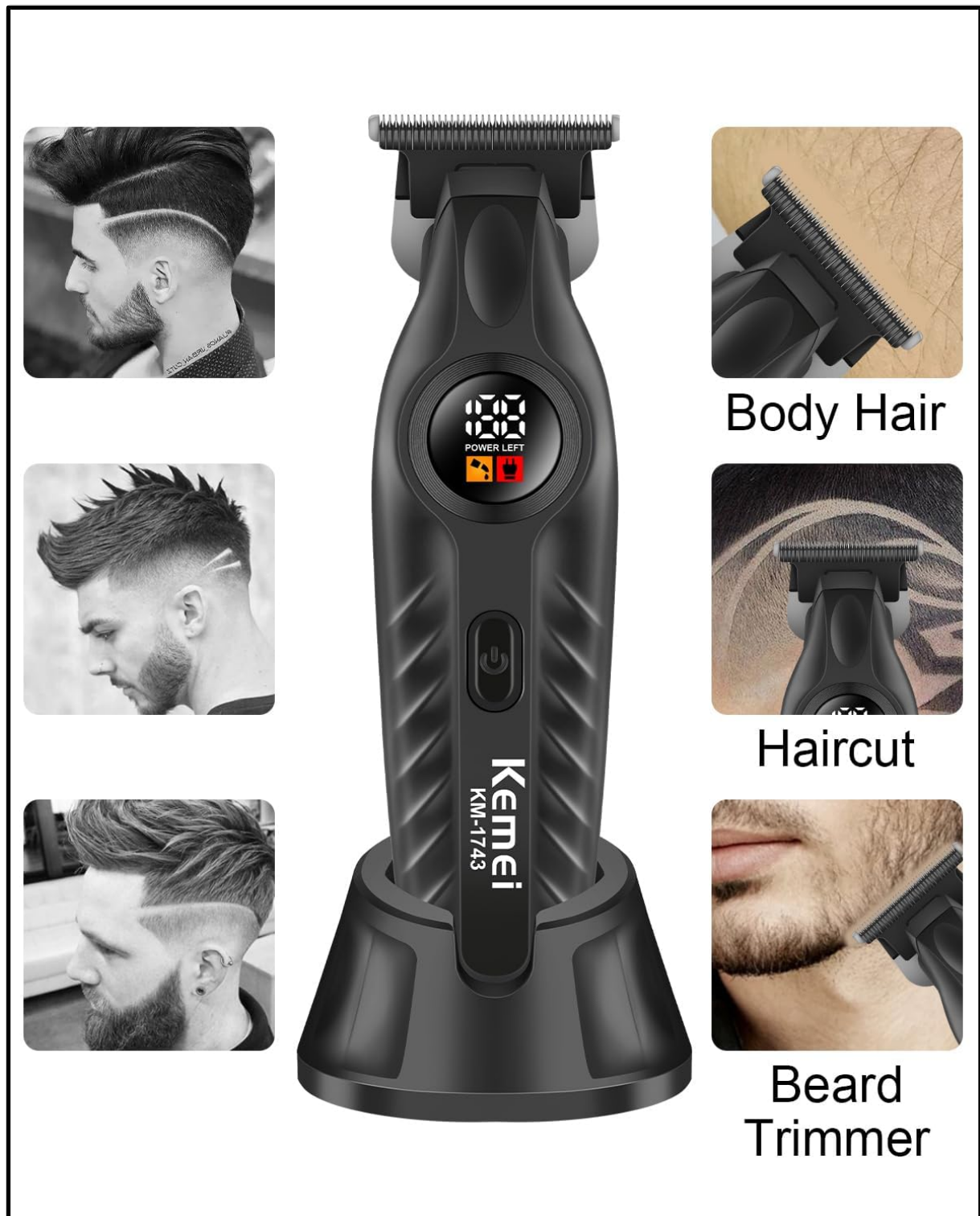
Figure 5.1: The KEMEI 1743 is suitable for various grooming applications.