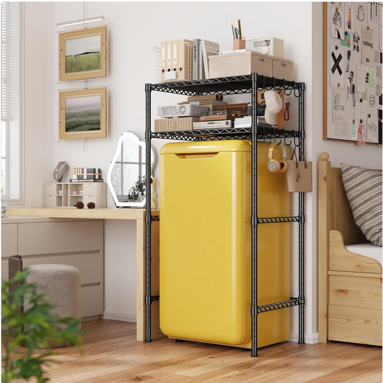
Figure 4.2: The shelf providing organized storage in a dorm room environment.