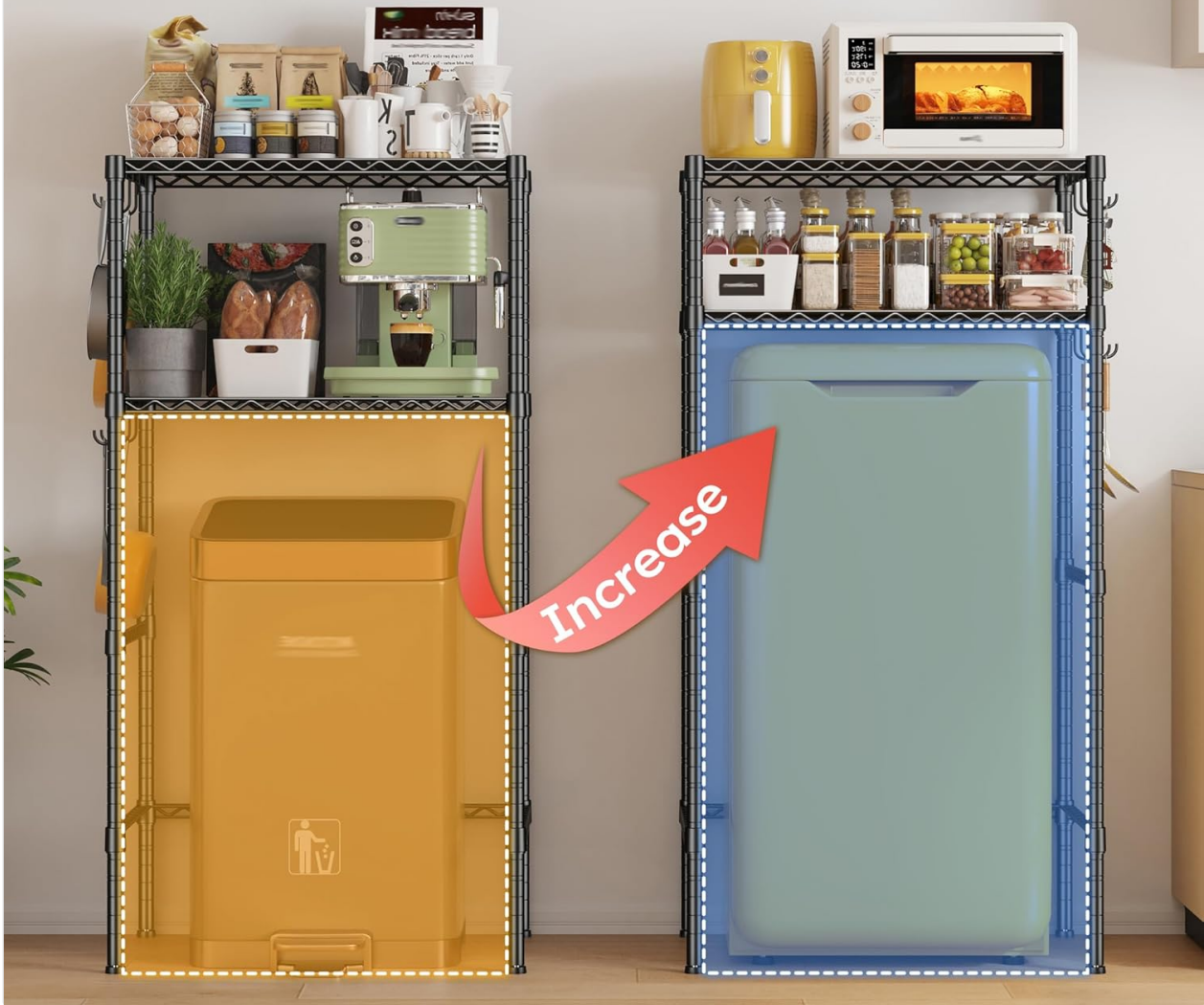
Figure 2.1: The adjustable height feature allows customization to fit various appliances and items.