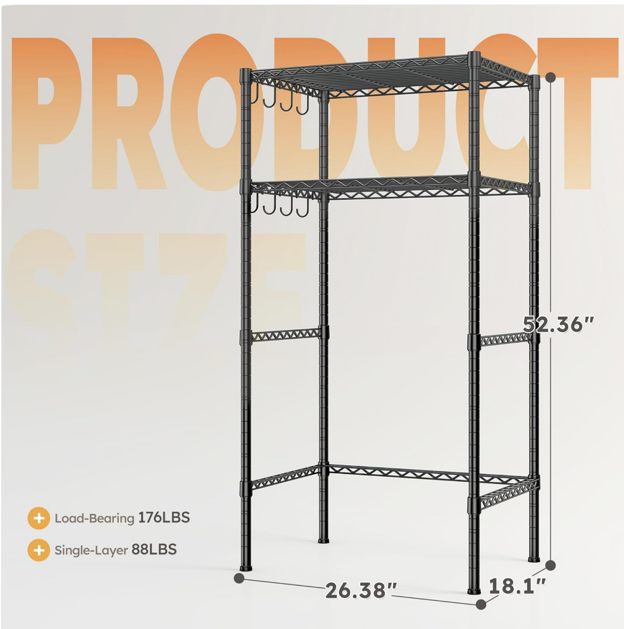
Figure 7.1: Detailed product dimensions for planning placement.

Bedrooms, Dorm Room, Kitchen, Living Room, Office