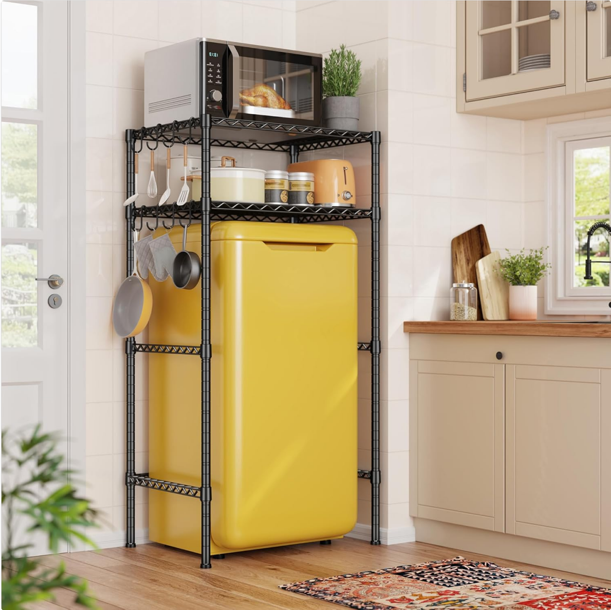
Figure 4.1: The shelf integrated into a kitchen setting, demonstrating its utility for appliances and storage.

The shelf has a total load capacity of up to 176 LBS, with each single layer supporting up to 88 LBS. Ensure weight is distributed evenly.