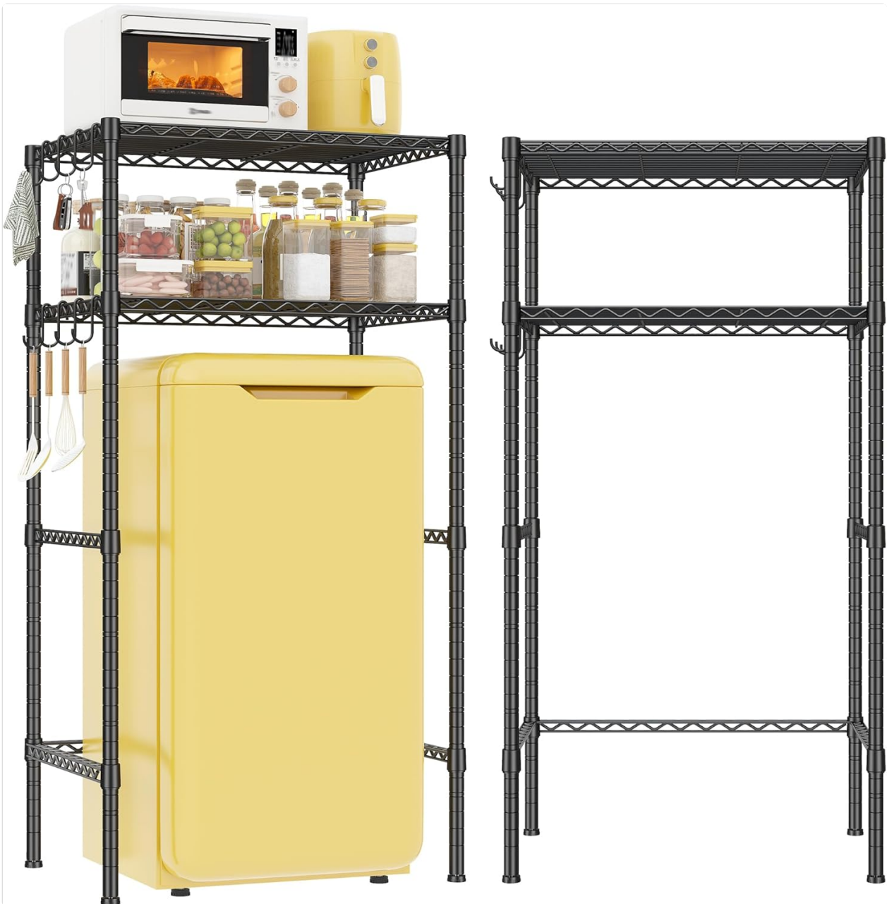
Figure 1.1: The REIBII 2 Tier Mini Fridge Shelf, showcasing its capacity to hold a mini fridge, microwave, and other items, optimizing vertical space.