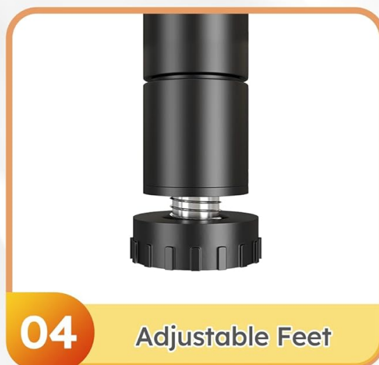
Figure 2.2: Detailed view of the shelf's components, including adjustable clamps, multifunctional hooks, sturdy V-mesh, and adjustable feet for stability.