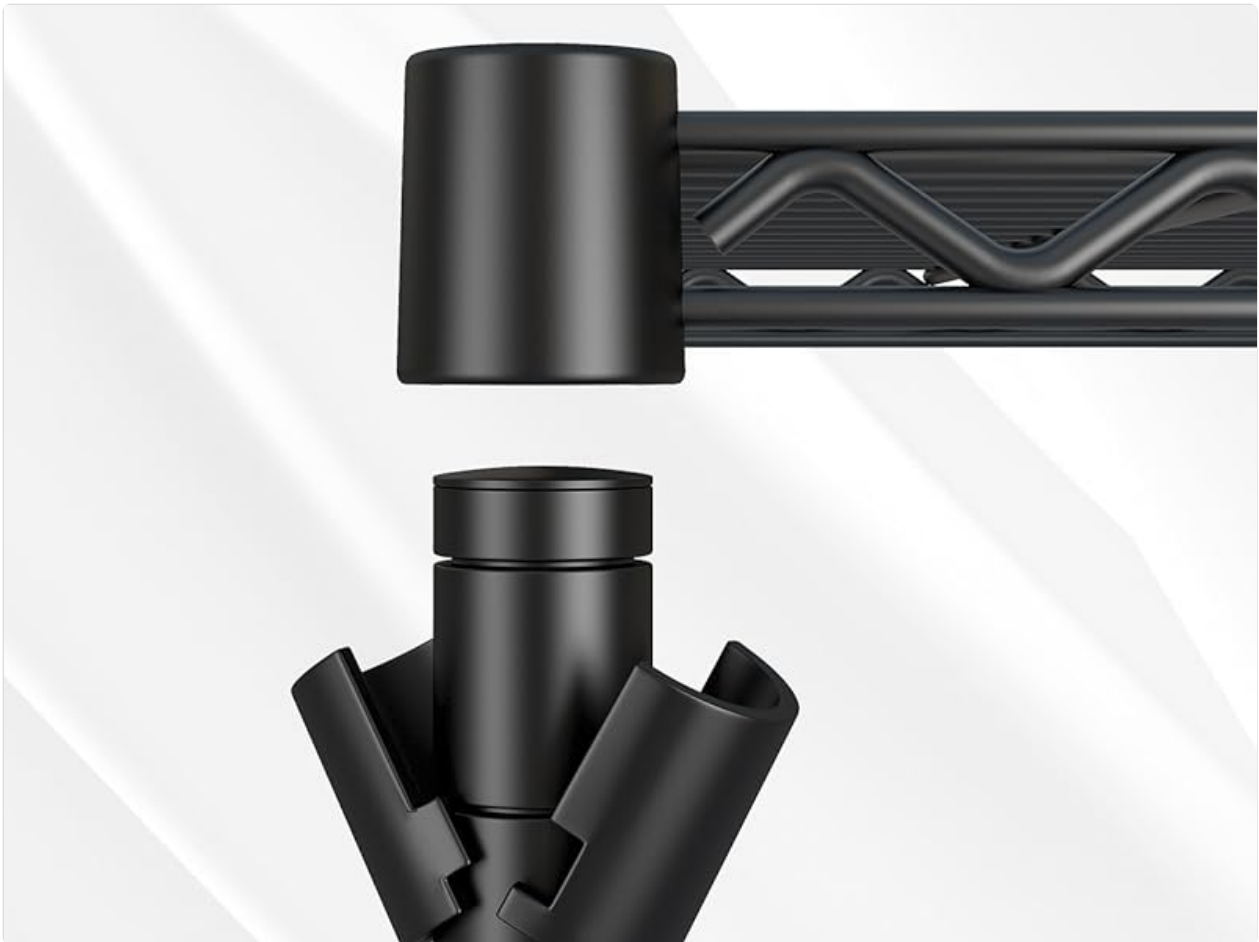
Figure 3.1: Visual guide for the simple 3-step assembly process.

bottom of the poles to stabilize the unit on uneven surfaces.