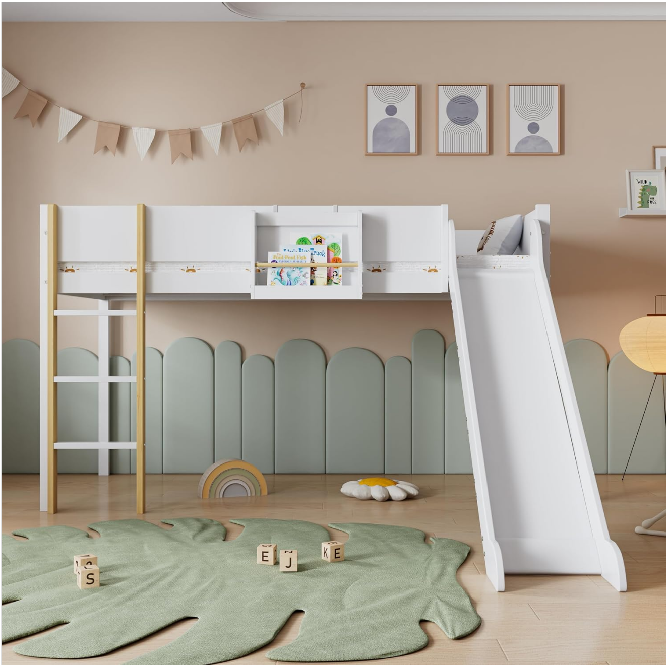
Figure 2: A fully assembled Merax Loft Bed, showcasing the integrated slide, 3-step ladder, and the removable shelf. The bed is designed for children, providing both a sleeping area and a play element.