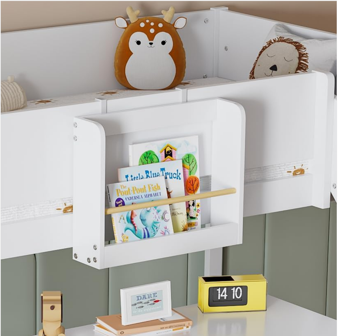
Figure 4: The removable shelf of the Merax Loft Bed shown in use, holding several children's books. This illustrates its practical application for bedside storage.