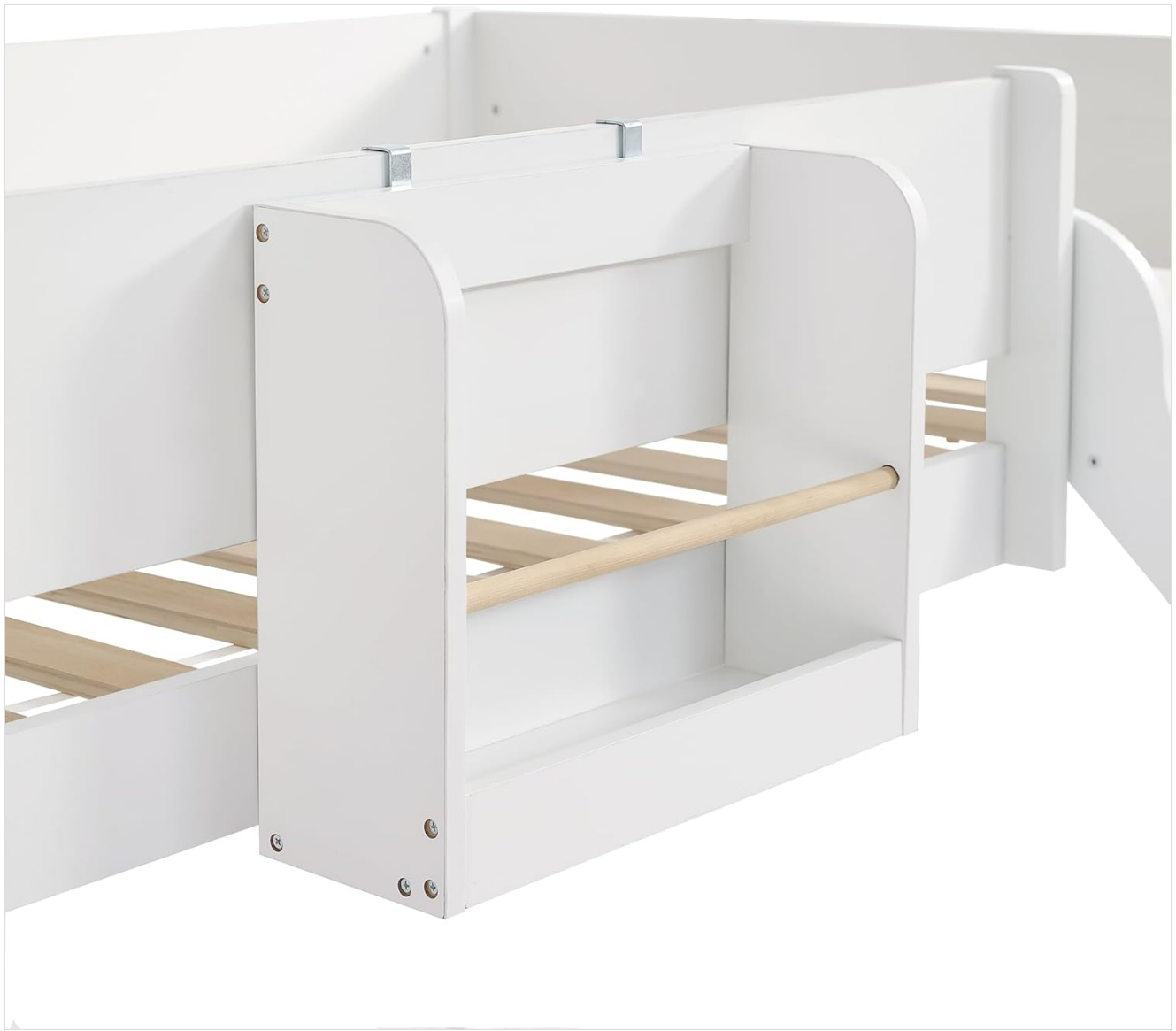
Figure 3: A detailed view of the removable shelf feature on the Merax Loft Bed. This shelf provides convenient storage for books or small items and can be positioned as needed.