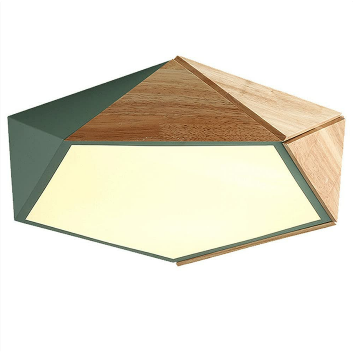
Image: Overall view of the ceiling lamp.