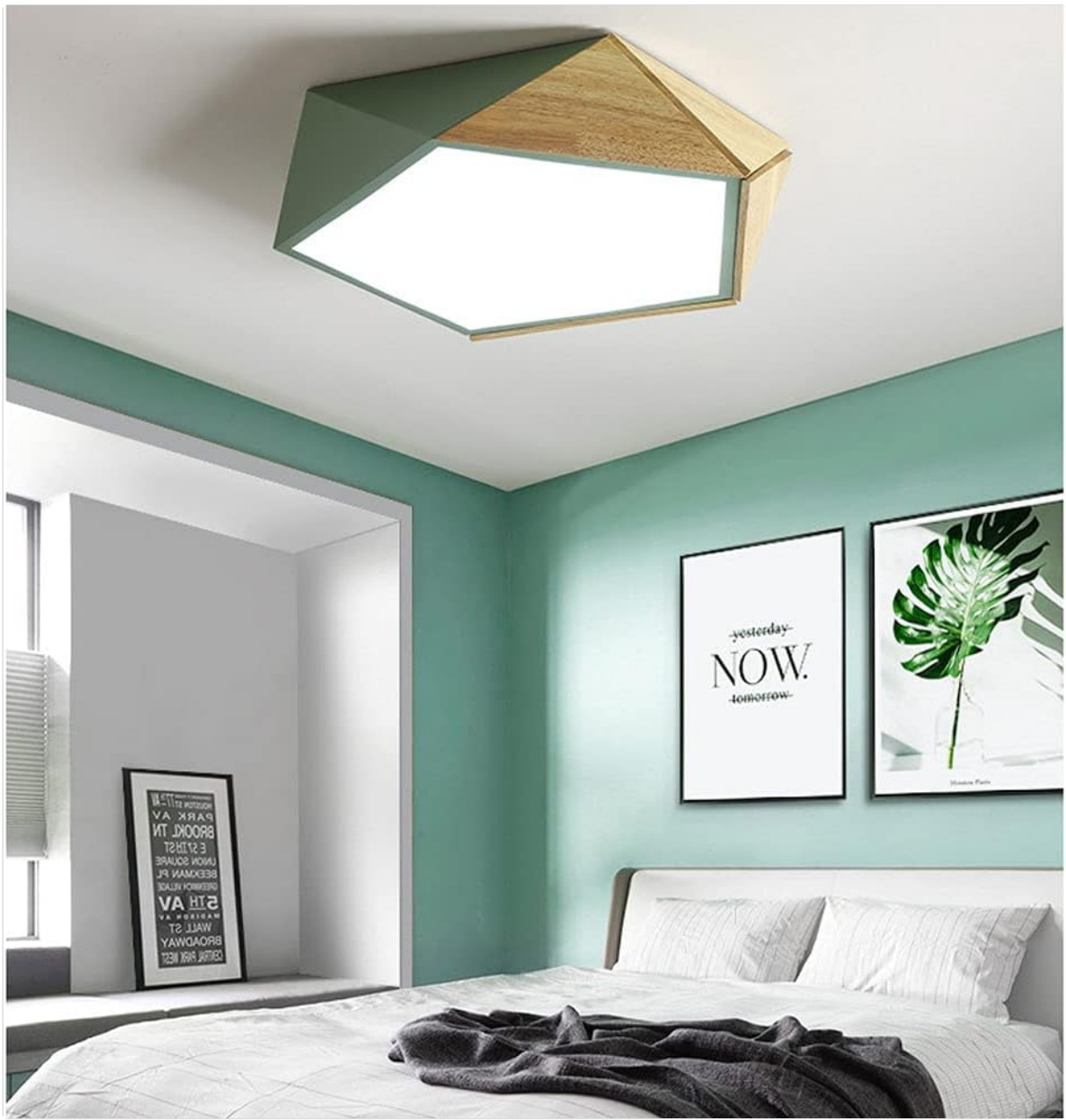
Image: Lamp installed in a bedroom setting.