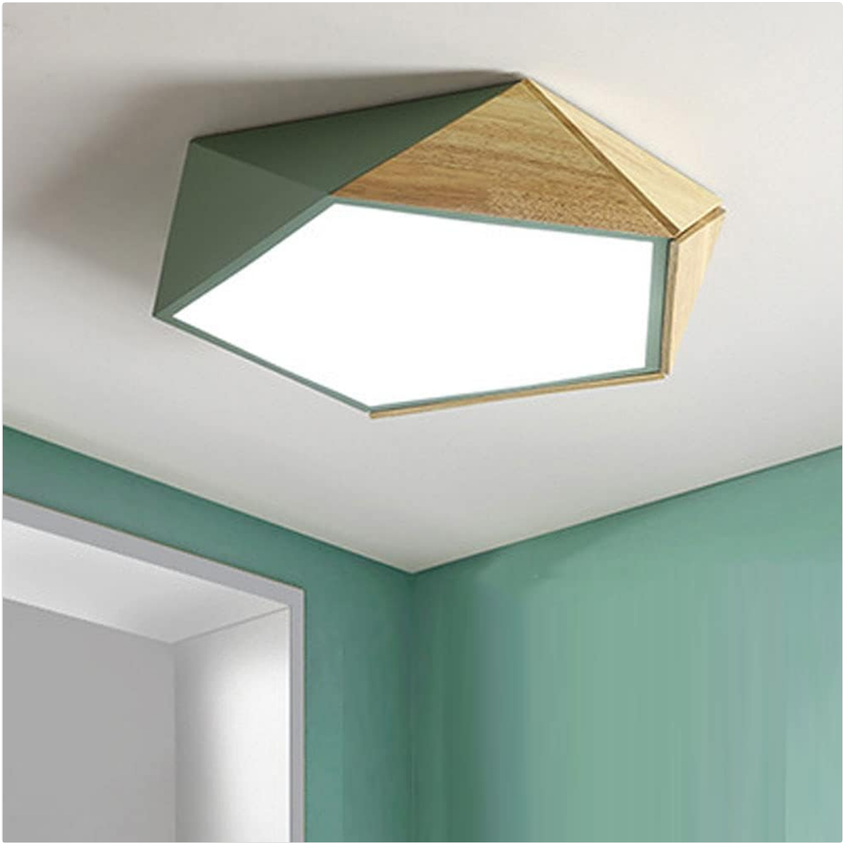
Image: Lamp installed in a living space.