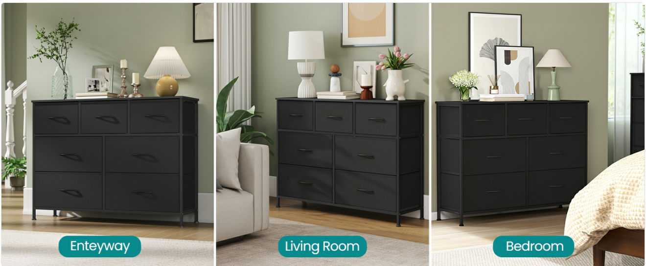
Image: Versatile placement options for the dresser in an entryway, living room, and bedroom.