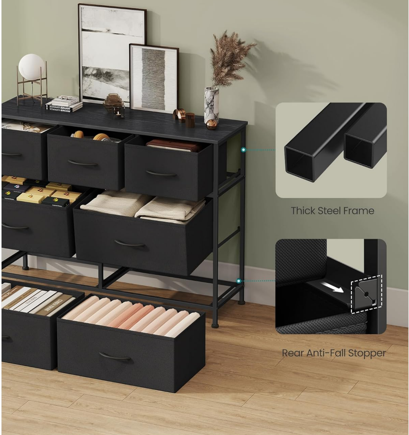
Image: Illustration of the sturdy steel frame and the anti-fall stopper for enhanced stability.