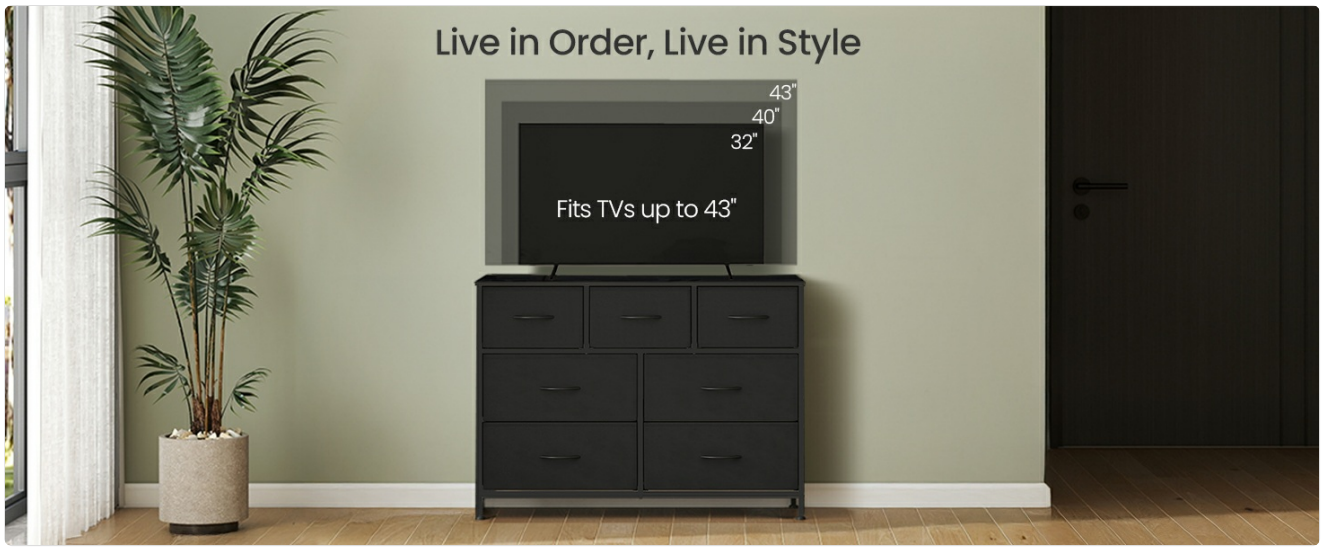
Image: The dresser functioning as a TV stand, suitable for TVs up to 43 inches.