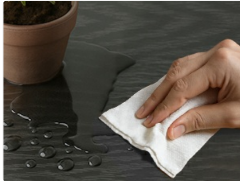
Image: Demonstrating how to clean the dresser's top surface.