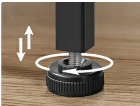
Image: Adjustable feet for leveling the dresser on uneven surfaces.