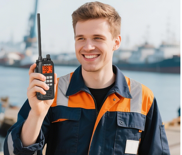
Figure 4.1: The RM15 supports 88 international marine channels.

Canale del trasporto marittimo commerciale