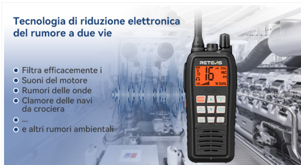
Figure 4.4: Two-way electronic noise reduction for clear communication.

The RM15 features two-way electronic noise reduction technology. This system automatically filters out background noise such as engine sounds, ocean waves, and general vessel clamor, ensuring clear and crisp communication.