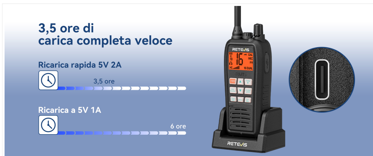
Figure 3.1: Charging options and speed for the RM15 radio.

A full charge typically takes approximately 3.5 hours with a 5V 2A charger. Ensure the charging contacts are clean and free from corrosion for optimal performance.