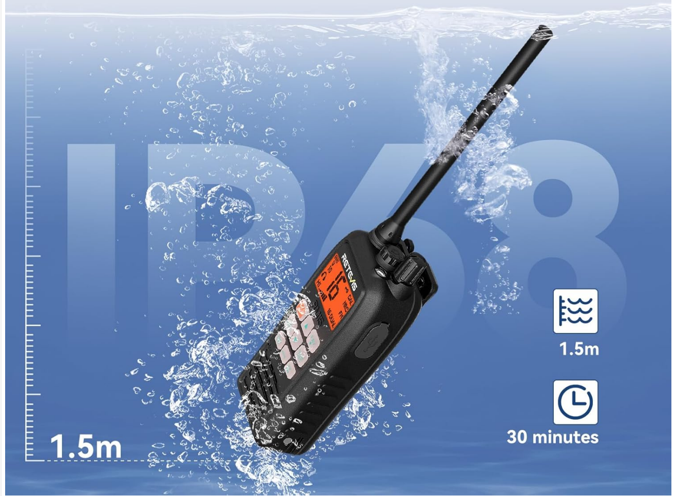
Figure 5.1: The RM15 radio is IP68 waterproof, designed for marine use.

Withstands 1.5m water depth for 30 minutes Corrosionproof and rustproof charging contacts