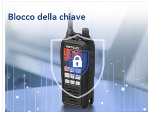
Figure 4.7: The key lock feature prevents unintended operations.

To prevent accidental button presses, activate the key lock feature. Refer to the on-screen menu for key lock activation and deactivation instructions.