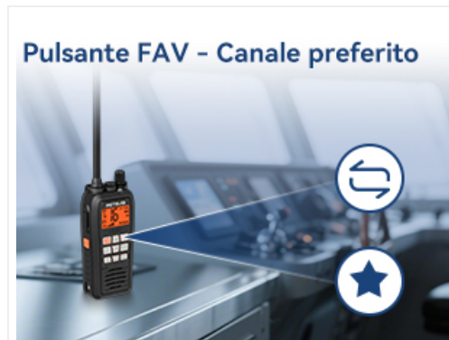
Figure 4.8: Use the FAV button for quick access to your preferred channels.

The FAV button allows quick access to frequently used channels, enabling rapid channel switching and saving time during operation.