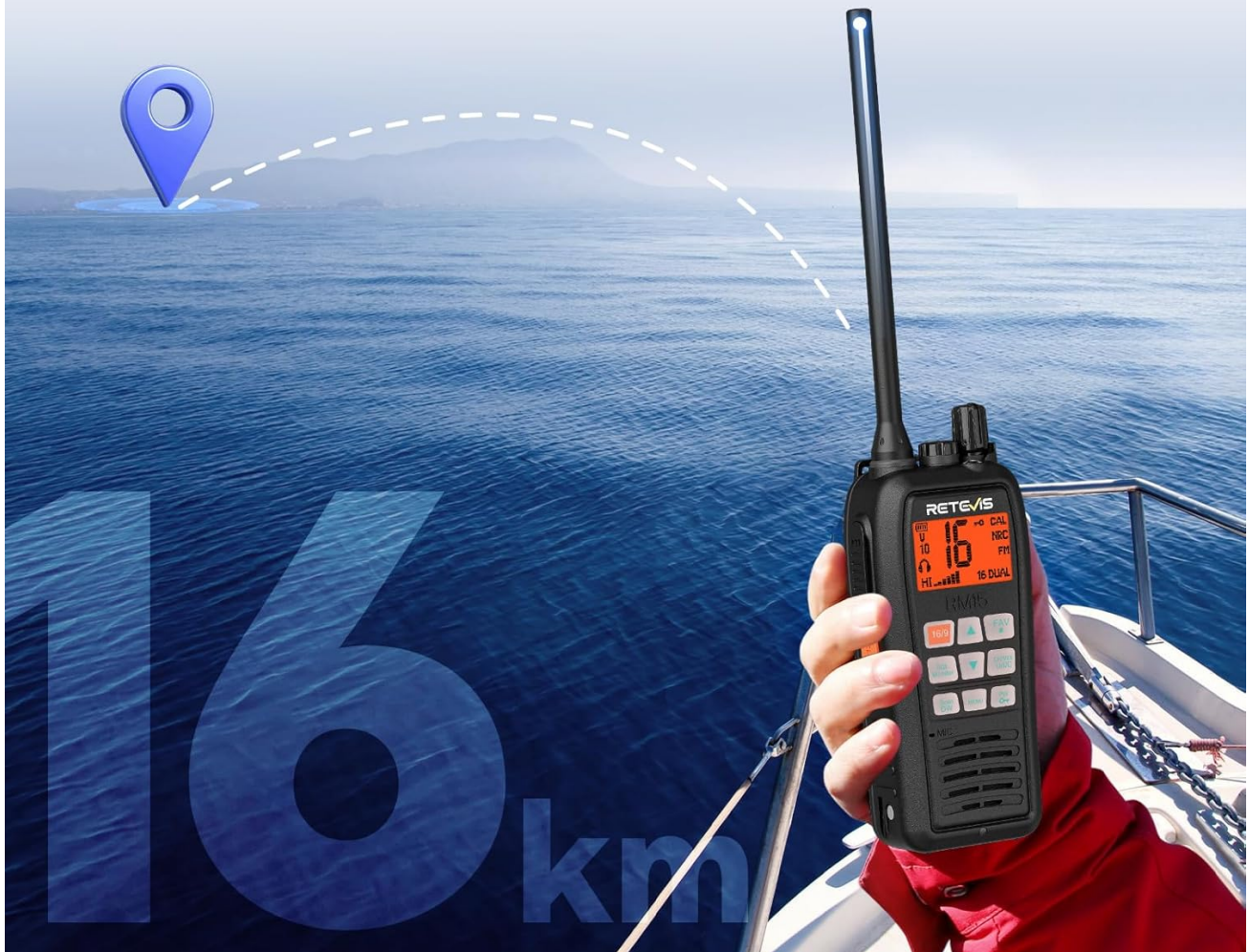
Figure 1.1: The Retevis RM15 radio demonstrating its 16 km long-distance communication capability at sea level.

16km Long-Distance Communication (Sea Level)