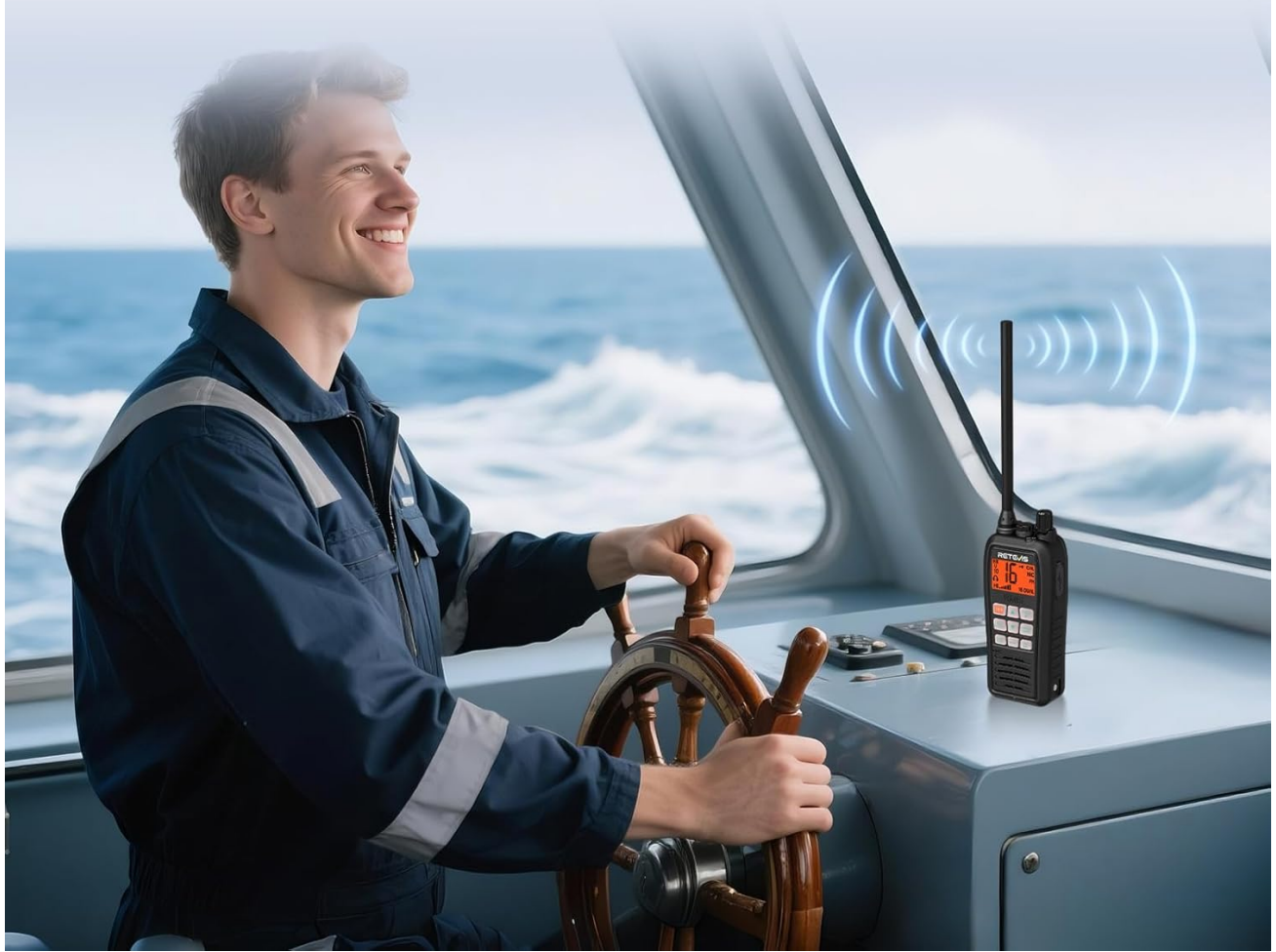
Figure 4.5: Enjoy FM radio on your RM15 for onboard entertainment.