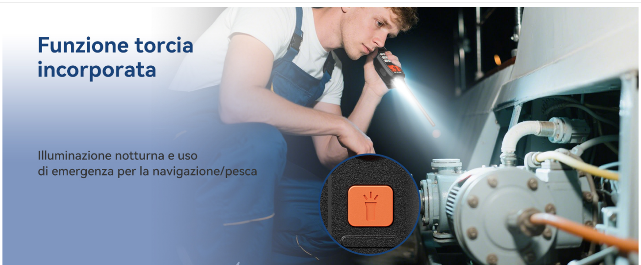
Figure 4.6: The integrated flashlight provides illumination for various situations.

Illuminazione notturna e uso di emergenza per la navigazione/pesca