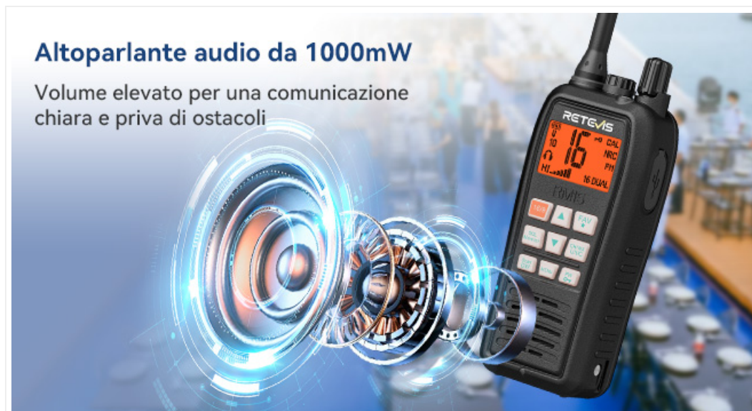
Figure 4.2: The 1000mW audio speaker provides clear sound.

Adjust the audio output volume by rotating the Volume/Power switch. The 1000mW audio speaker ensures clear sound even in noisy marine environments.