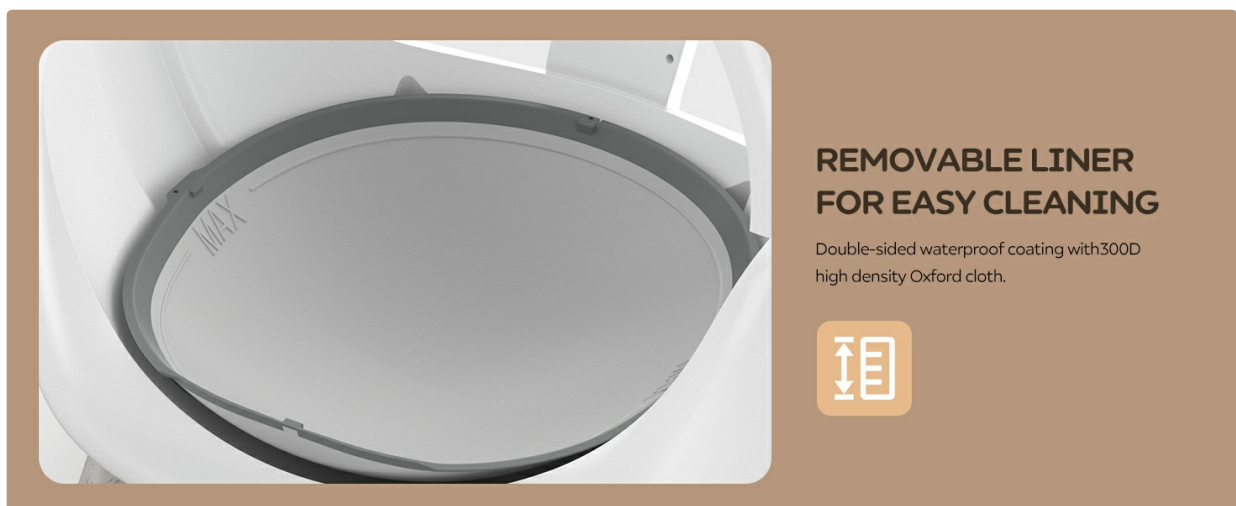
Figure 5.4: Removable liner for easy cleaning.