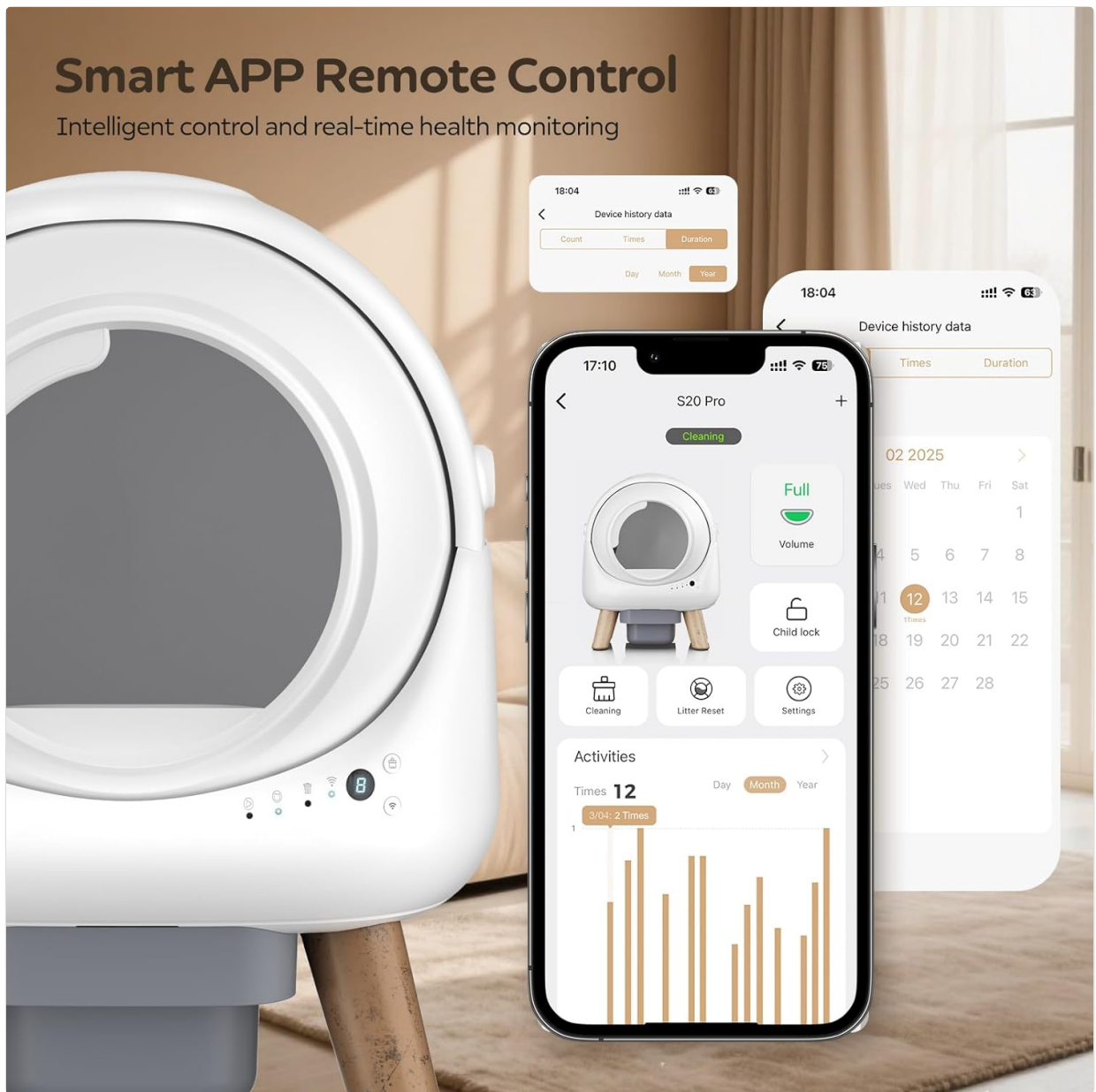
Figure 4.1: Smart App Remote Control interface.