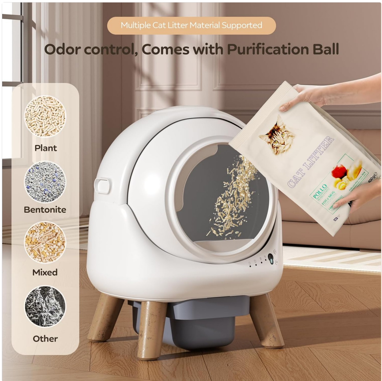
Figure 2.3: Supports multiple cat litter materials for odor control.