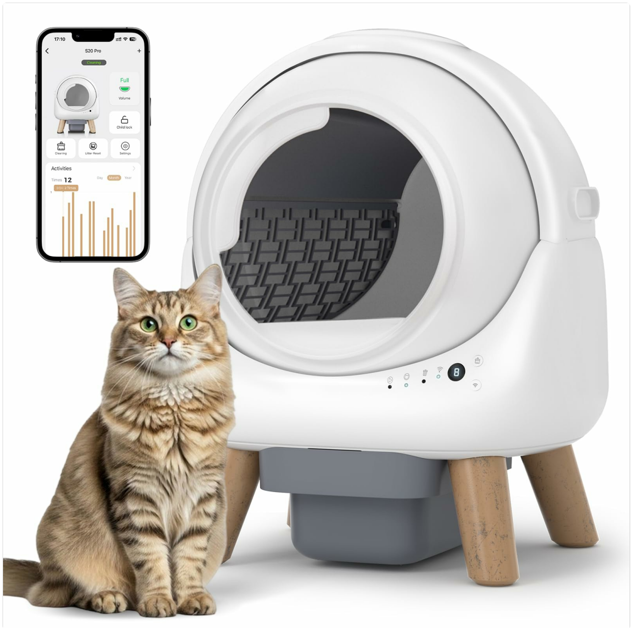
Figure 2.1: Product dimensions and large capacity for cats weighing 2.5-30 lbs.