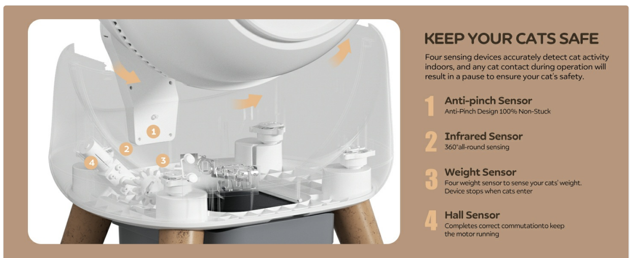
Figure 2.4: Four sensing devices ensure cat safety during operation.