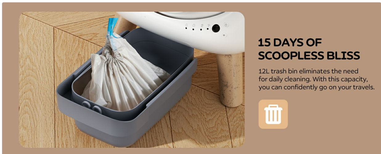
Figure 5.2: The 12L trash bin provides up to 15 days of scoopless convenience.