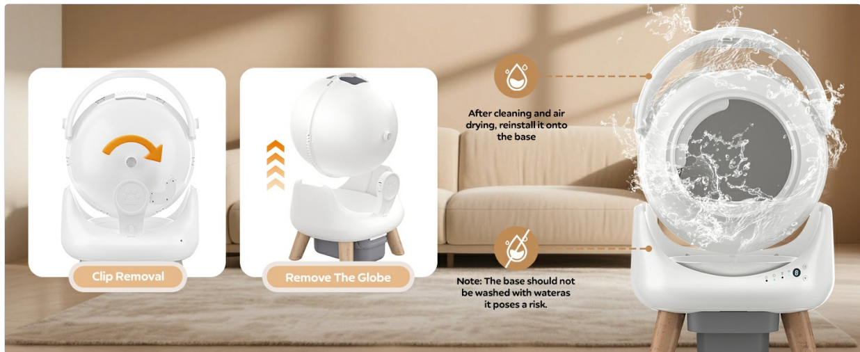
Figure 5.3: Steps for disassembling and cleaning the globe. Do not wash the base.