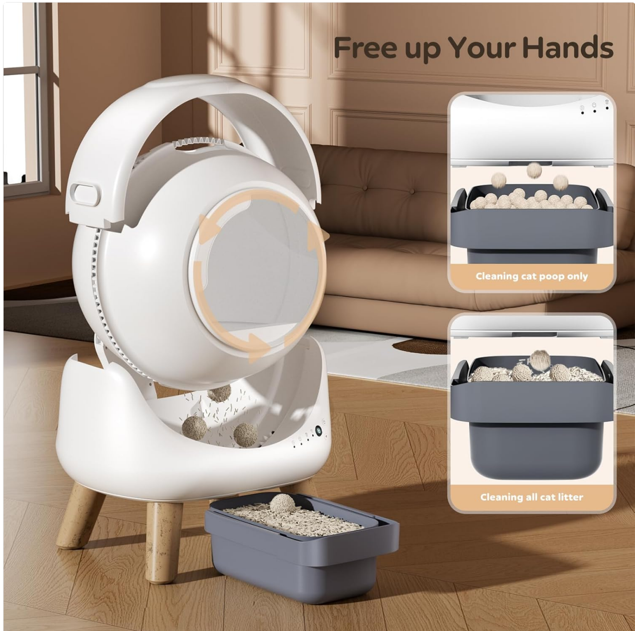
Figure 5.1: Easy removal and replacement of the waste bin.

When the 'Waste Bin Full' indicator illuminates, it's time to empty the waste bin. Simply pull out the drawer from the base, tie off the full garbage bag, and replace it with a new one. The 12L trash bin can hold waste for up to 15 days for a single cat.