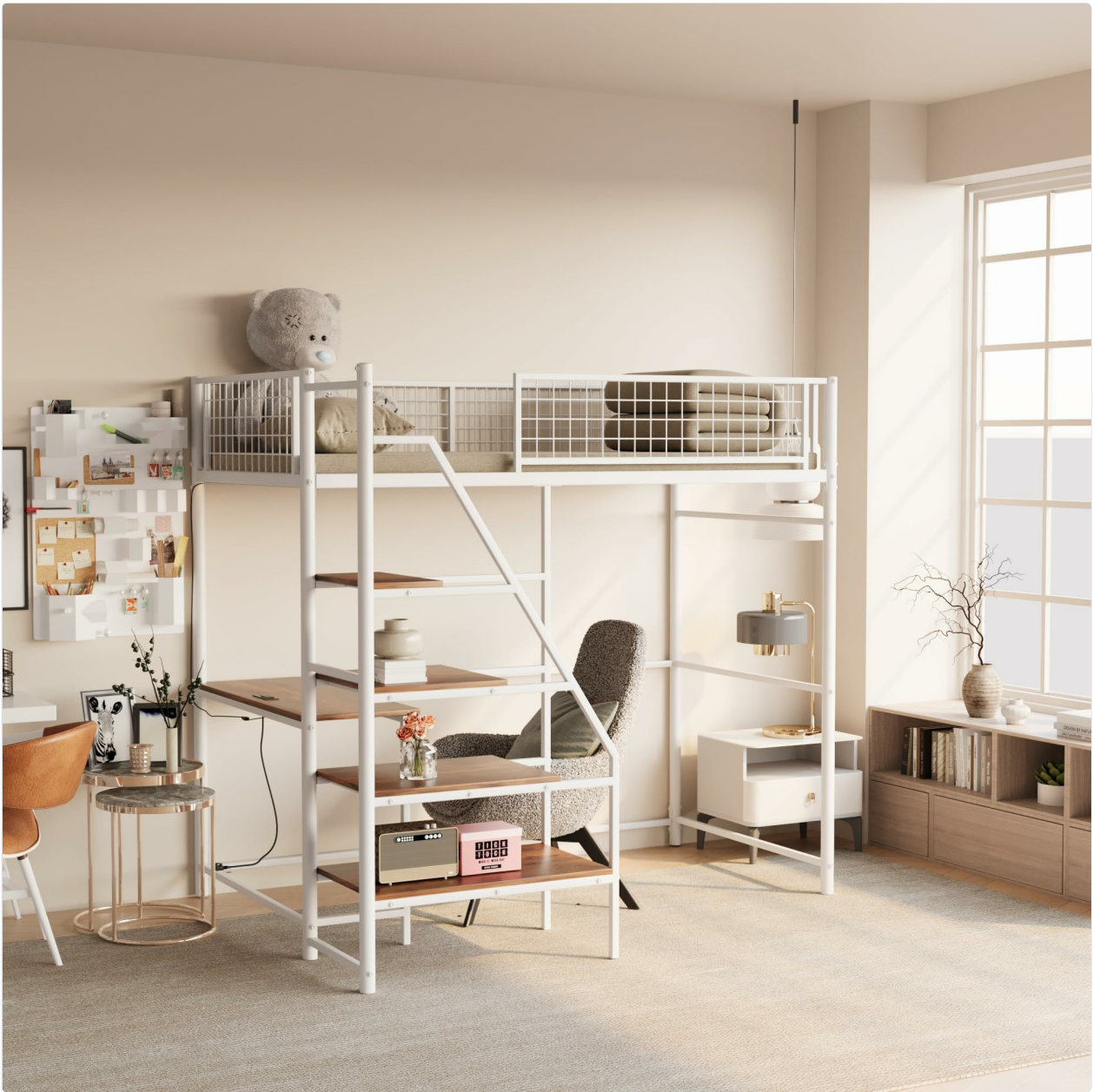
Figure 1: Fully assembled KEIKI Twin Sized Loft Metal Bed with Desk and Stairs.