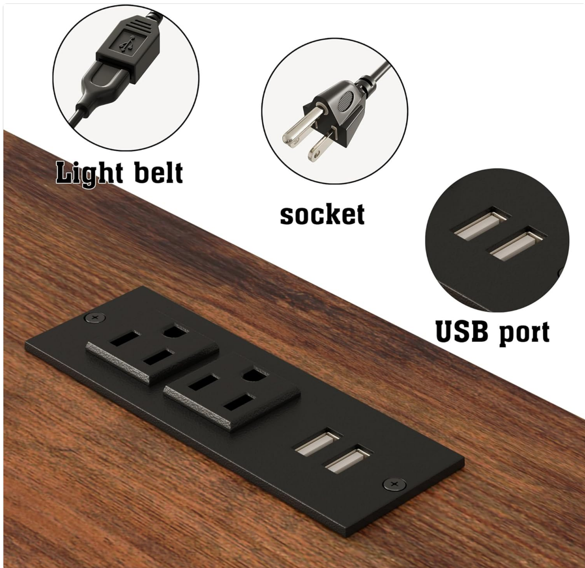
Figure 2: Detail of the integrated charging station.