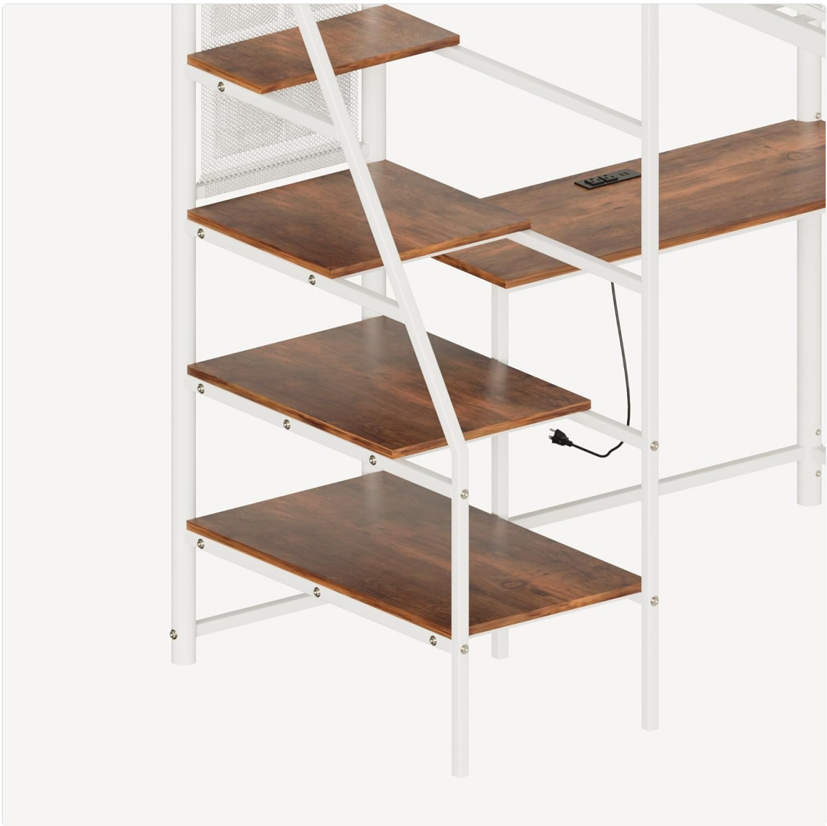
Figure 3: Stairs featuring integrated storage shelves.