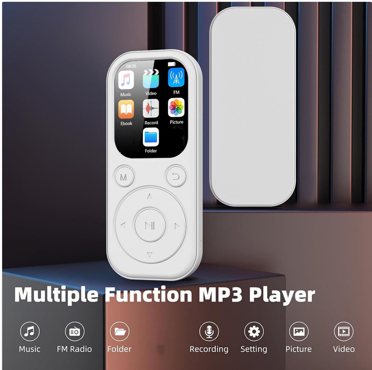
Image: Front view of the Yoidesu MP3 Player displaying its main menu interface with various function icons.