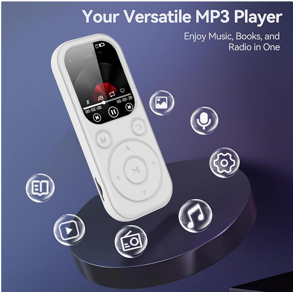
Image: The Yoidesu MP3 Player highlighting its versatile functions, including music, e-books, FM radio, recording, and more.

The device supports a wide range of audio formats including MP3, WMA, WAV, APE, FLAC, AAC-LC, M4A, and OGG. It also supports AVI video format (240x288 resolution) and TXT e-book format.