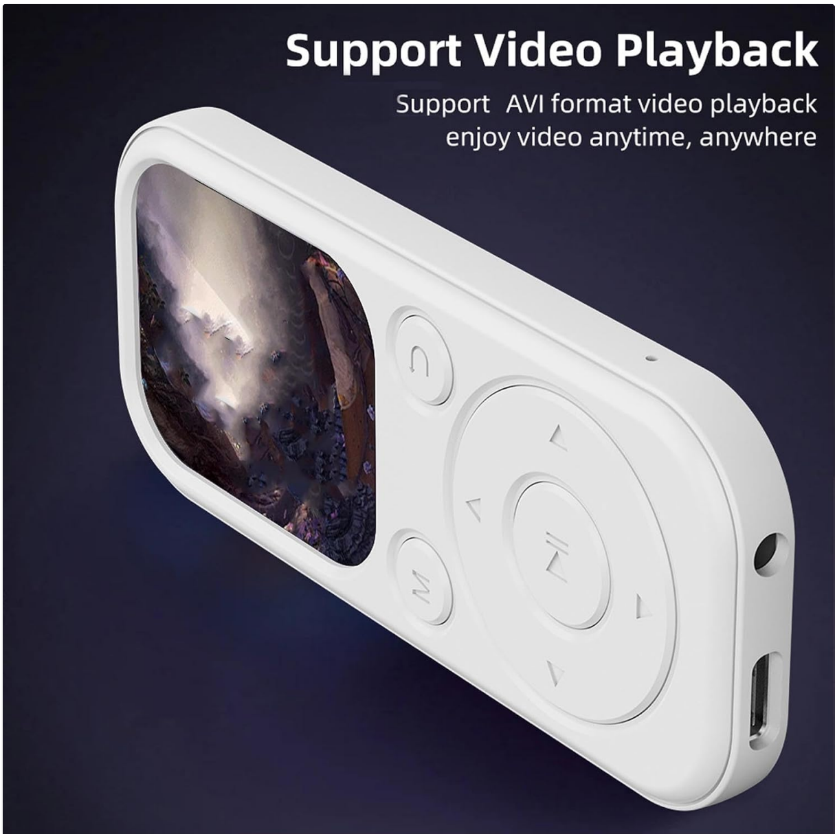
Image: The Yoidesu MP3 Player screen showing video content.

Support AVI format video playback enjoy video anytime, anywhere