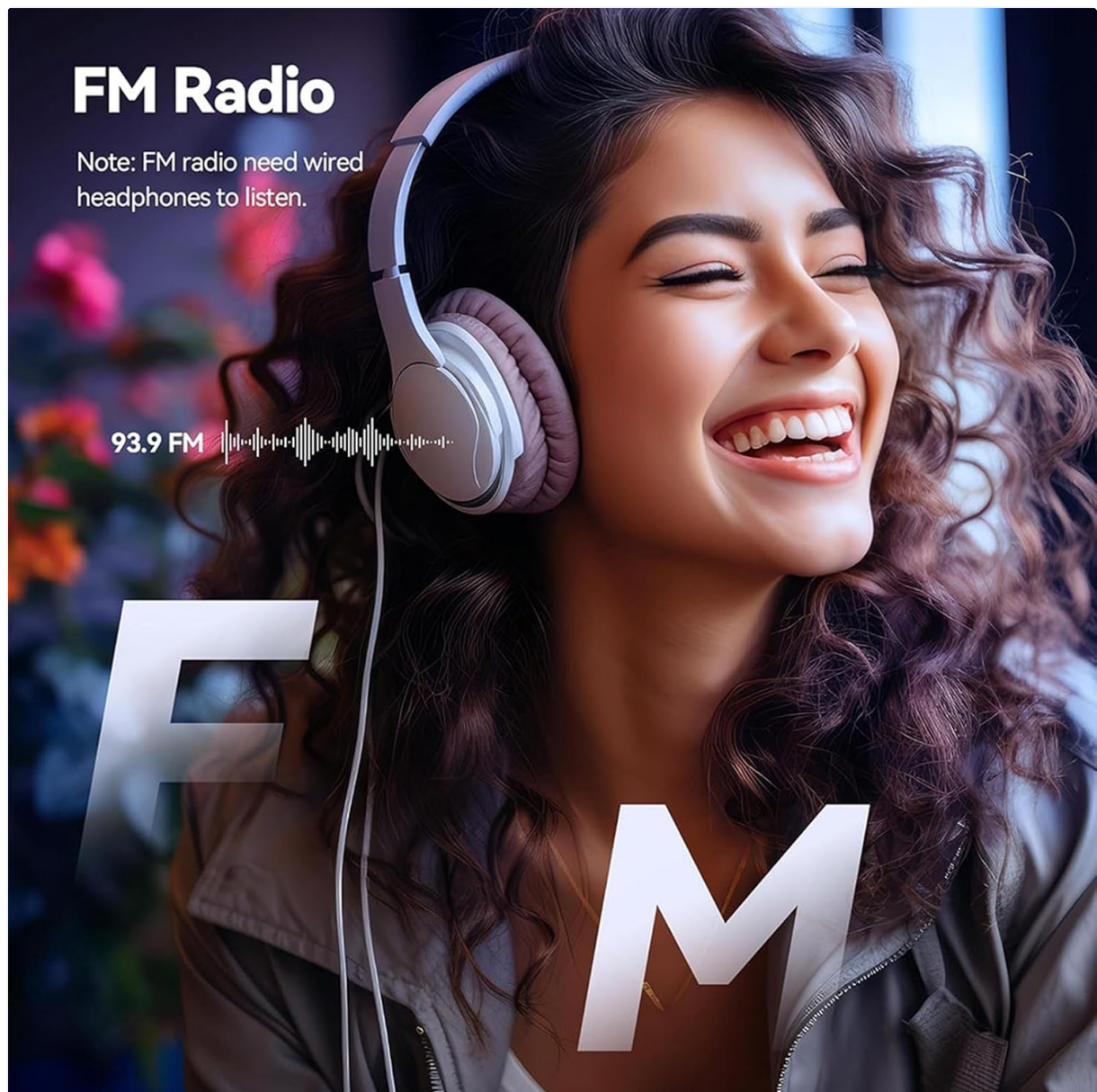
Image: A user enjoying FM radio with wired headphones connected to the MP3 player.

To use the FM radio function, you must connect wired headphones (not included) to the 3.5mm jack, as they act as the antenna.