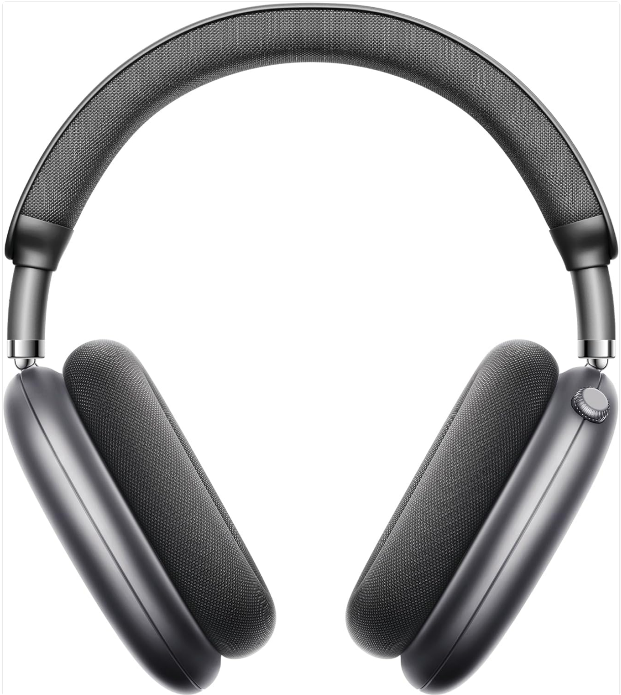
Figure 1: Picun F8 Pro Headphones, front view.