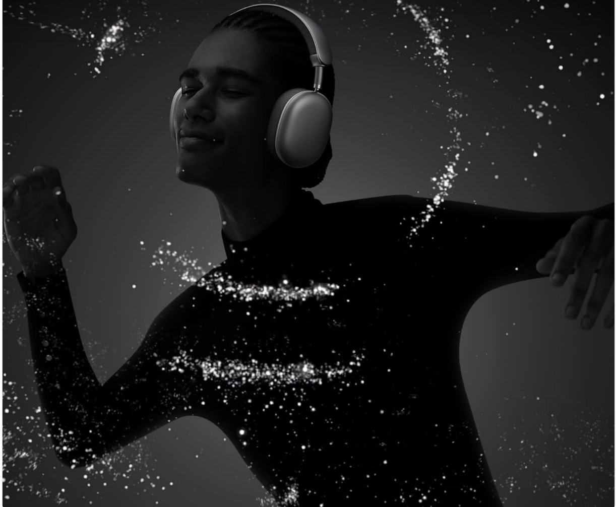
Figure 2: Illustration of -52dB Active Noise Cancelling in action.

•52db ANC Tech Intelligently Handles External Environmental Noise.