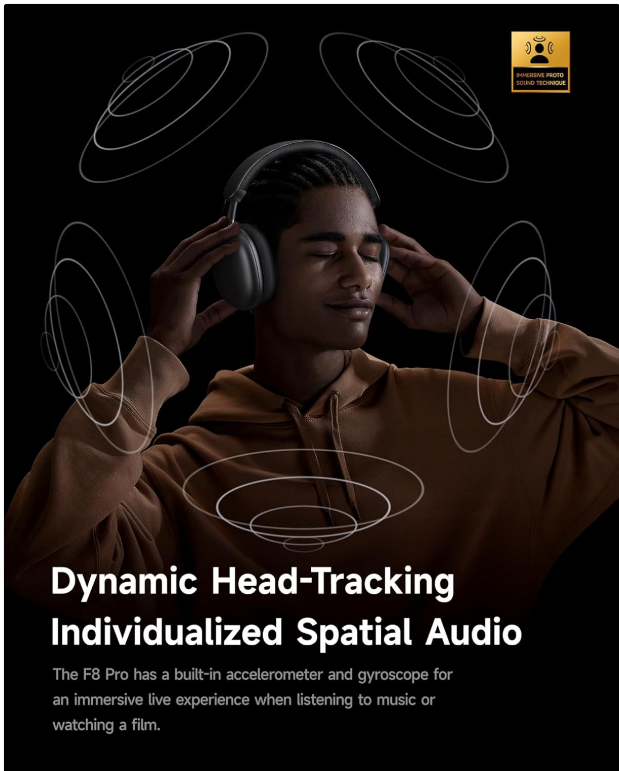
Figure 5: Dynamic Head-Tracking for Individualized Spatial Audio.

Your browser does not support the video tag.