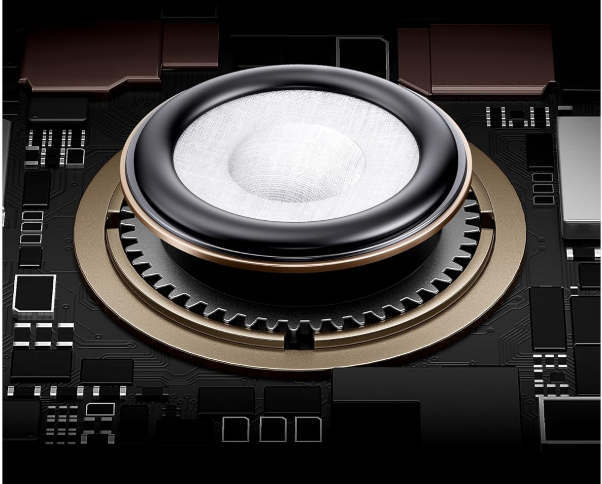
Figure 7: The 40mm Titanium-Plated Diaphragm Speaker for powerful sound.