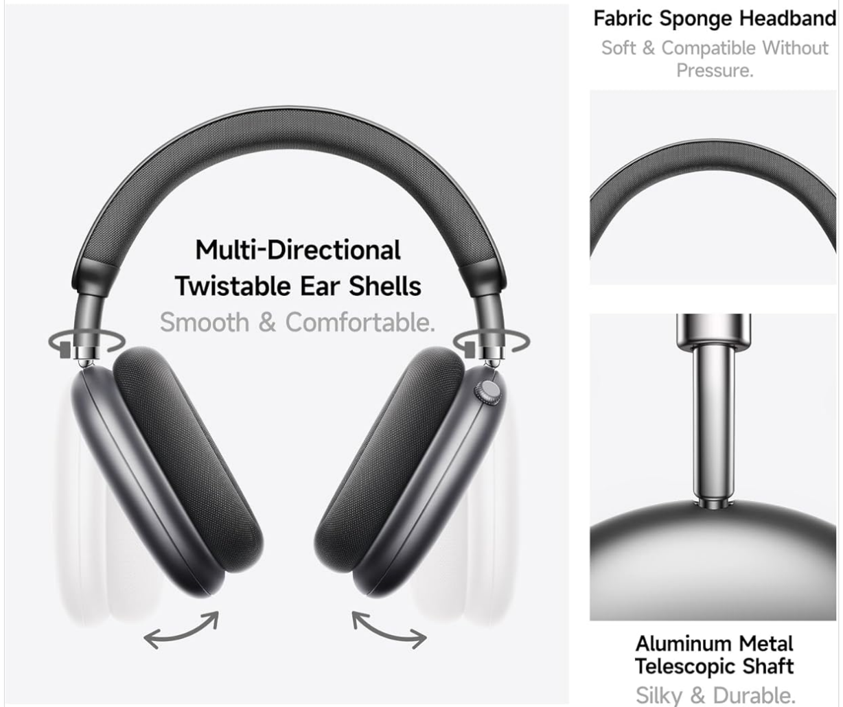
Figure 8: Design features for customized comfort and fit.

Suitable for different people's wearing needs and appearance aesthetics.