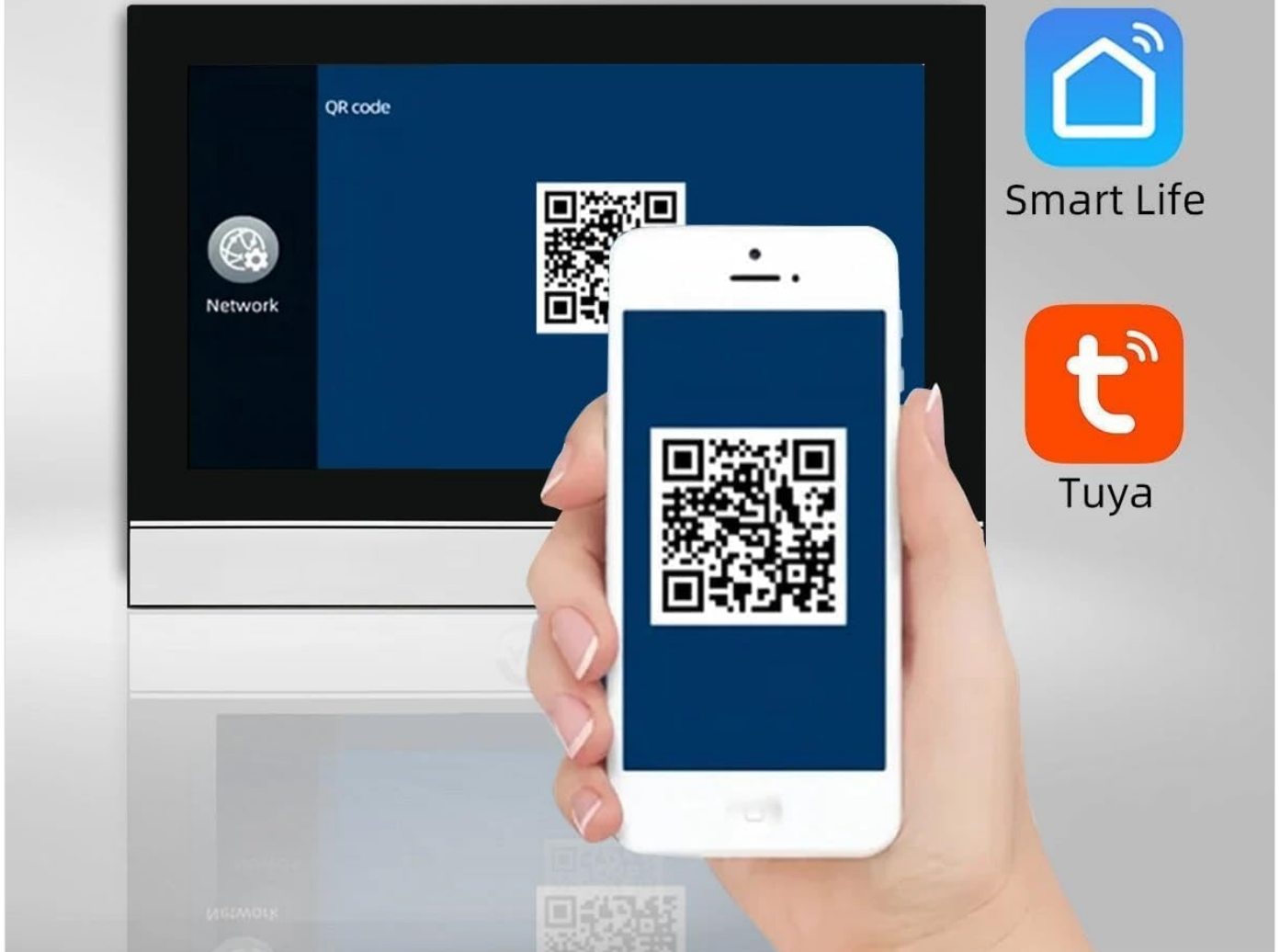
Figure 3.5: Easy internet connection via QR code. This image demonstrates the simple process of scanning a QR code on the monitor with your smartphone to bind the device to the Tuya or Smart Life app.

Scan QR code on the monitor to bind the APP