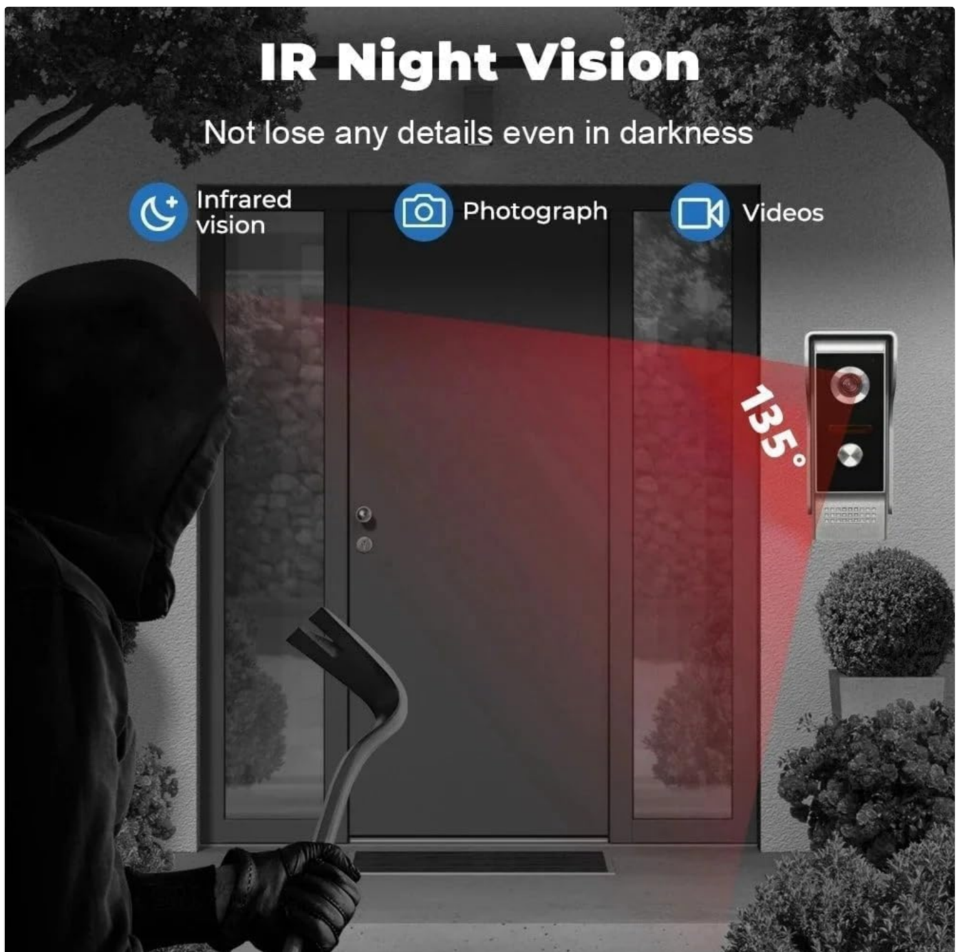
Figure 4.5: IR Night Vision. This image demonstrates the infrared night vision capability, ensuring clear details are captured even in complete darkness with a 135-degree wide angle.