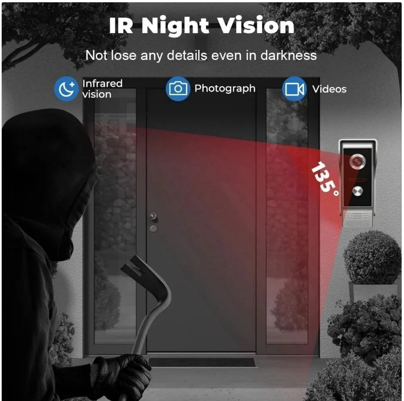
Figure 3.2: Outdoor doorbell unit. This image shows the compact design of the outdoor doorbell, suitable for wall mounting near an entrance.