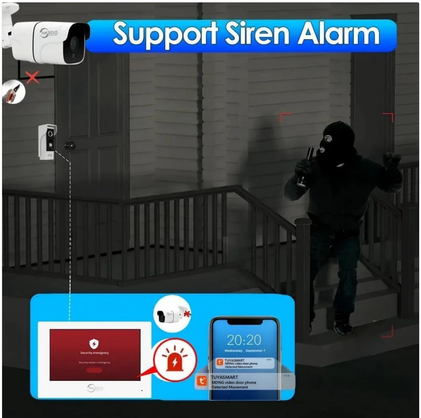
Figure 4.4: Support Siren Alarm. This diagram illustrates how the system's motion detection can trigger a siren alarm and send notifications to your smartphone, enhancing security.