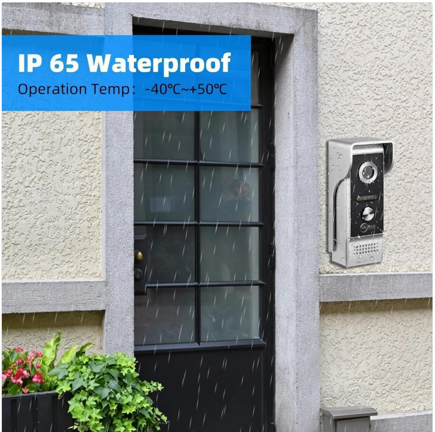
Figure 3.3: IP65 Waterproof. This image demonstrates the outdoor doorbell's IP65 weatherproof rating, showing it functioning reliably even under rainfall.