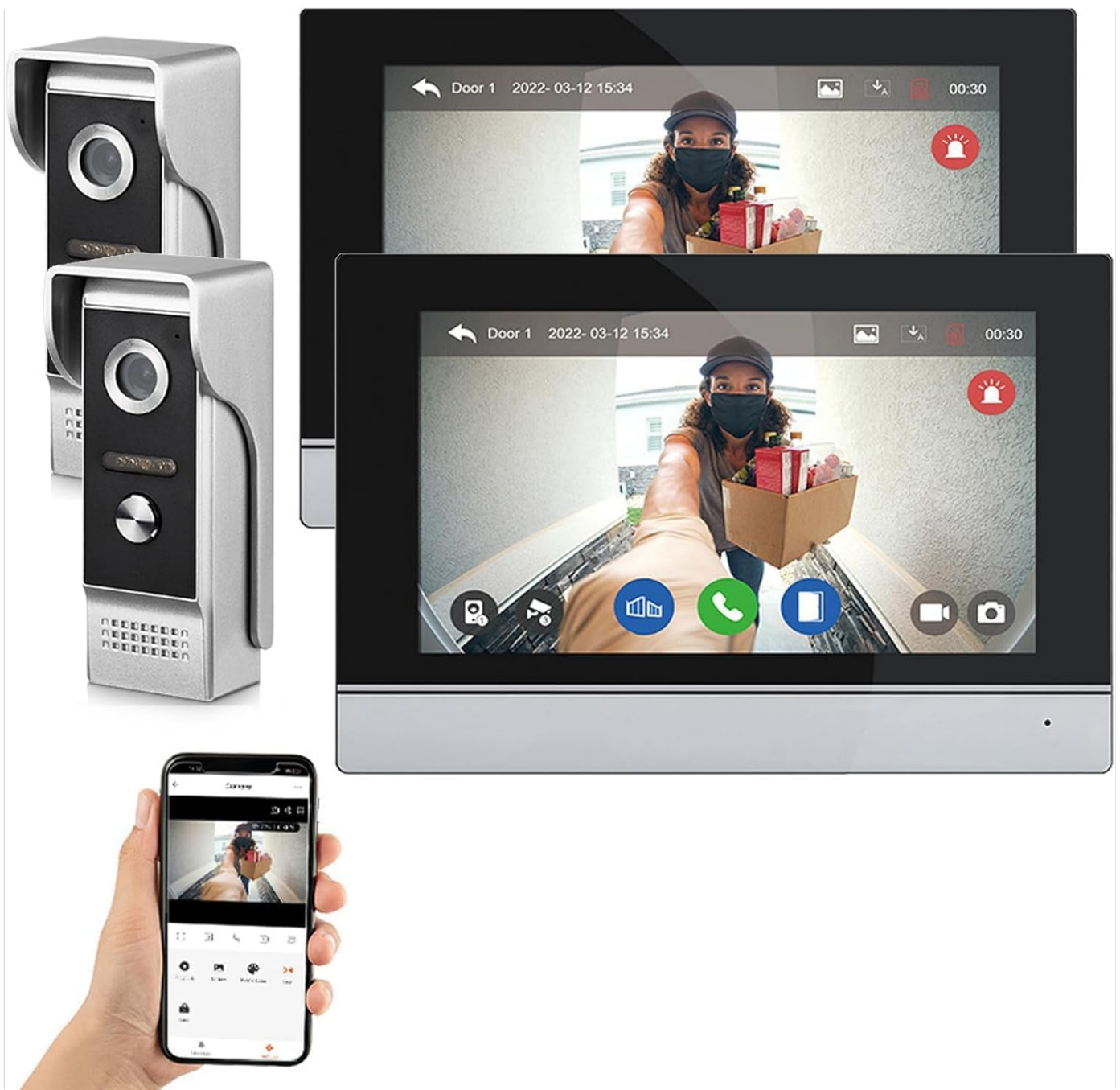
Figure 3.4: Indoor monitors and app view. This image showcases the indoor monitors displaying live video from the doorbell, alongside the mobile app interface for remote access.