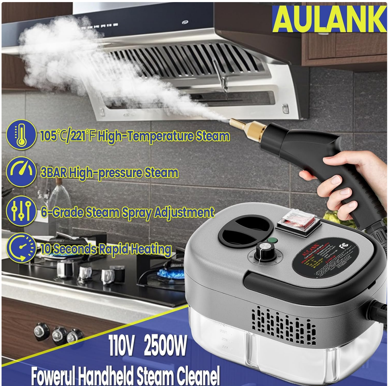
Figure 1: AULANK 2500W Handheld Steam Cleaner in action, demonstrating its high-temperature steam for cleaning kitchen surfaces.