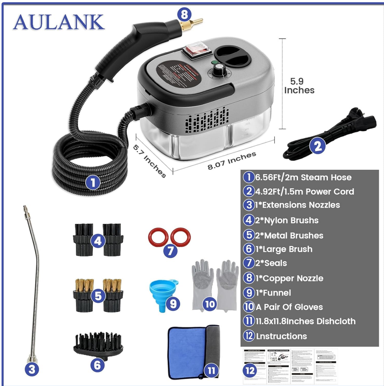
Figure 3: Complete set of accessories included with the AULANK Steam Cleaner.