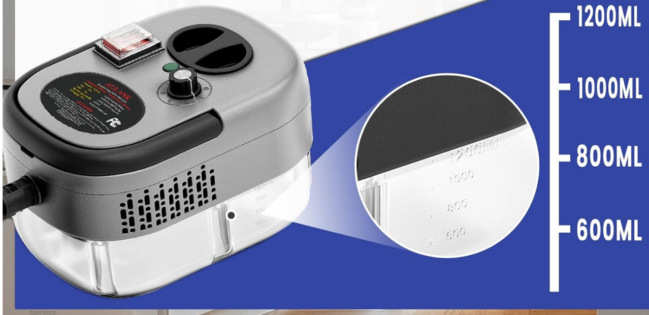
Figure 4: The 1.2L water tank allows for extended cleaning without frequent refills.