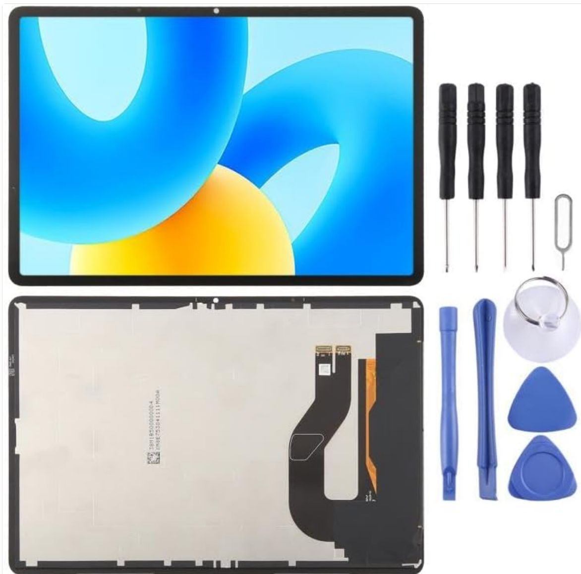
Figure 2: The replacement screen assembly and typical repair tools.