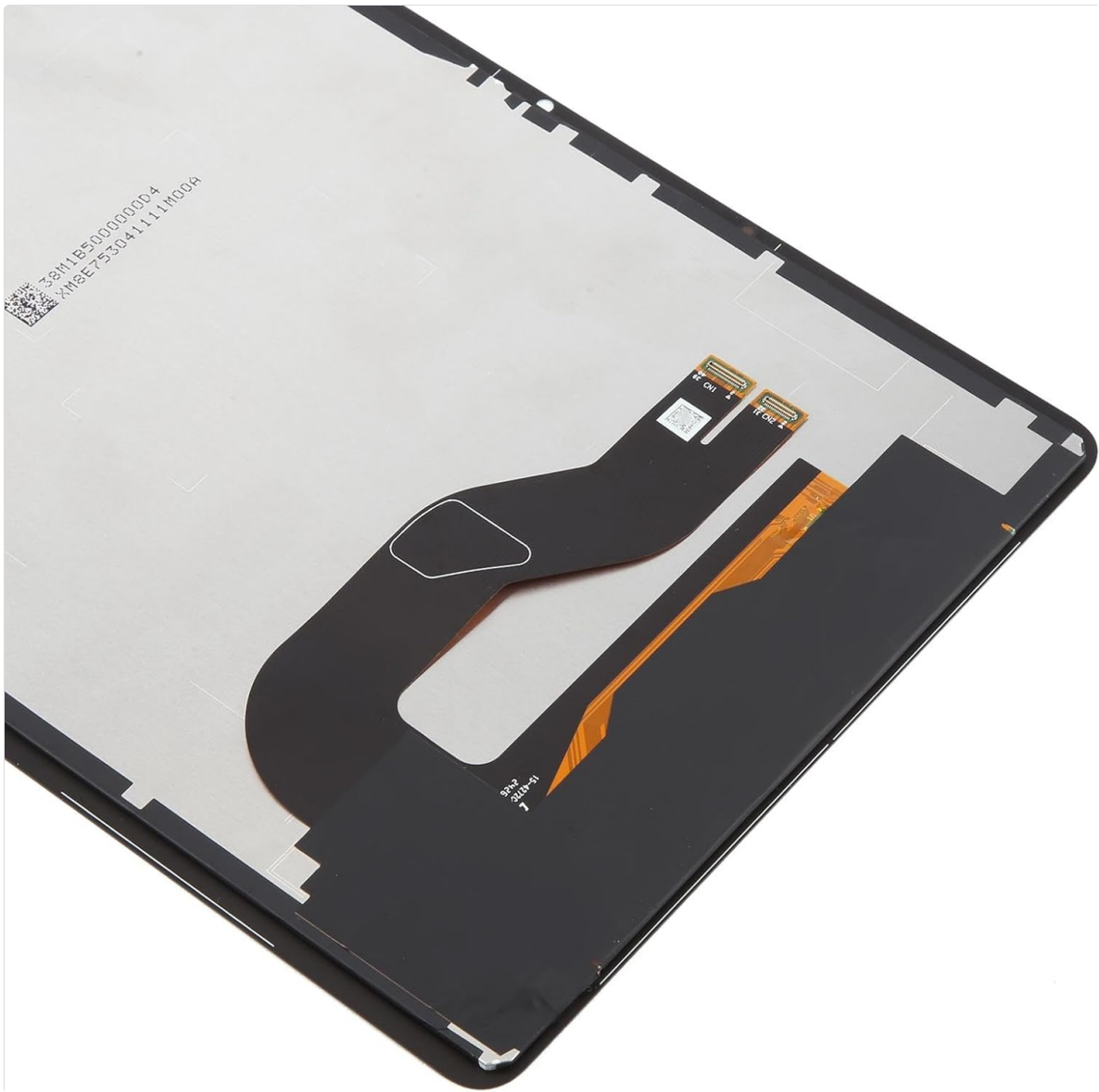
Figure 3: Detail of the flex cables on the reverse side of the screen. Handle these cables with extreme care.