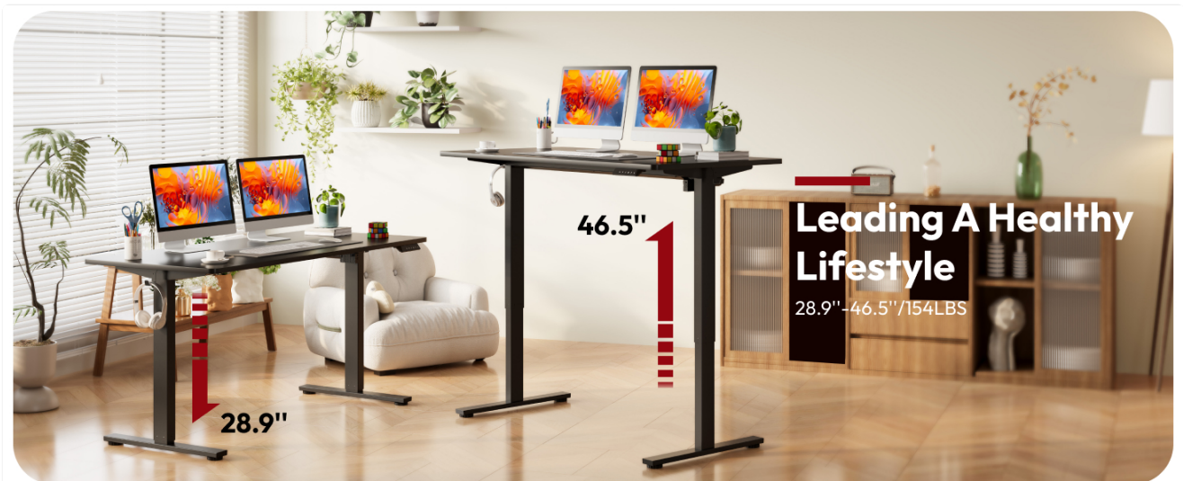
Figure 5.2: Visual representation of the desk's height adjustment range, from 28.9 inches (sitting) to 46.5 inches (standing).