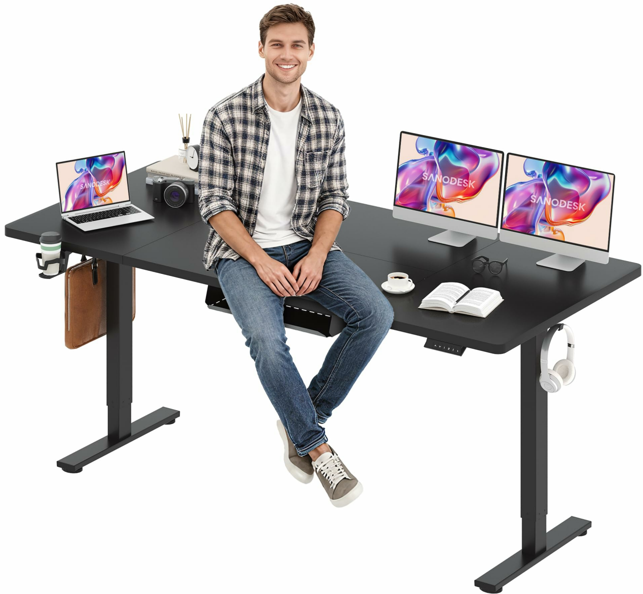
Figure 1.1: The SANODESK Electric Standing Desk with a black frame and black top, showcasing its large surface area.